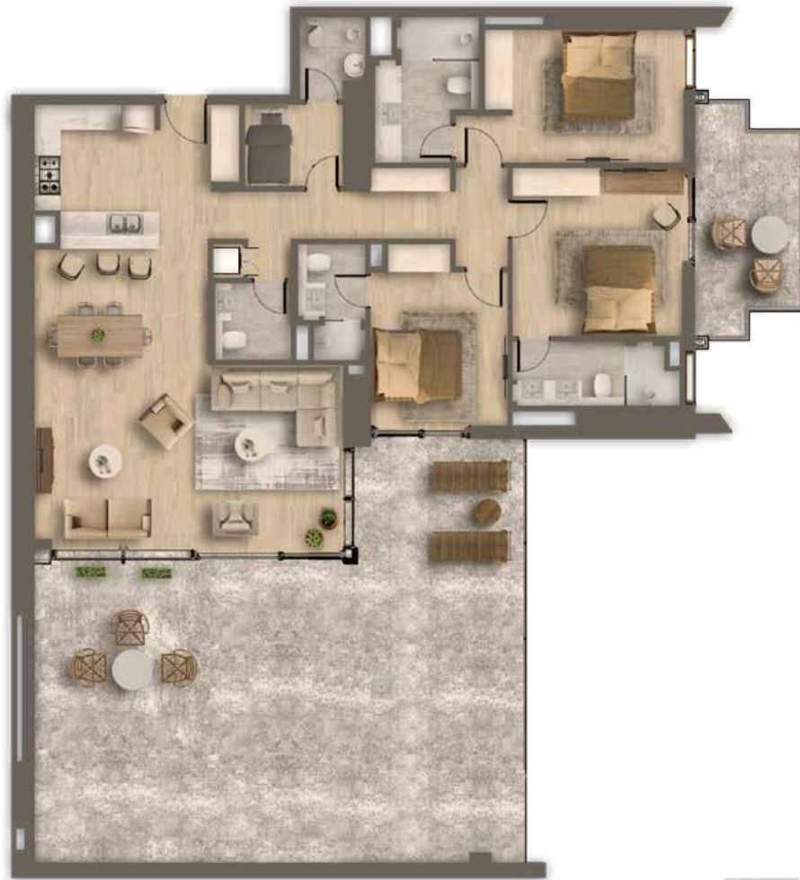
Type D 2,769 sq.ft