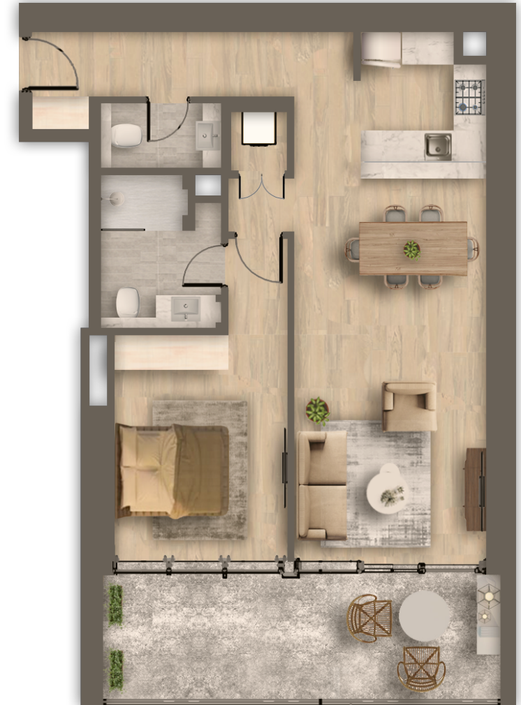
Type B1 From 996 sq.ft to 1,013 sq.ft