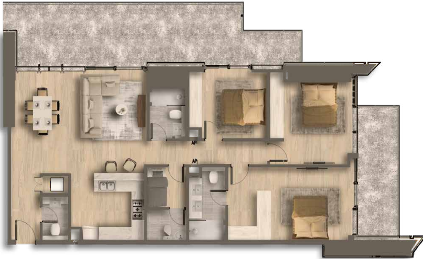
Type A From 1,674 sq.ft to 1,923 sq.ft