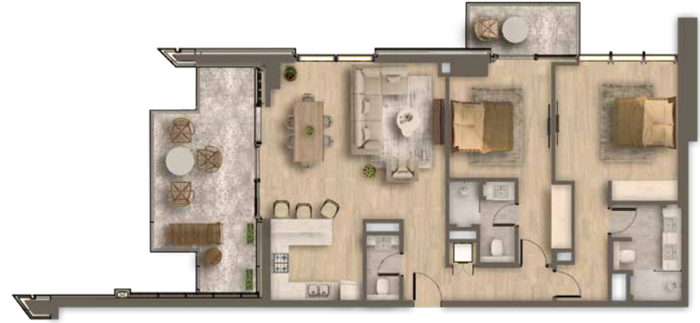
Type C From 1,321 sq.ft to 1,487 sq.ft