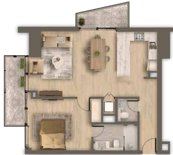
Type C From 847 sq.ft to 927 sq.ft