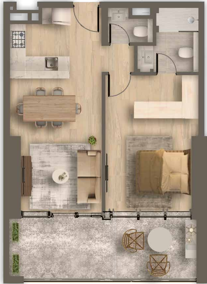
Type A From 654 sq.ft to 796 sq.ft