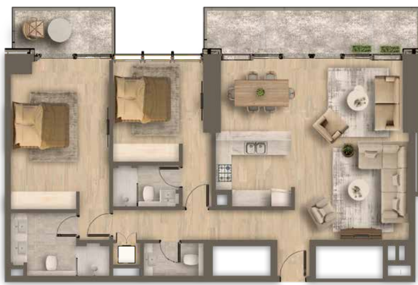
Type A 1,375 sq.ft