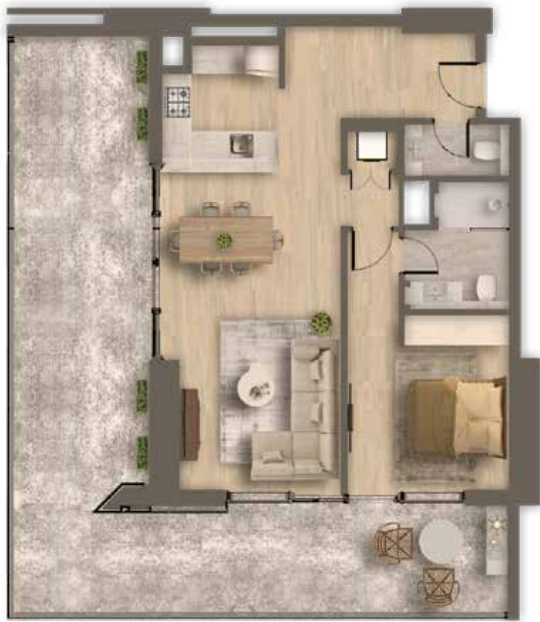
Type B2 878 sq.ft