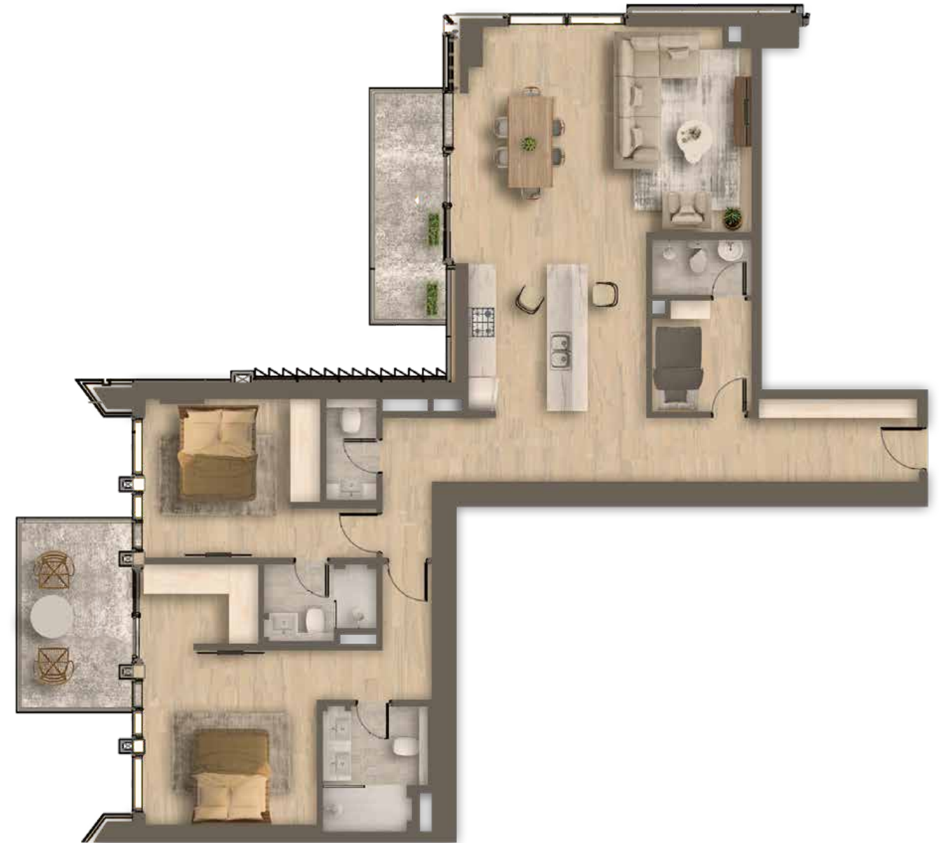
Type M From 1,595 sq.ft to 1,643 sq.ft