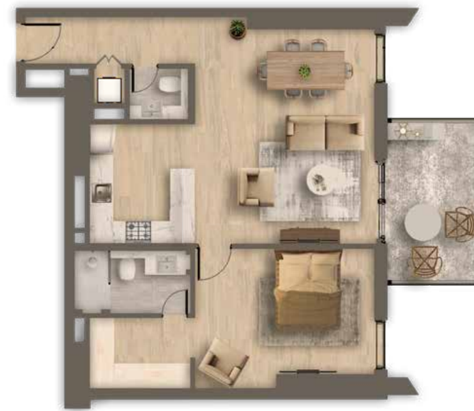
Type D 920 sq.ft