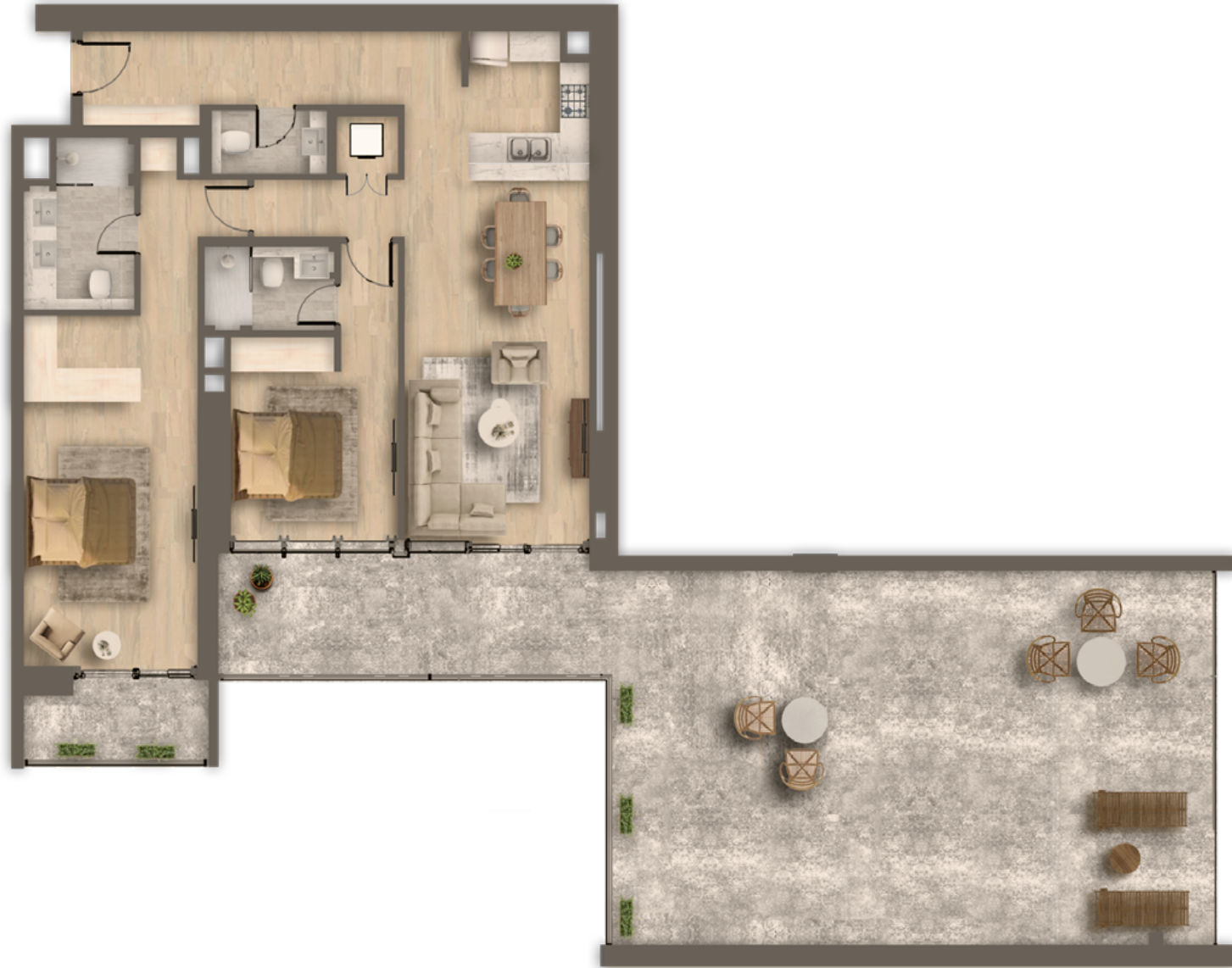
Type E 2,391 sq.ft