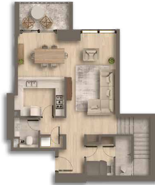
Type DPC 1,737 sq.ft