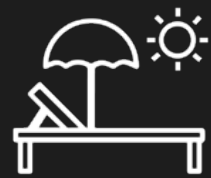
Outdoor Lounging Pool