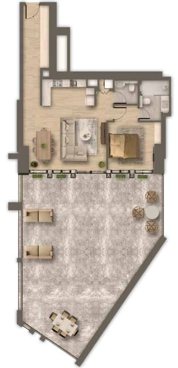
Type E From 900 sq.ft to 1,829 sq.ft