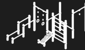
Outdoor Calisthenics Park