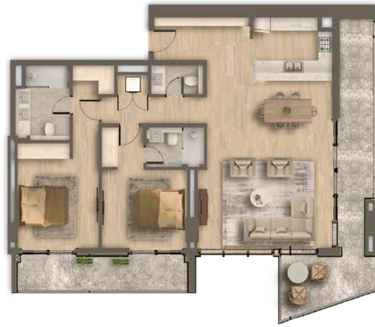
Type B From 1,467 sq.ft to 1,677 sq.ft