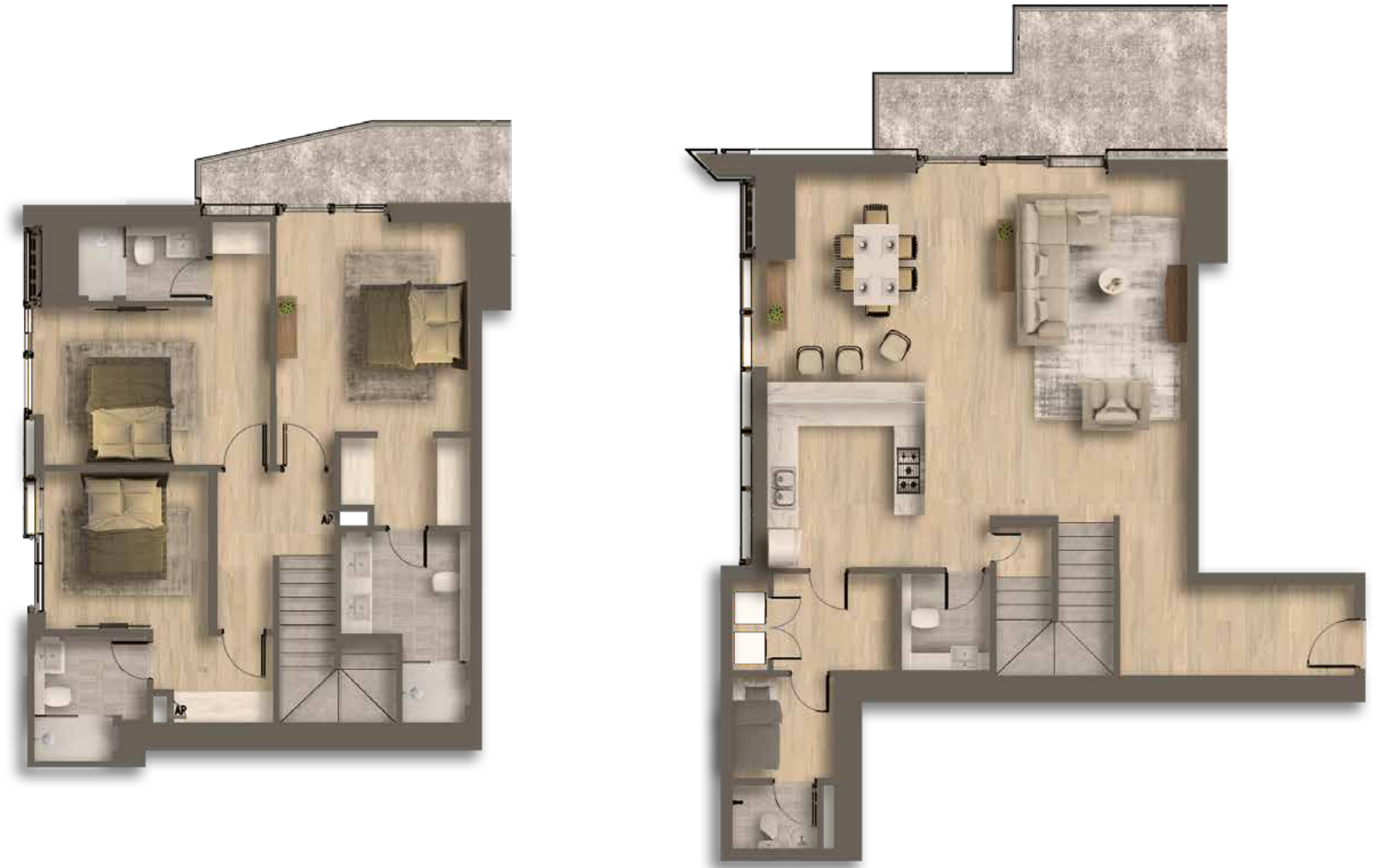
Type DP 2,344 sq.ft