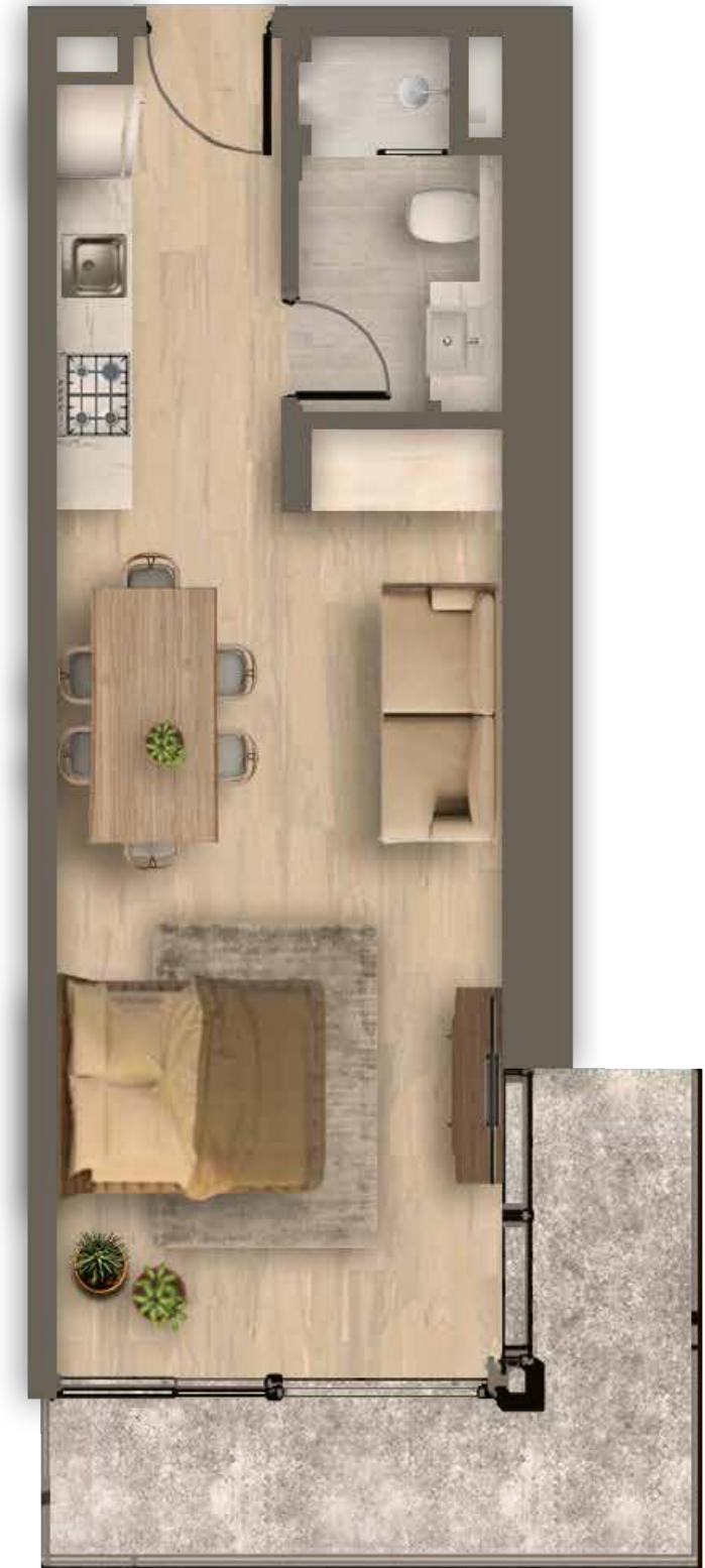
Type SB 455 sq.ft