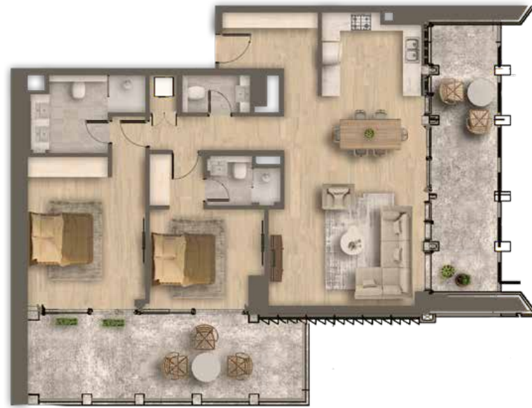
Type D From 1,275 sq.ft to 1,698 sq.ft