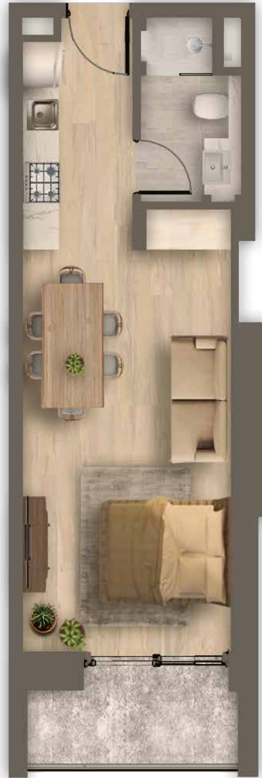
Type B 457 sq.ft