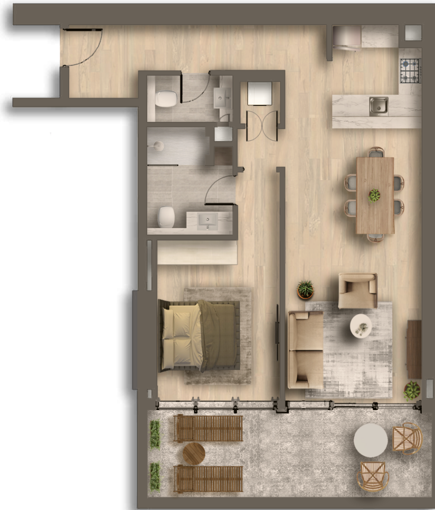
Type B 1,025 sq.ft