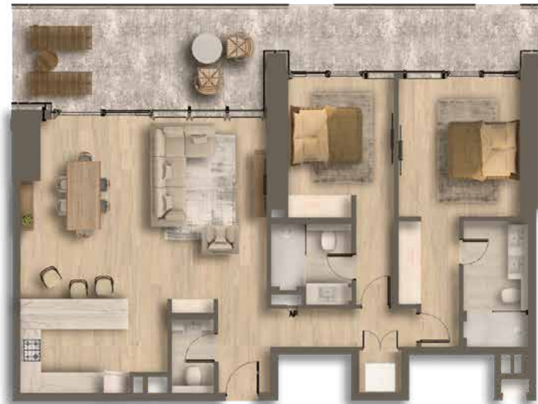
Type C1 From 1,470 sq.ft to 1,617 sq.ft