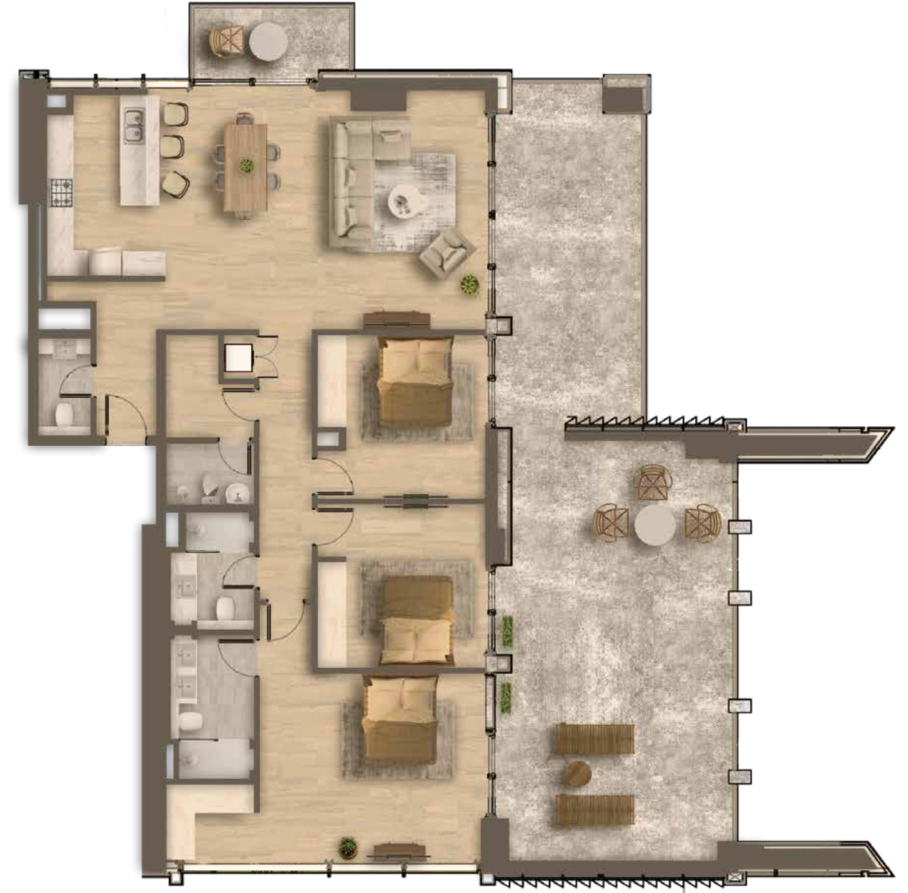
Type C 2,560 sq.ft