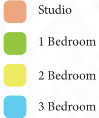
5th to 11th Floor – 50 Units / Floor