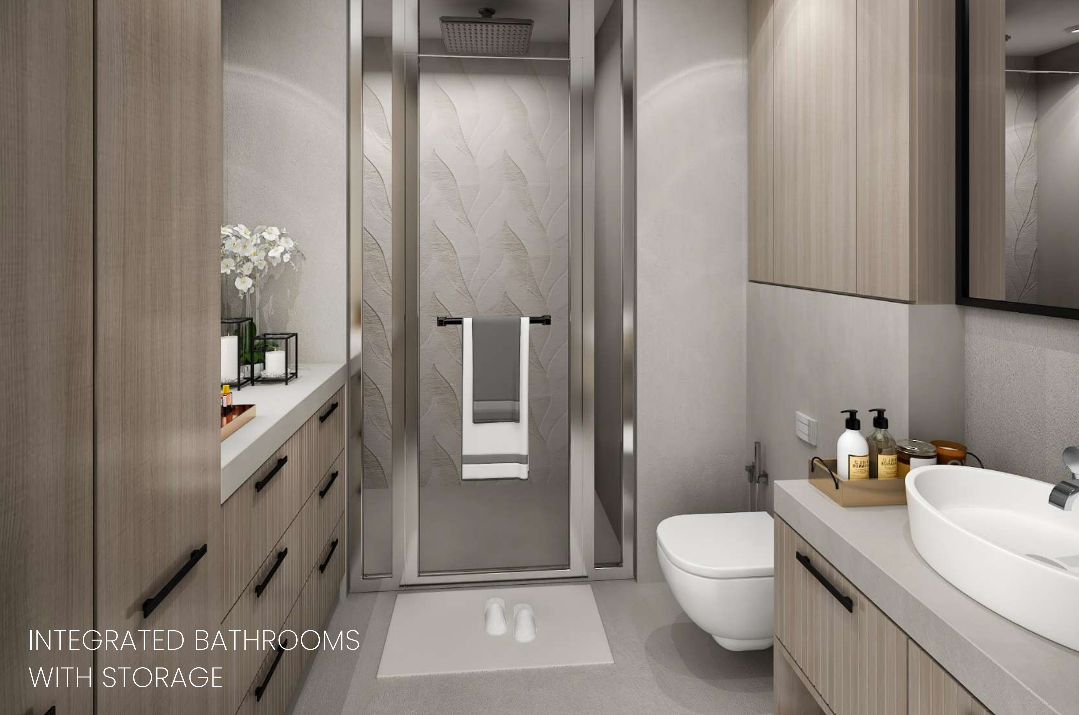
INTEGRATED BATHROOMS WITH STORAGE