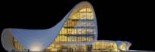
Heydar Aliyev Center, 2012