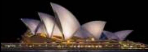
Sydney Opera House, 1973