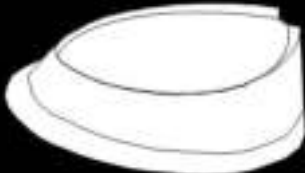
Dubai South Opera House, 2028