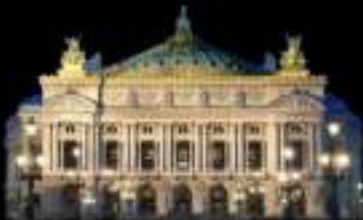
Palais Garnier, 1875