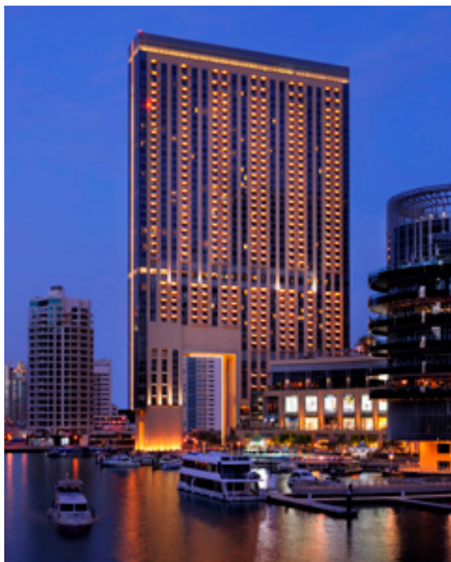
5-star Premium Hotel, The Address Dubai Marina

Famous for its vibrant nightlife, exceptional dining venues and an abundance of activities that will satiate your every desire.