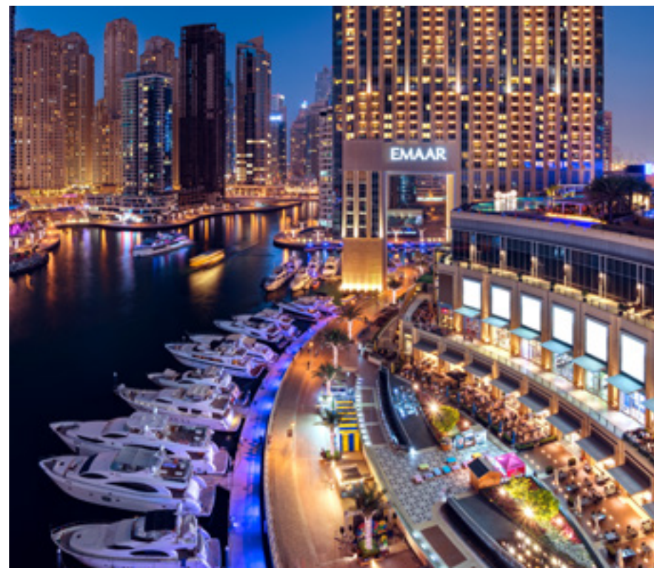
150,000 Sqm Marina Mall