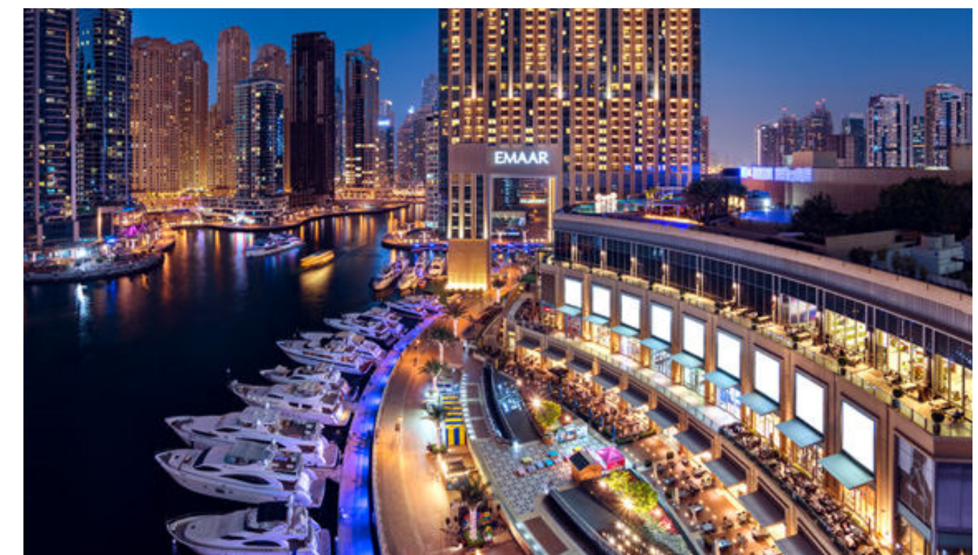
Dubai Marina Mall