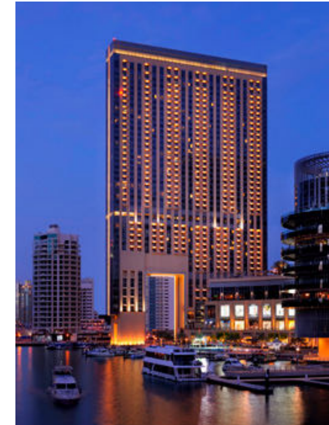
The Address Dubai Marina 5-star Premium Hotel

Famous for its vibrant nightlife, exceptional dining venues and an abundance of activities that will satiate your every desire.