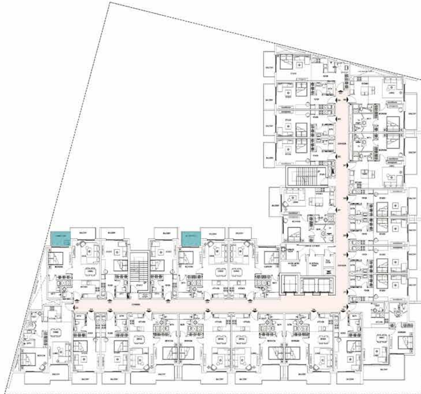
Second and Third Floor