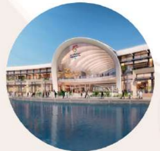
Dubai Festival City Mall