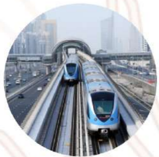
Al Jaddaf Metro Station

The prime location in Al Jaddaf , between Al Khail Road and Sheikh Zayed Road , provides access to major attractions nearby. Schools and hospitals are in close proximity. Various amenities and all types of transport are provided for residents and guests of the community.