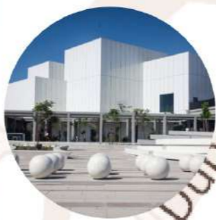
Jamel Art Centre