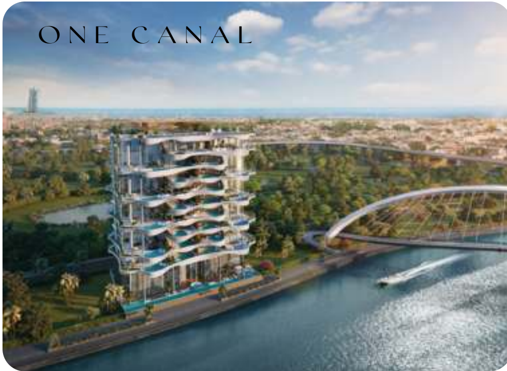
DUBAI WATER CANAL