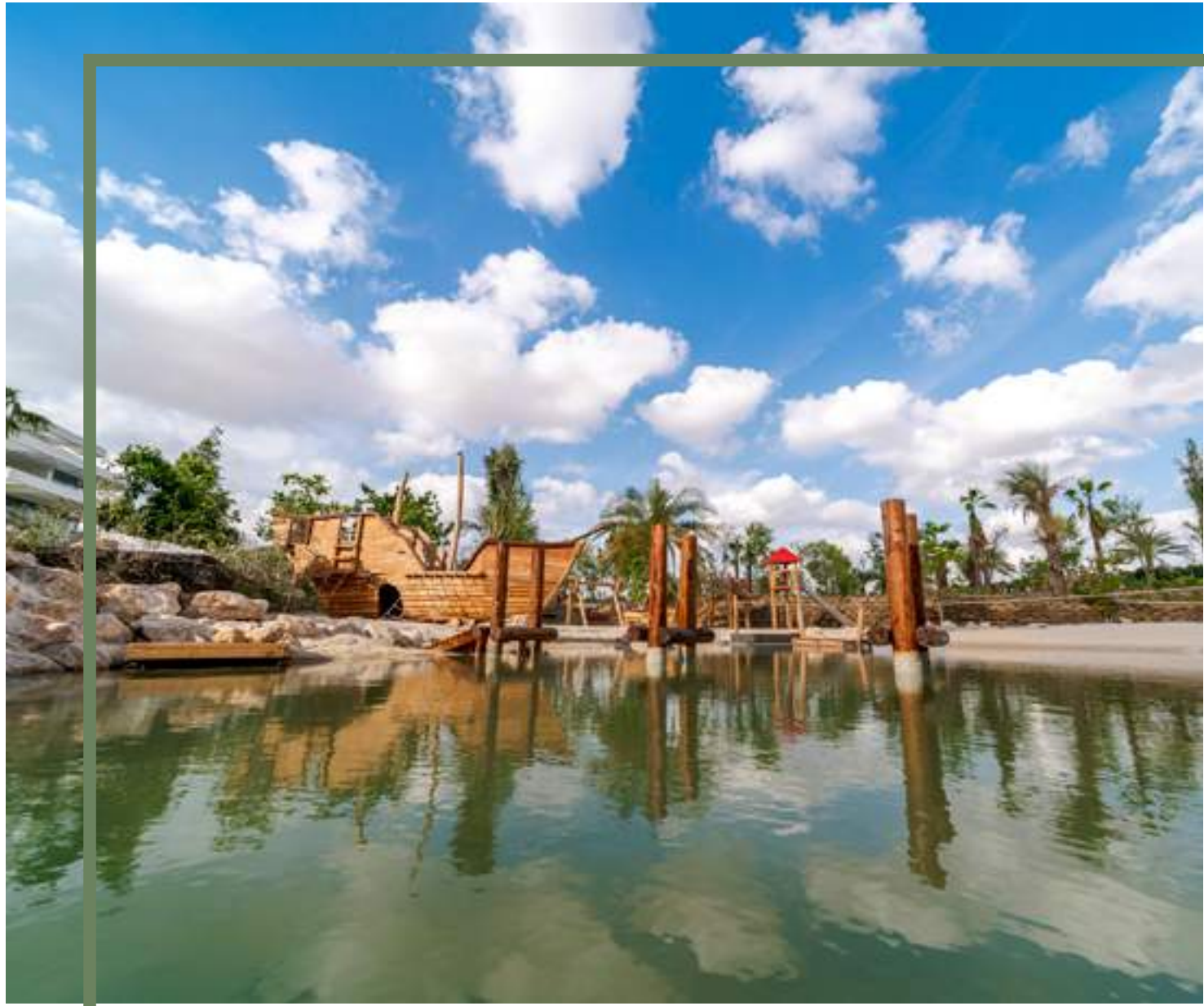
This bespoke pirate ship has been handcrafted from oak with pulley systems on board that allow children to interact and work in teams

Thoughtful design fused with materials sourced with love