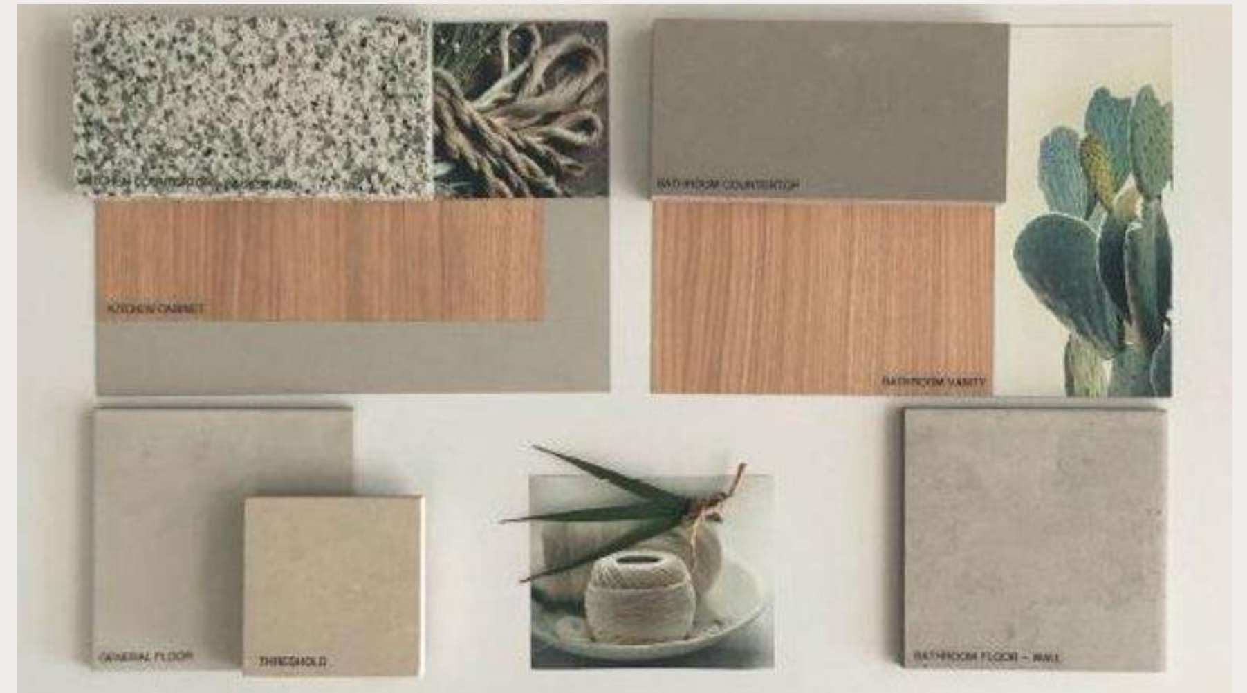
INTERIOR DESIGN SCHEME