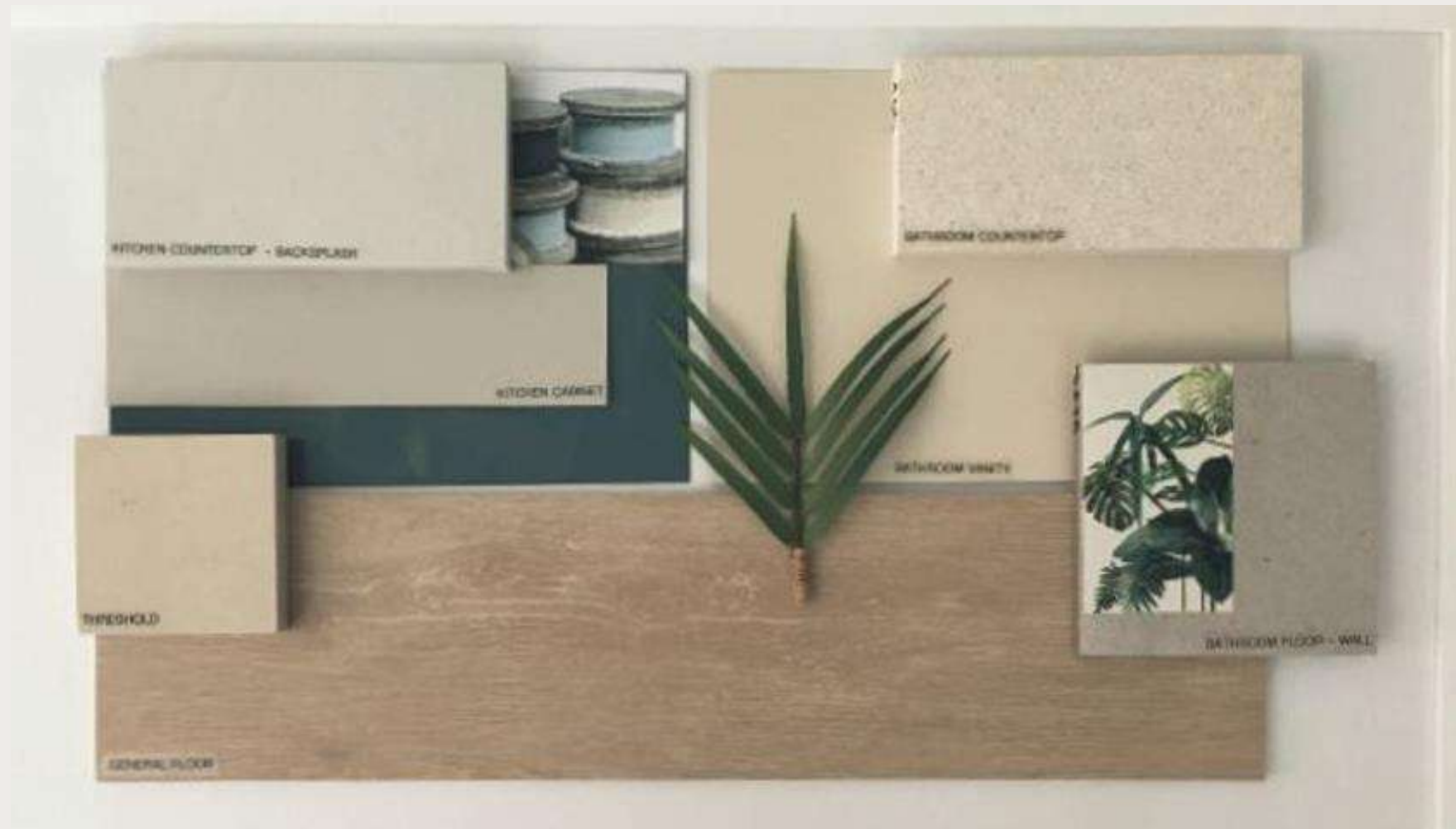
INTERIOR DESIGN SCHEME