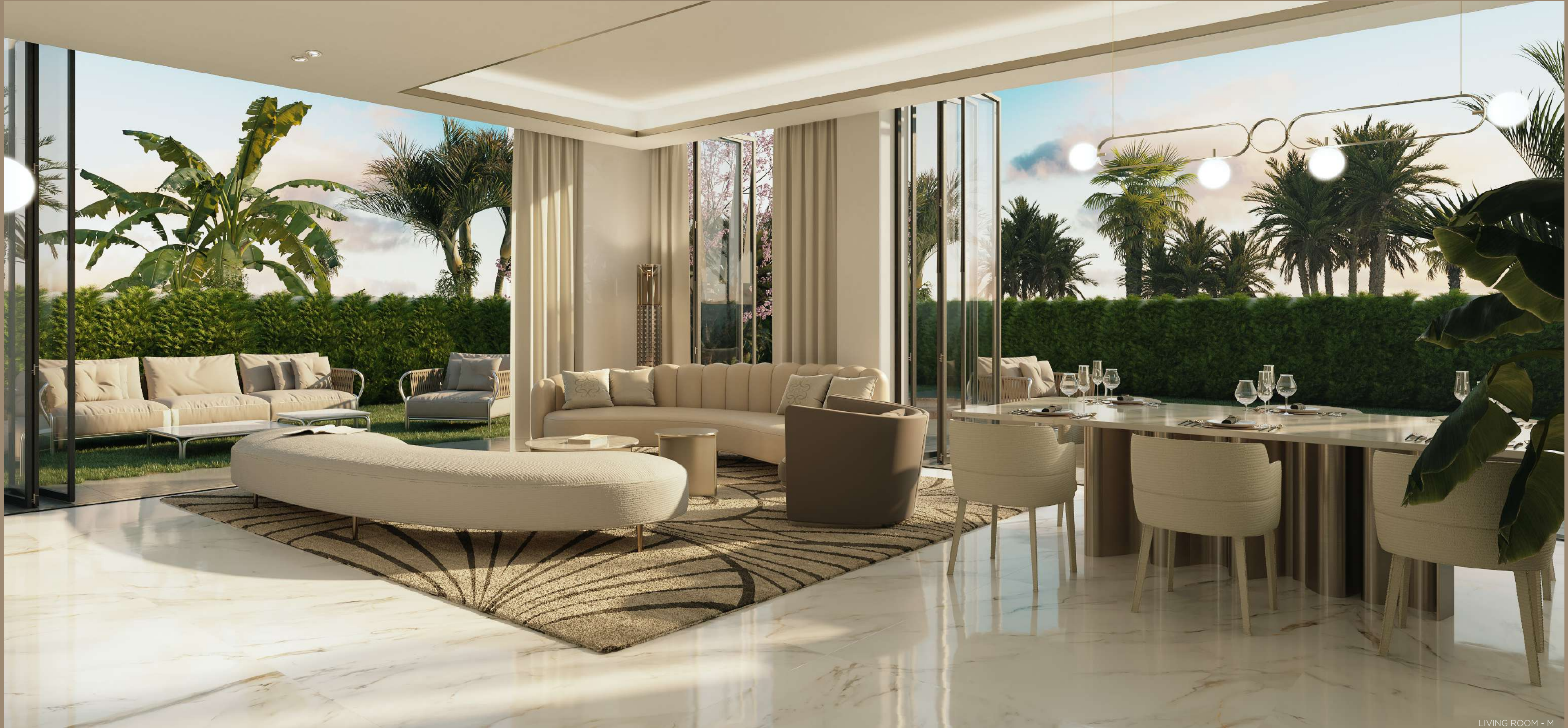
LIVING ROOM - M