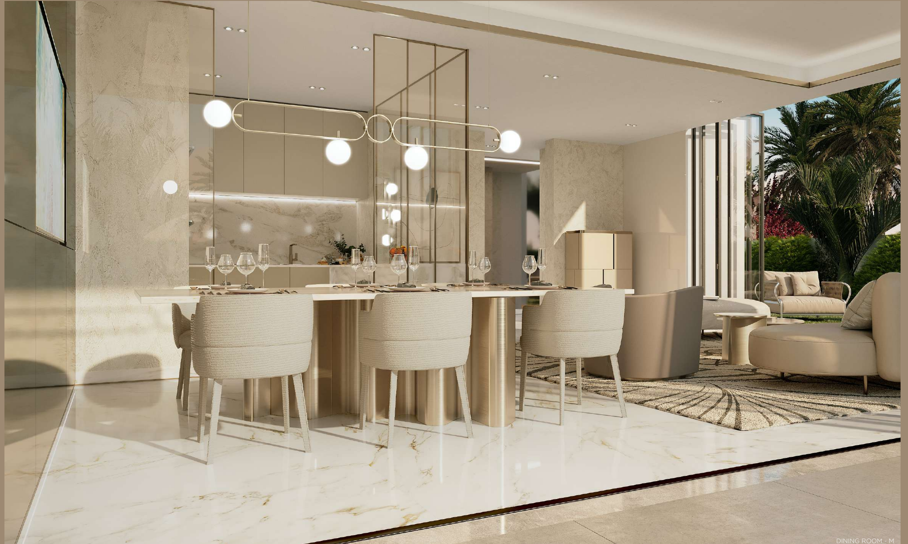
DINING ROOM - M