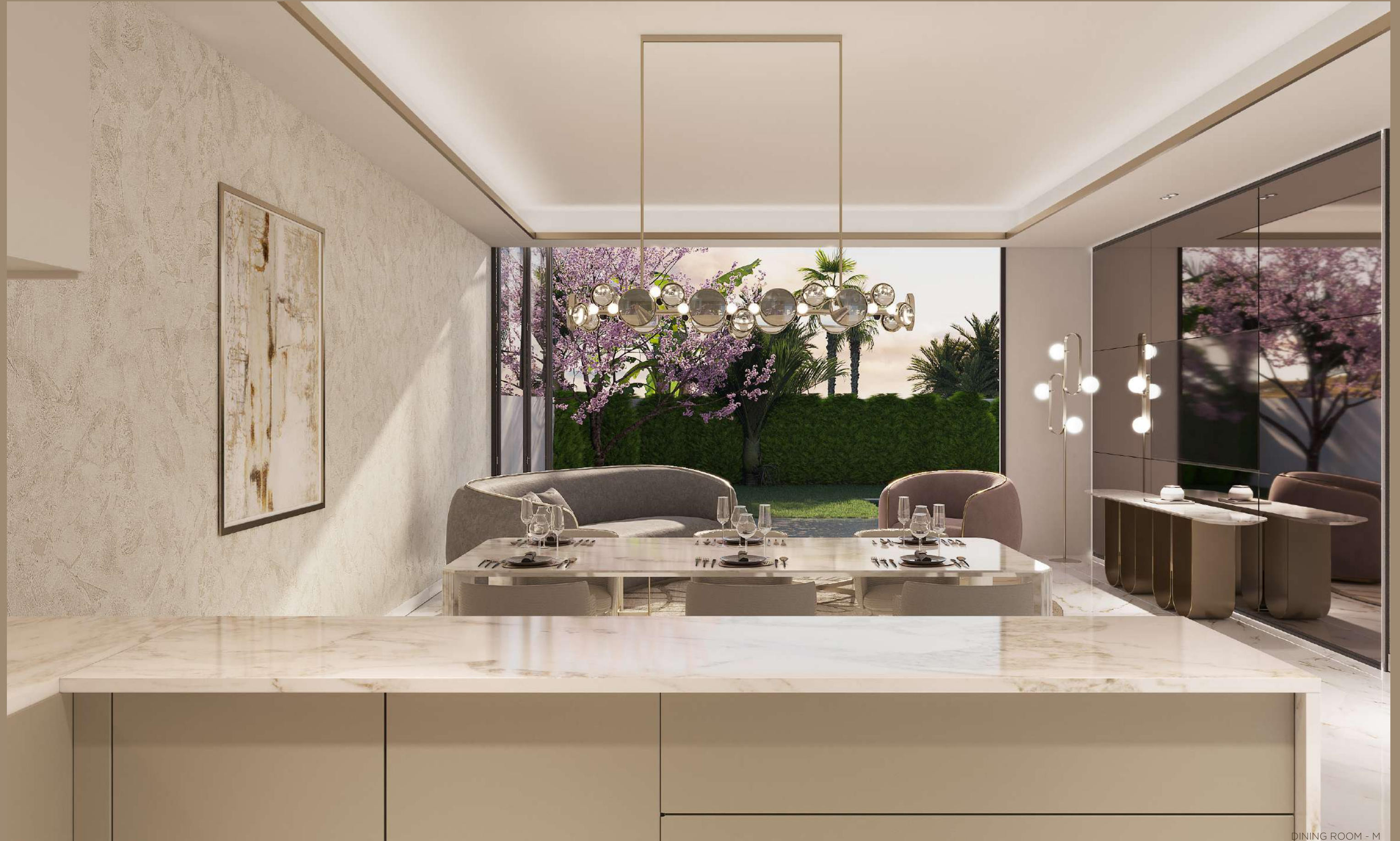
DINING ROOM - M