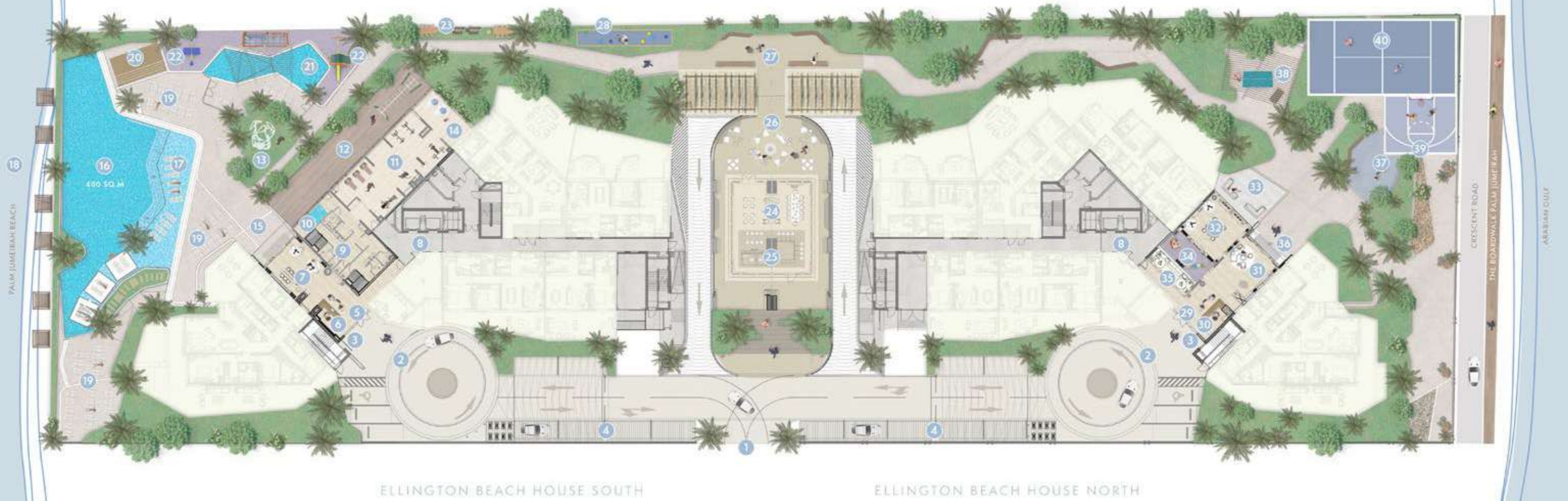
ELLINGTON BEACH HOUSE SOUTH