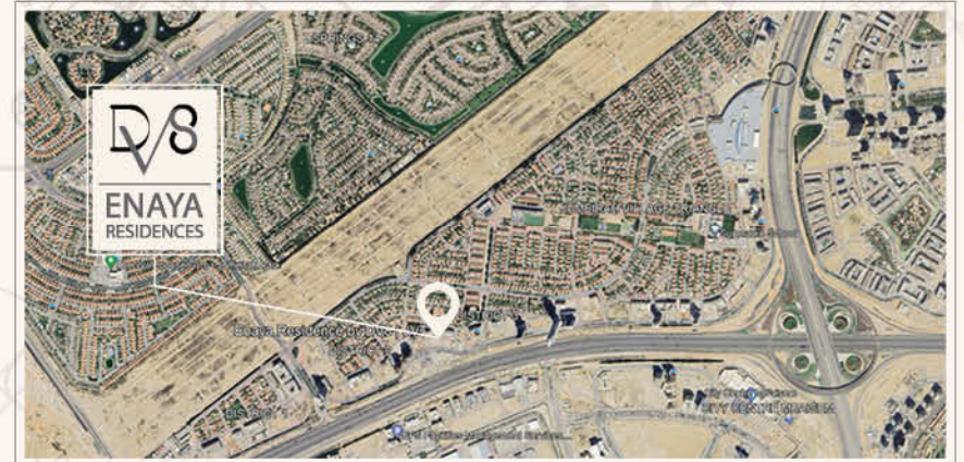
Jumeirah Village Triangle