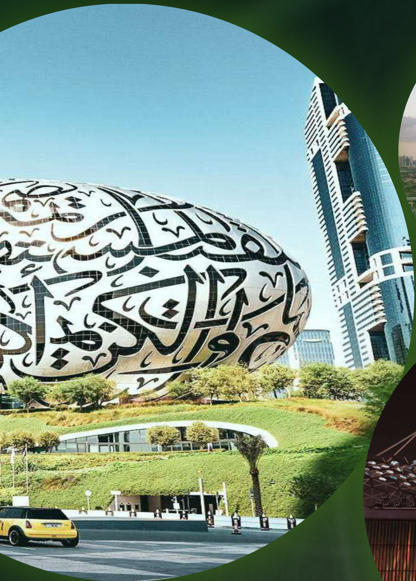
MUSEUM OF THE FUTURE