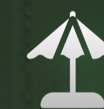
LA MER BEACH