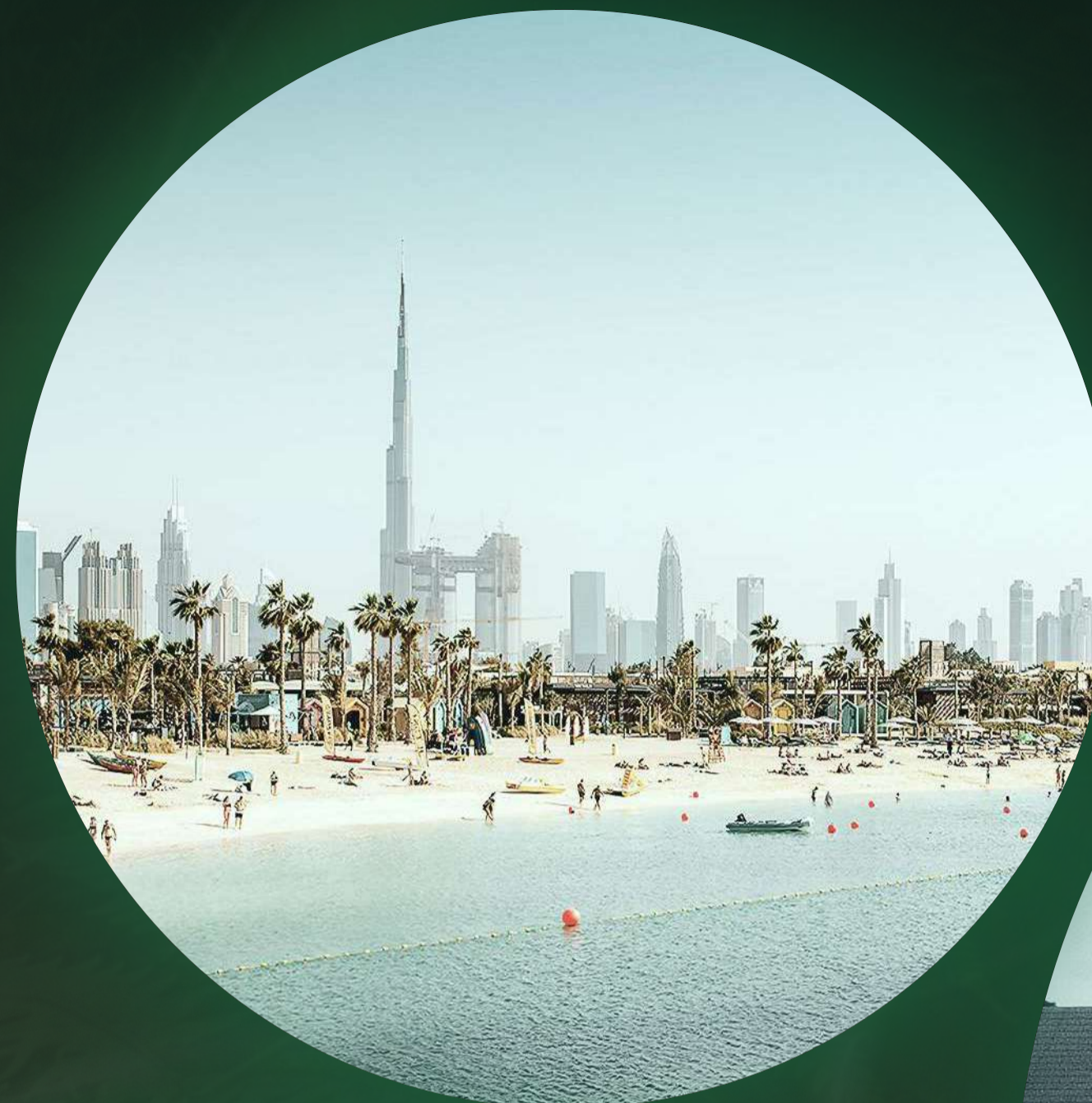
LA MER BEACH