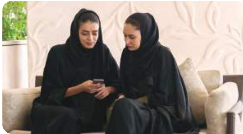
Clubhouse, function rooms, reading rooms