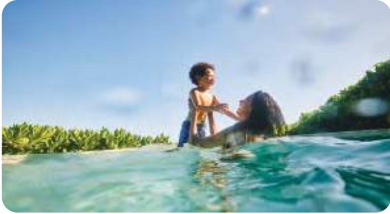
Swimming pools in each cluster including kids' pool, lap pool, pool deck with cabanas, pool bar, spa pool, cascading waterfall