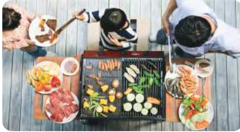
BBQ areas, outdoor dining pavilion