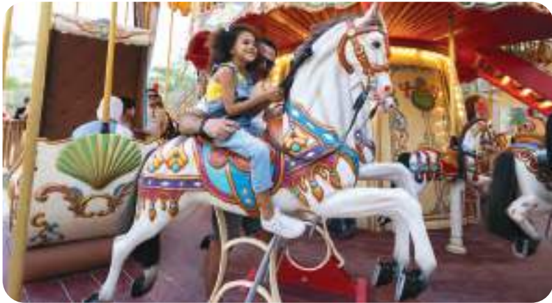
Kids' play area