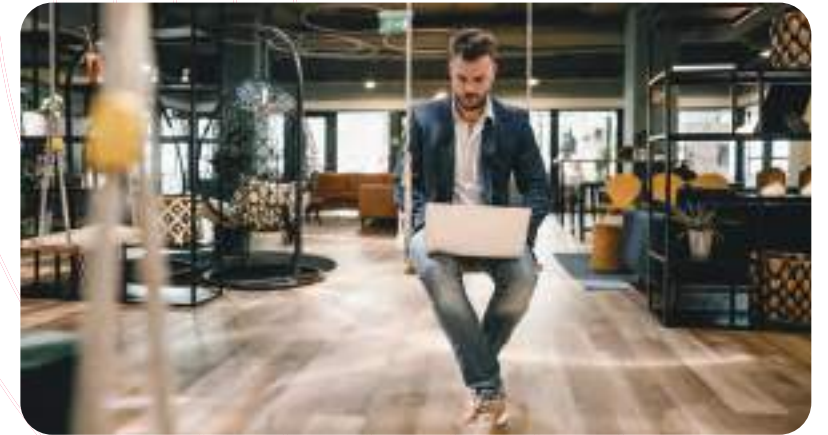
Various lounges for movies, co-working, art, and music