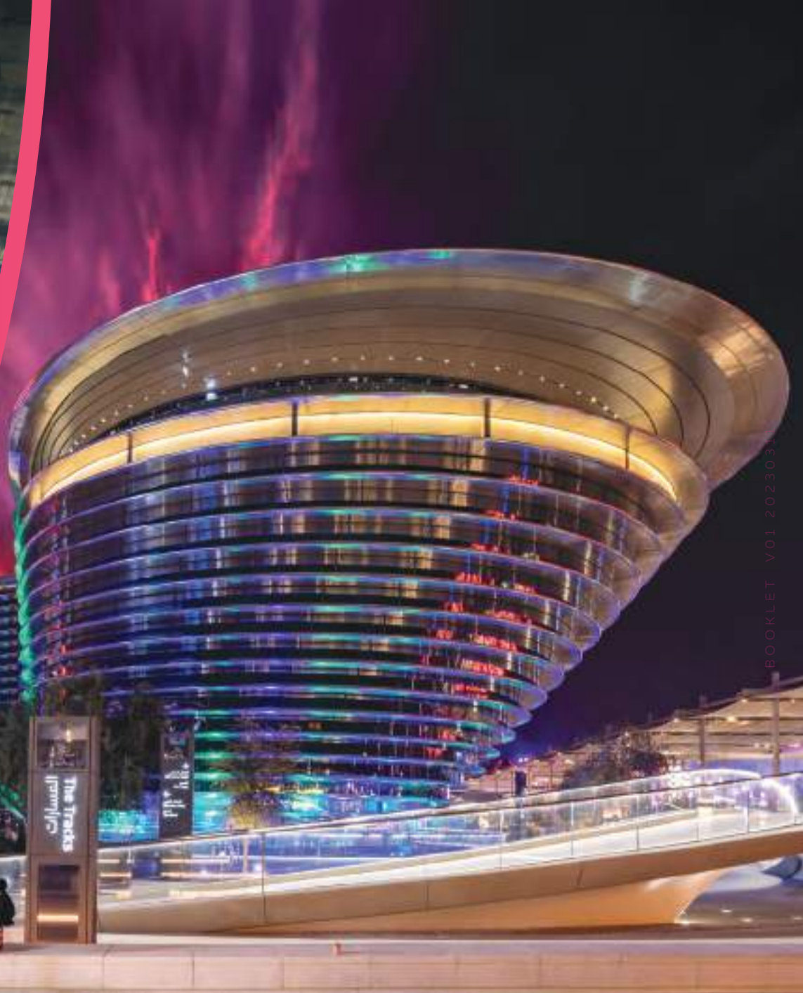
Alif – The Mobility Pavilion Exploring how we move, explore and connect