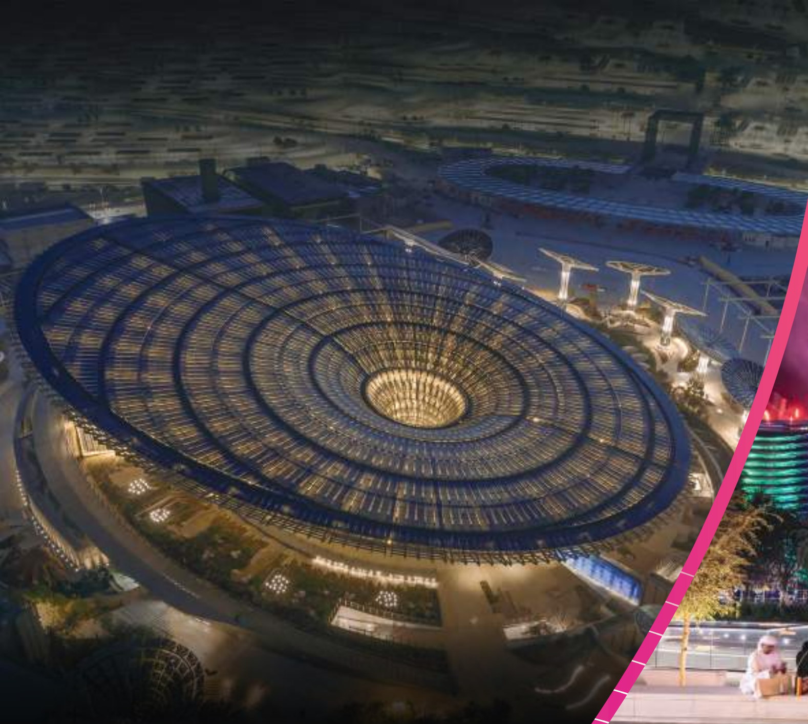
Terra – The Sustainability Pavilion Providing real life solutions to preserve our planet