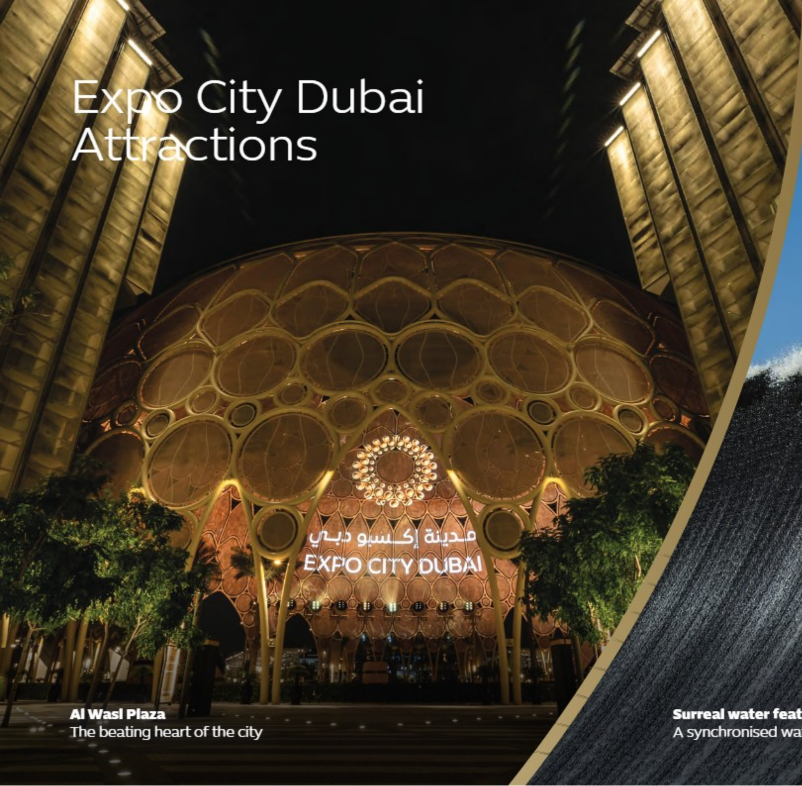
Al Wasl Plaza The beating heart of the city