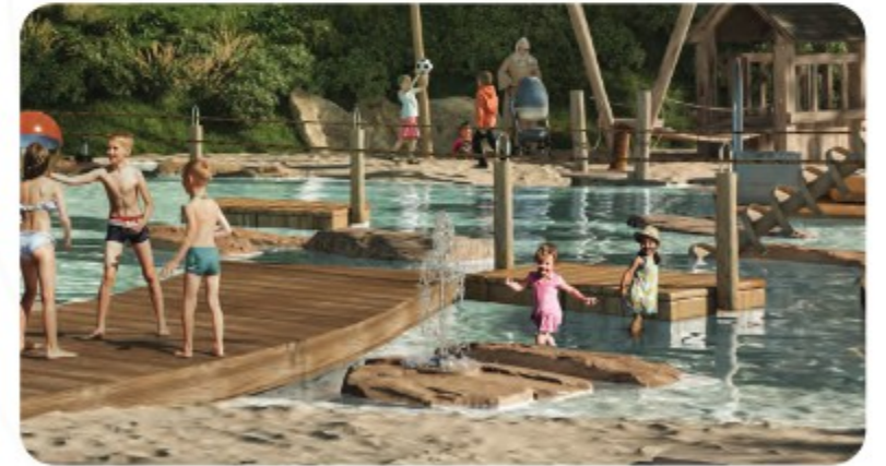
Swimming pools, splash pads and kids' play areas