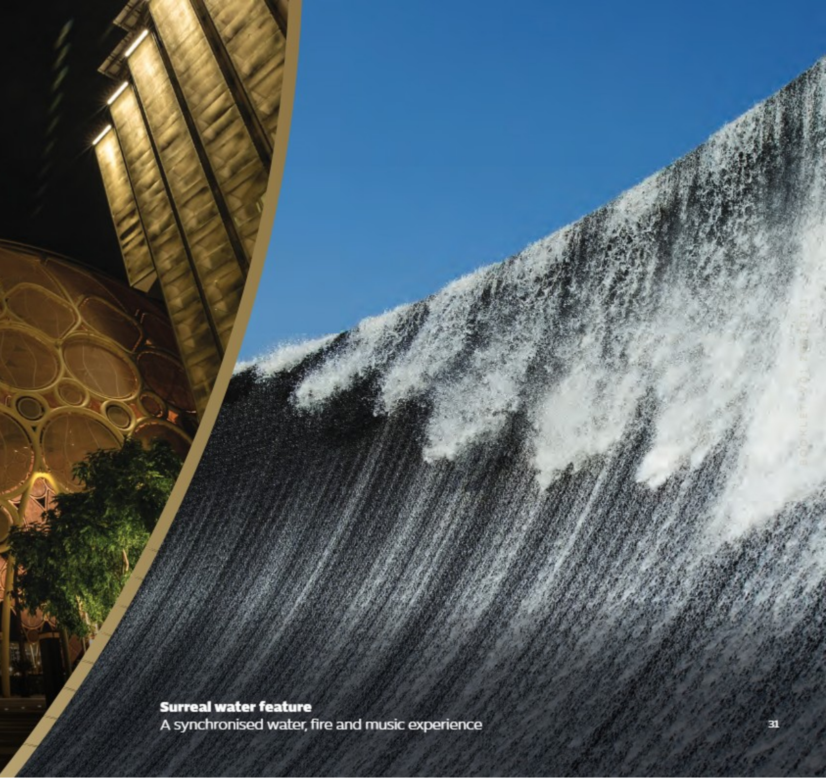
Surreal water feature A synchronised water, fire and music experience