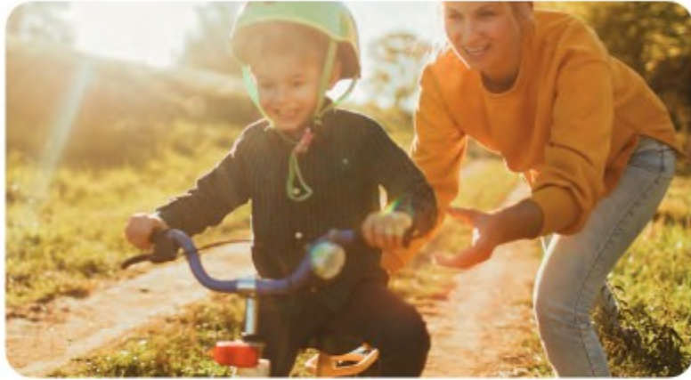
4.5 km of pedestrian tracks and 5.2 km of cycling trails