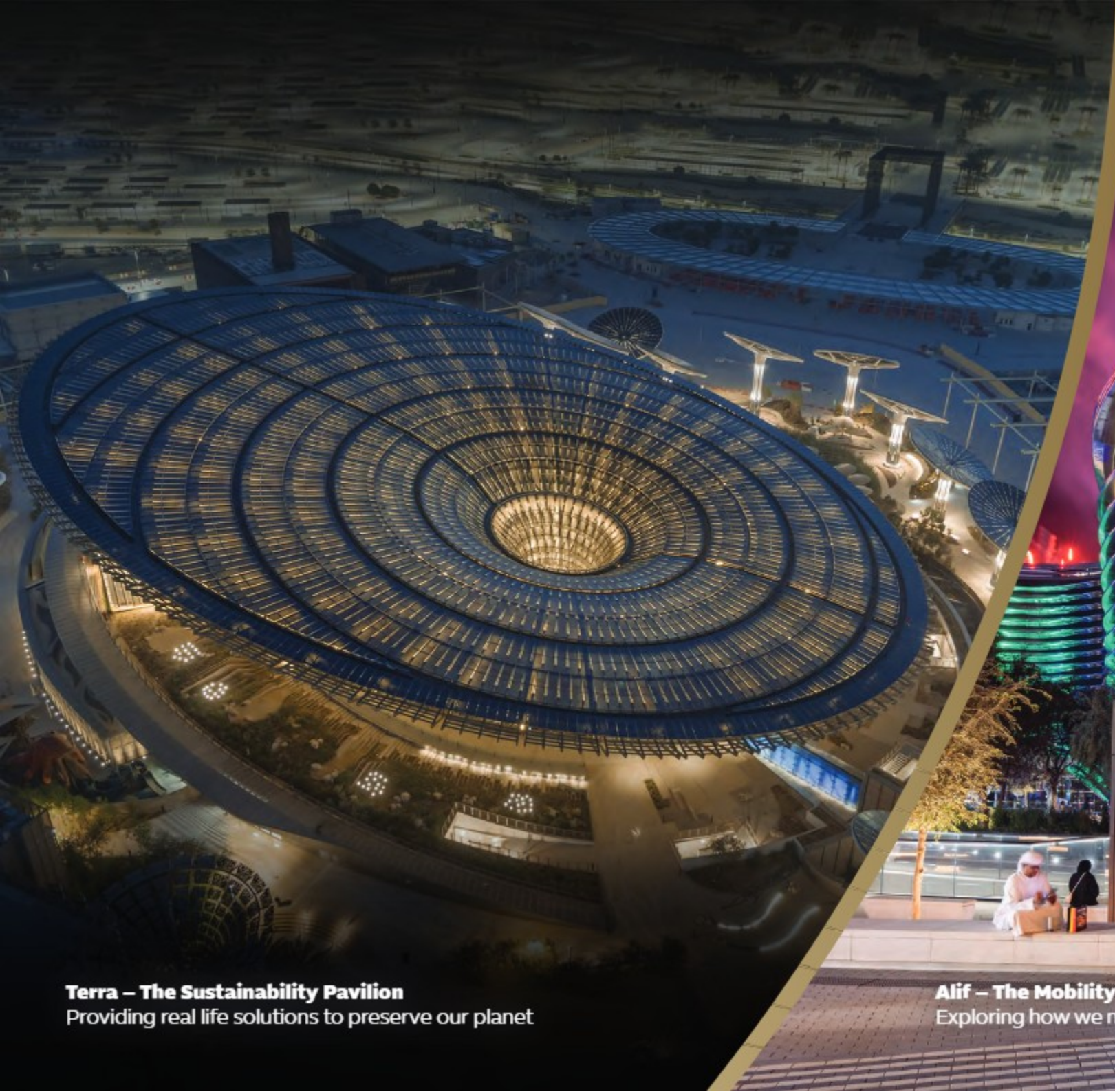
Terra – The Sustainability Pavilion Providing real life solutions to preserve our planet