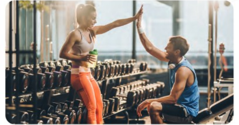
Gyms, outdoor wellness and fitness areas