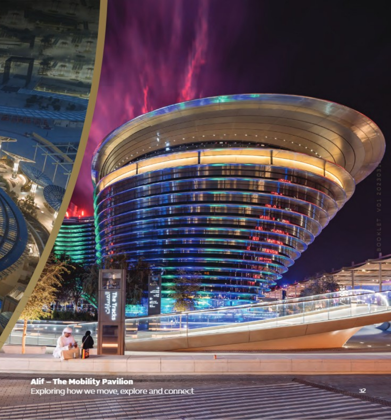
Alif – The Mobility Pavilion Exploring how we move, explore and connect