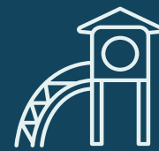
Kids Play Areas