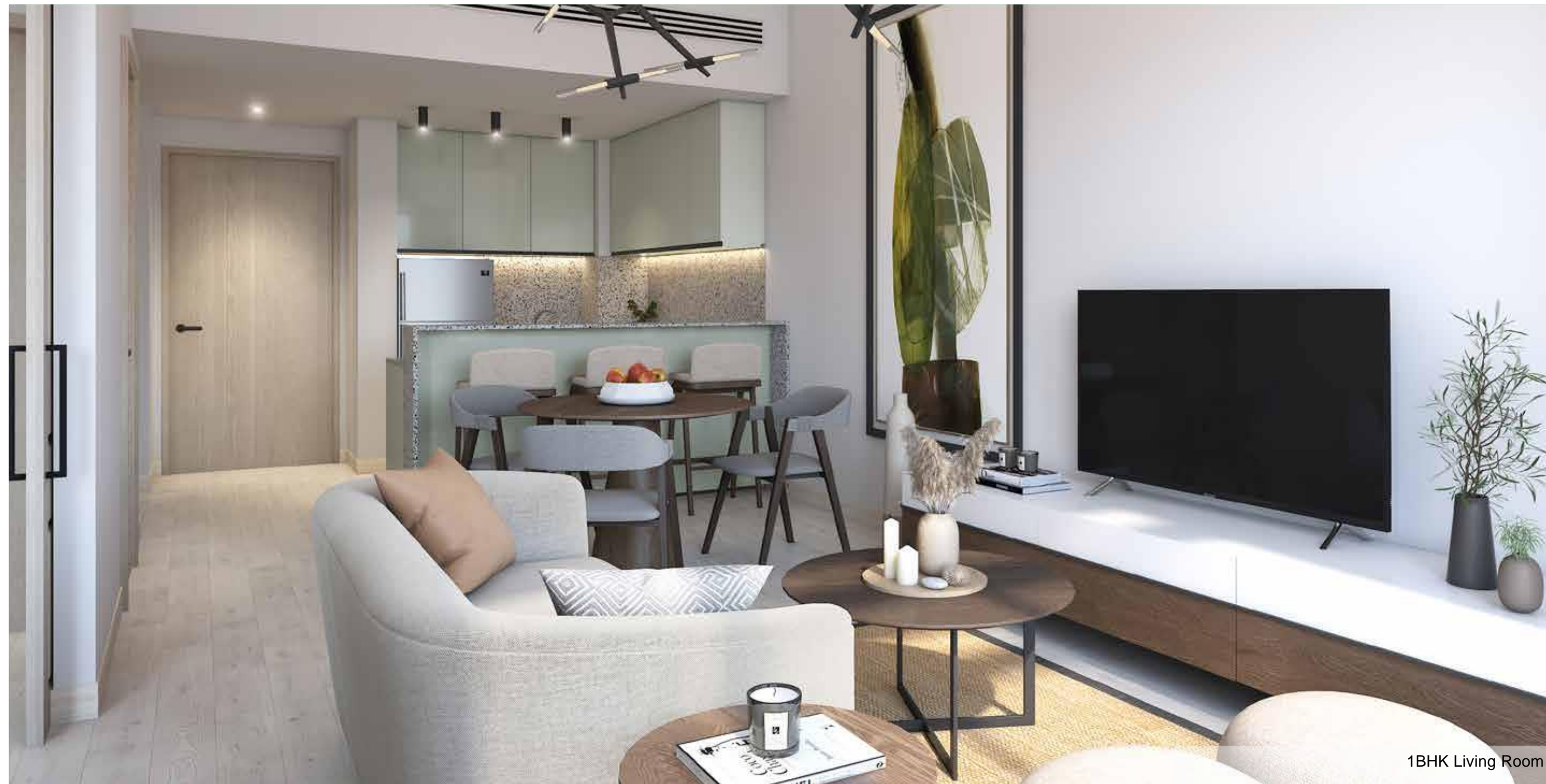
1BHK Living Room