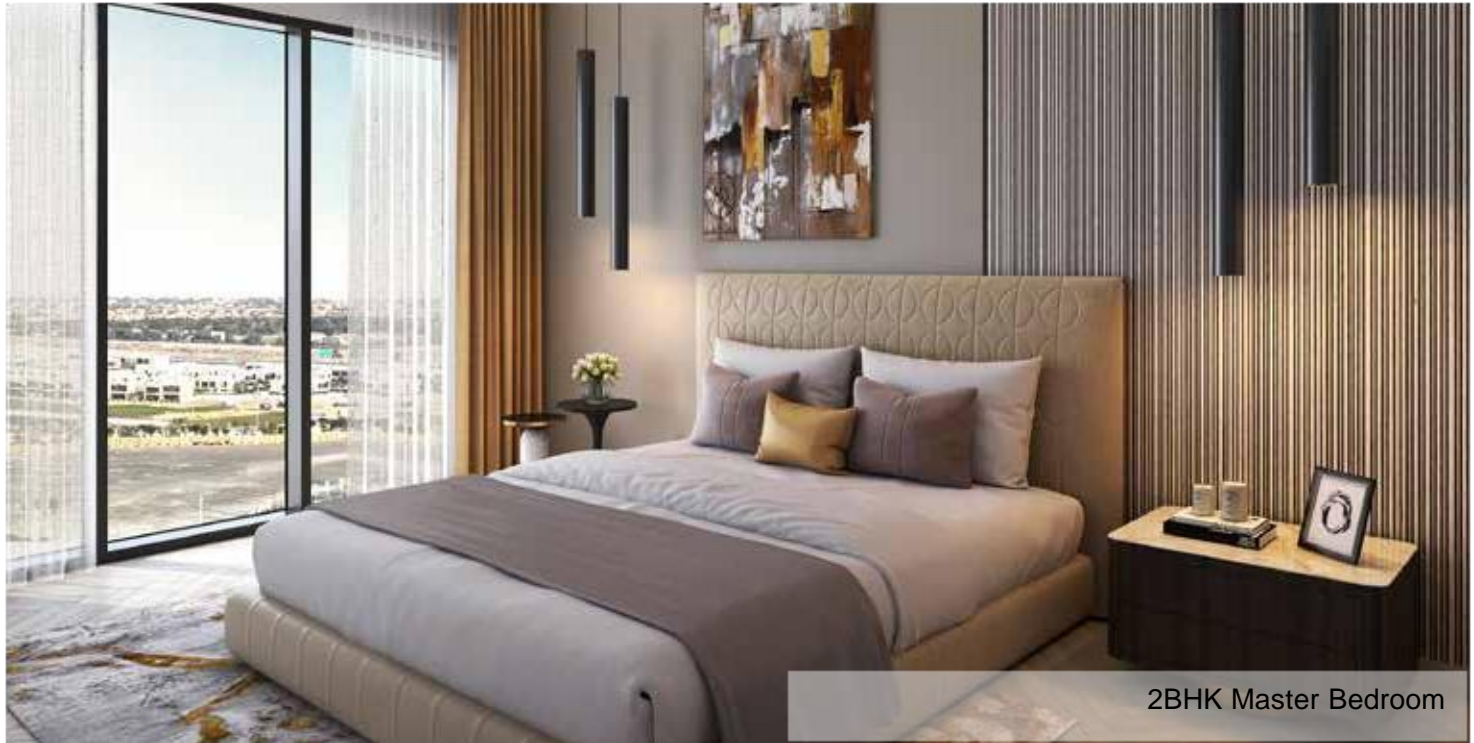
2BHK Master Bedroom