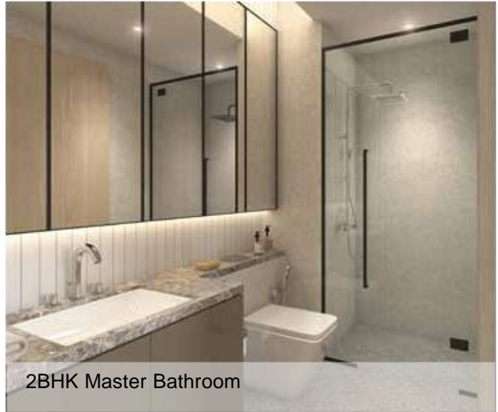
2BHK Master Bathroom