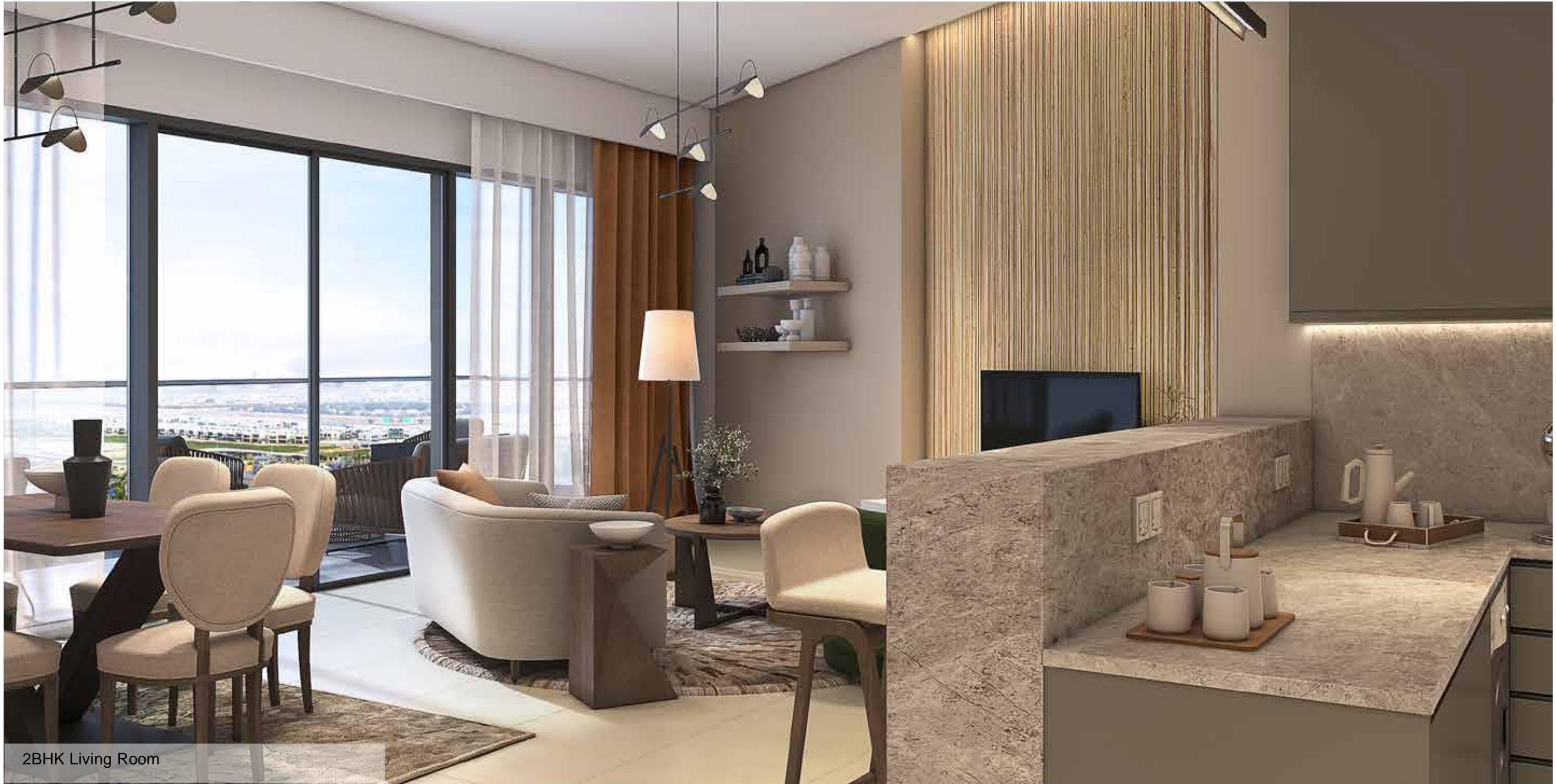
2BHK Living Room