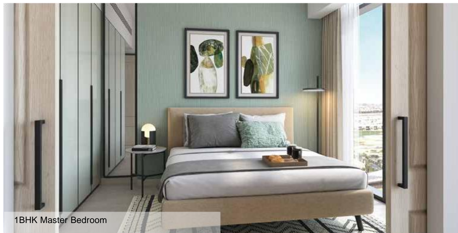
1BHK Master Bedroom