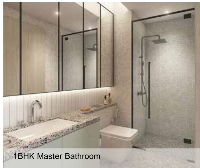
1BHK Master Bathroom