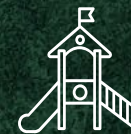
Playground and playscape