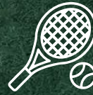
Sports facilities and playgrounds