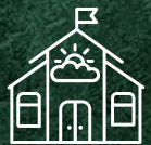
Schools and universities nearby