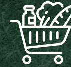
Shop and essential services