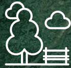
Beautiful central park