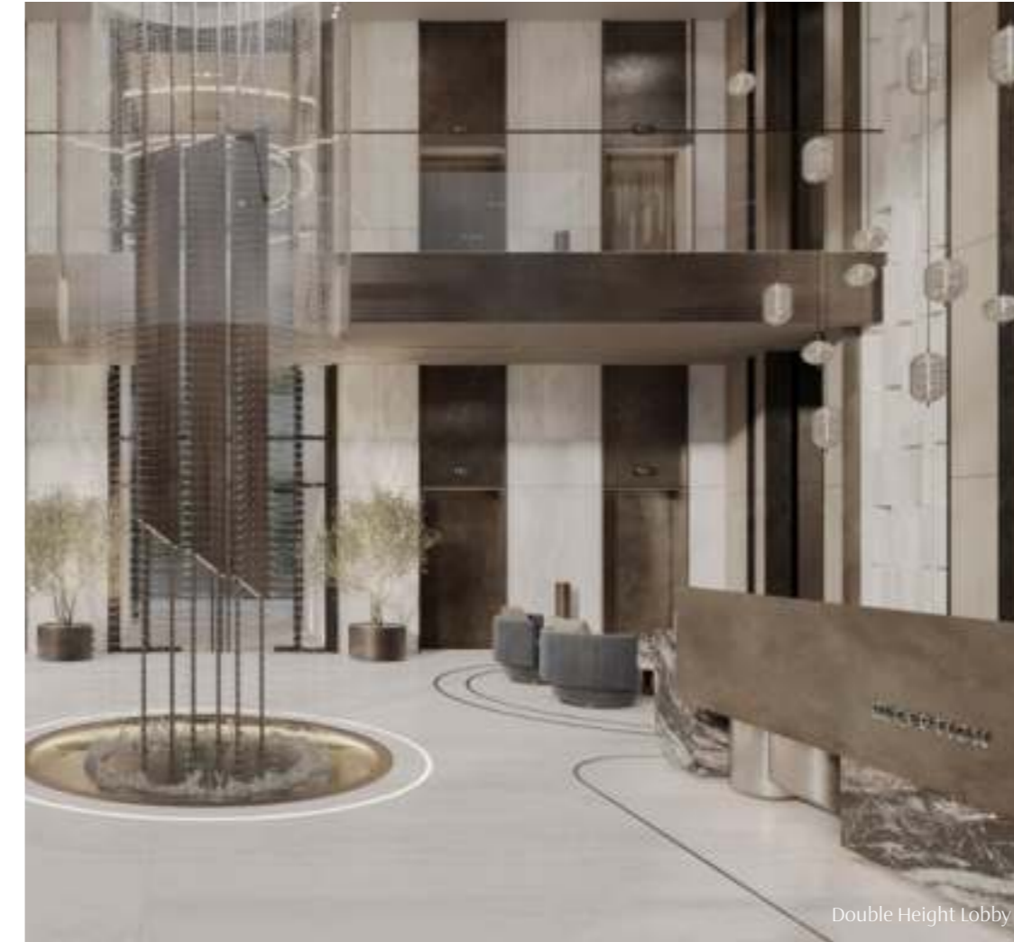
Double Height Lobby

Beyond a home, it's a place where light, space, warmth and togetherness converge to create a new urban vision – it's a testament to why Hammock Park was created and why we invite you in.