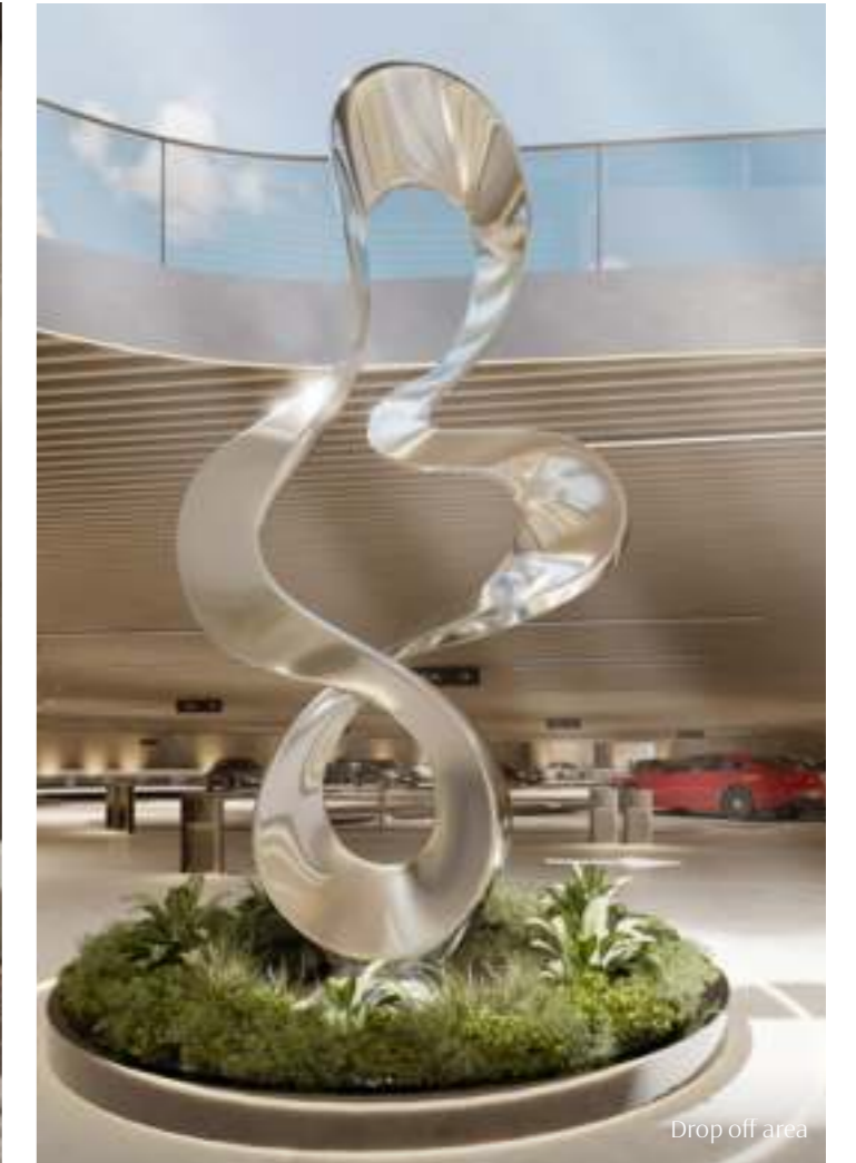
Drop off area