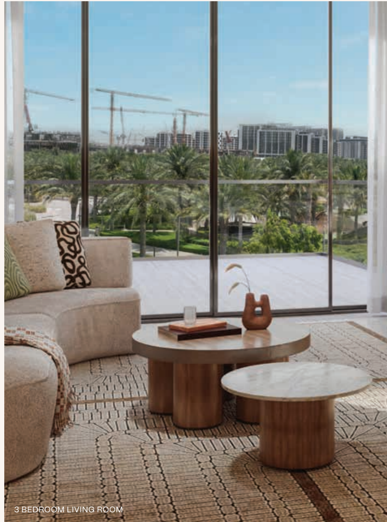
3 BEDROOM LIVING ROOM