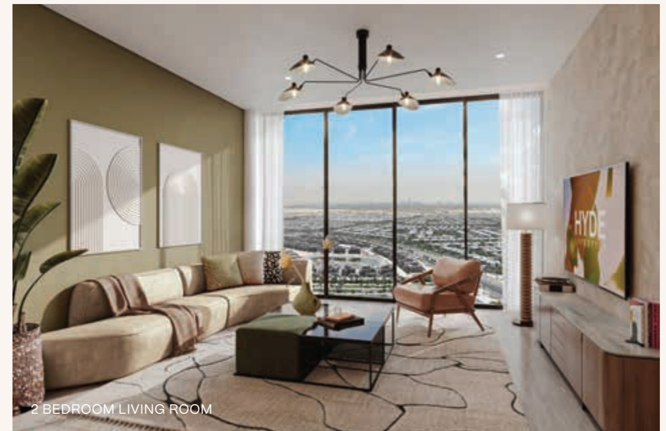
2 BEDROOM LIVING ROOM