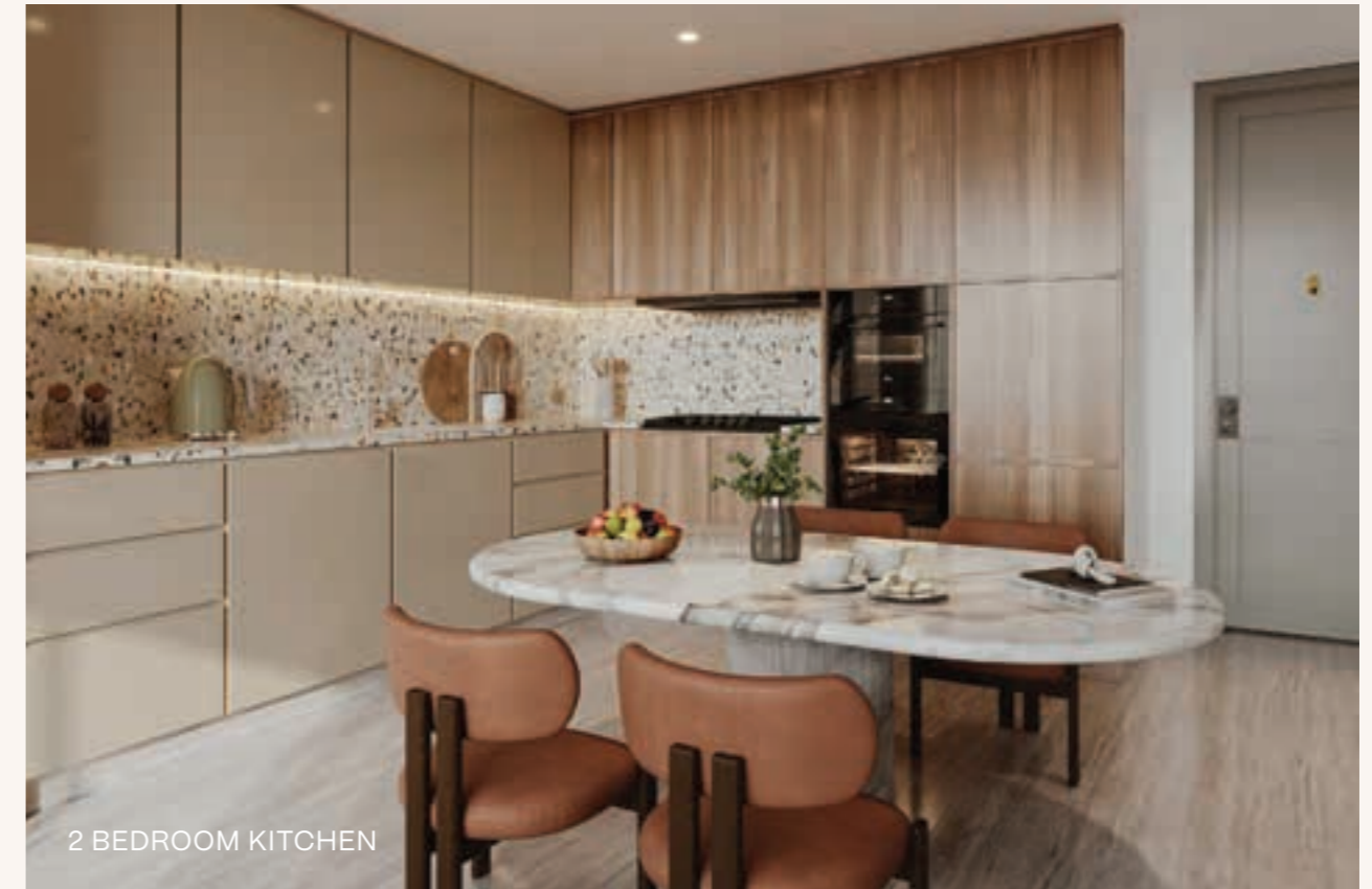
2 BEDROOM KITCHEN