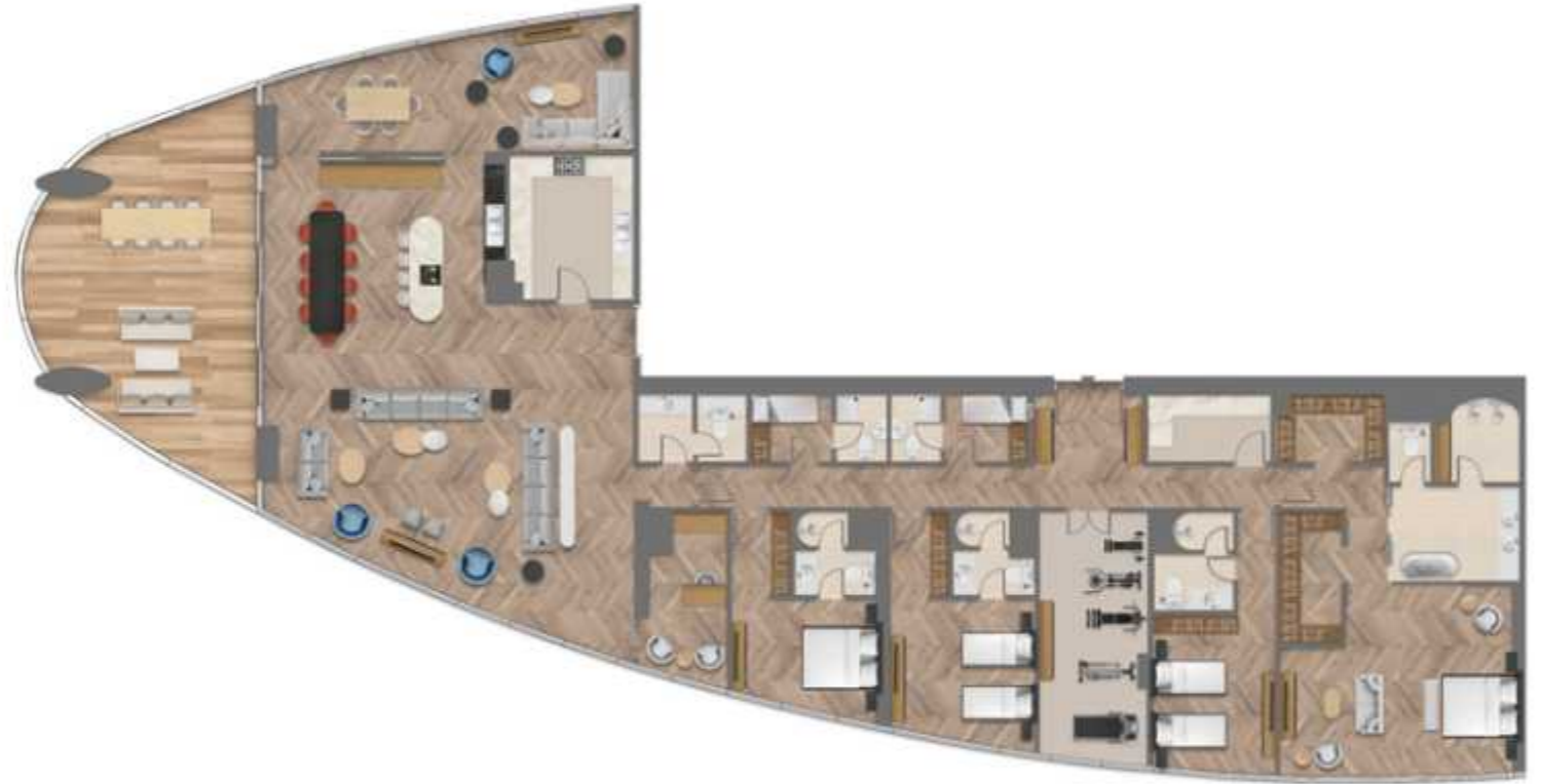
4 BEDROOM APARTMENT, SIMPLEX