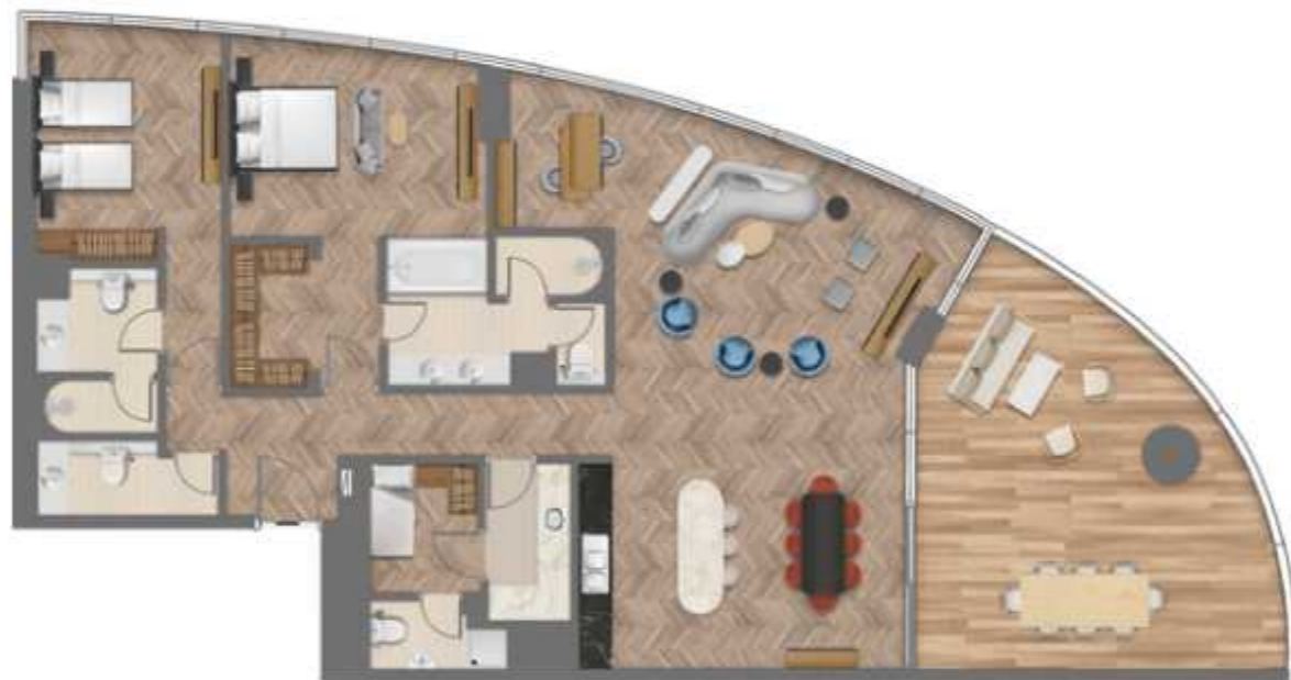
2 BEDROOM APARTMENT, TYPE A