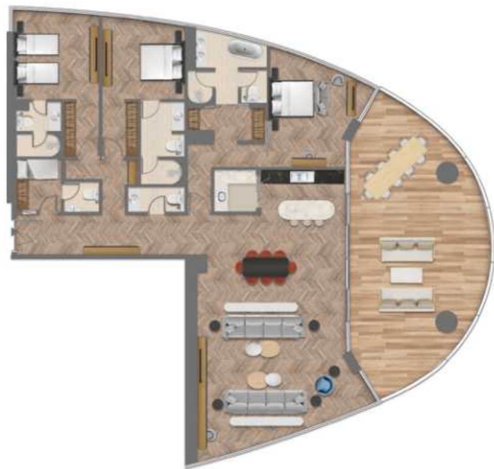
3 BEDROOM APARTMENT, TYPE B