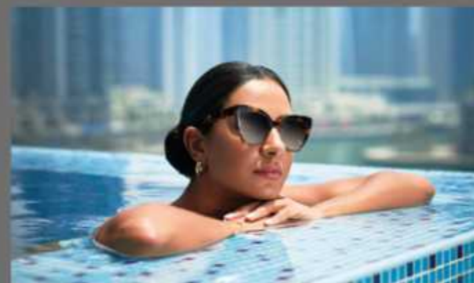
Lifestyle & Experiences