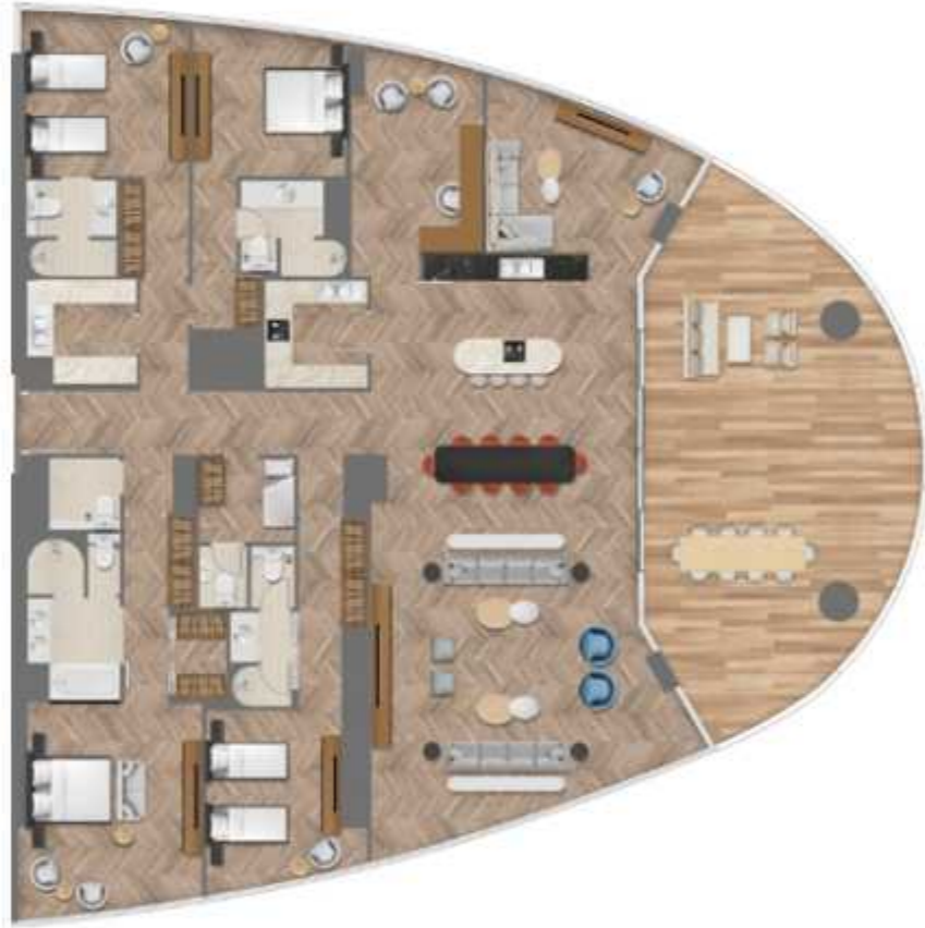
4 BEDROOM APARTMENT, TYPE A