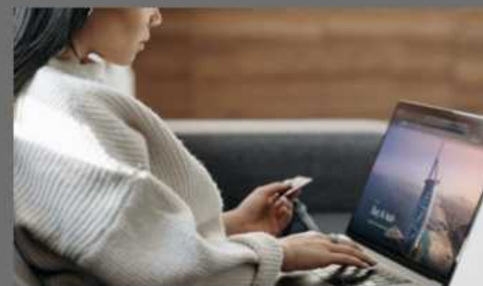
Pay with Points