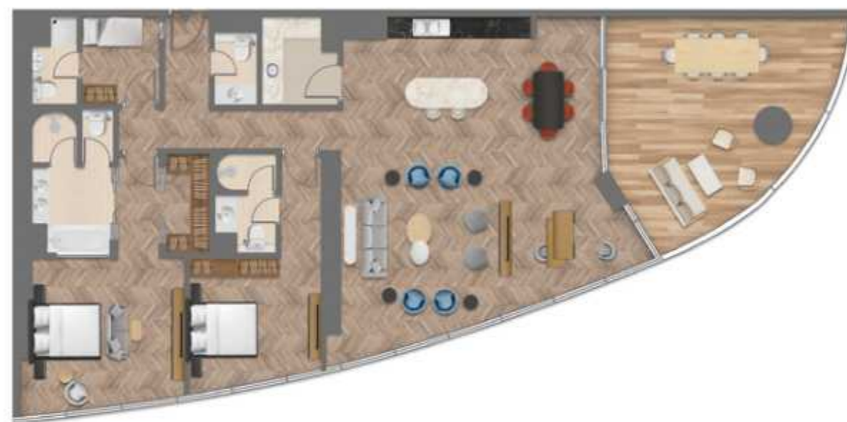
2 BEDROOM APARTMENT, TYPE B