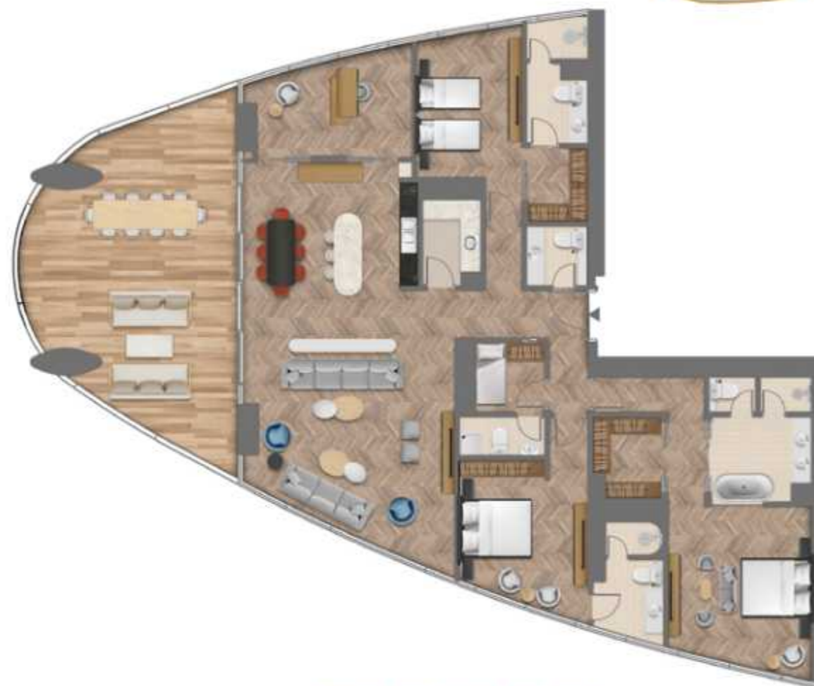
3 BEDROOM APARTMENT, TYPE A