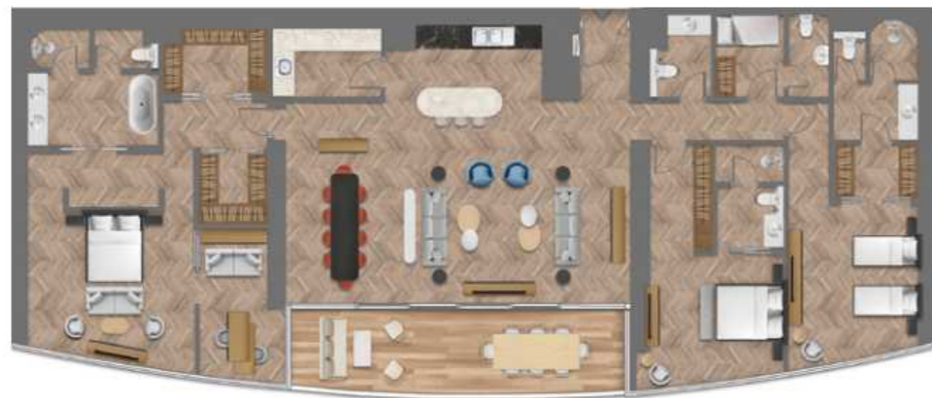
3 BEDROOM APARTMENT, TYPE C