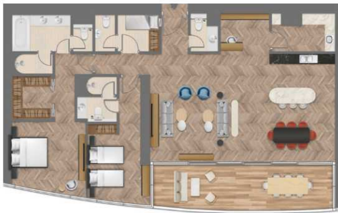
2 BEDROOM APARTMENT, TYPE C