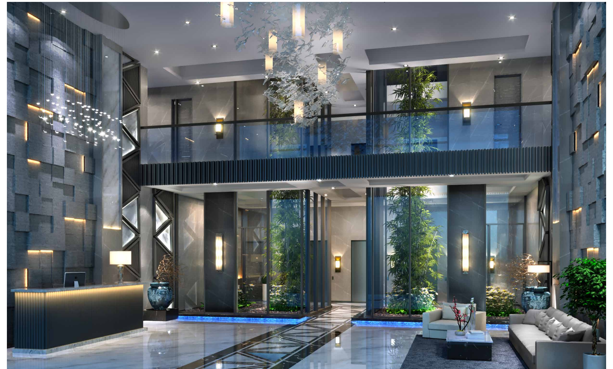
DOUBLE HEIGHT SPACIOUS LOBBY

The colossal lobby has been designed with aesthetic acumen to inspire awe in the viewer. To add the crowning touch to the magnificence are the vertical gardens emphasising the grandiosity and fresh awe a million times over.