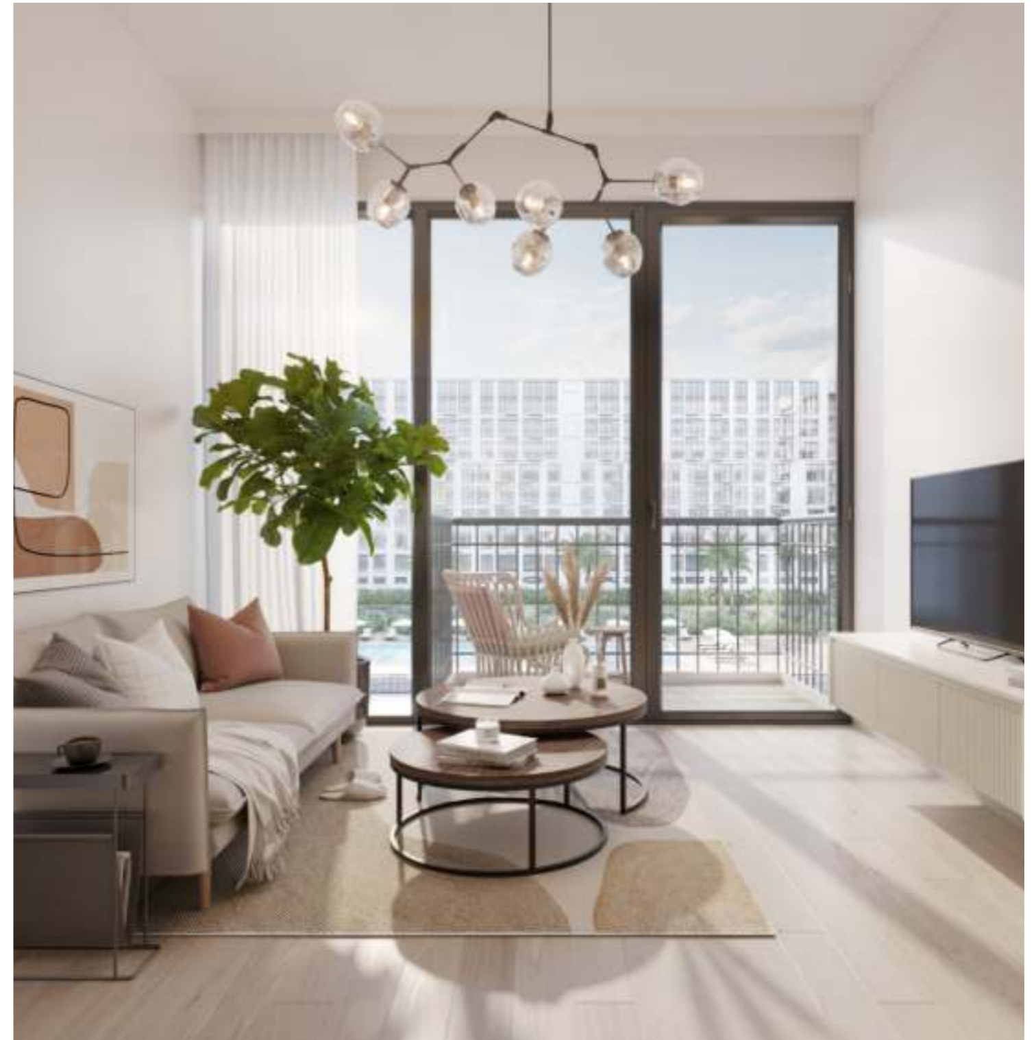
STUDIO LIVING ROOM