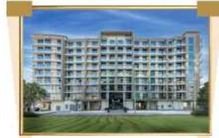
Marquis 2020, Arjan

Our properties are a reflection of Dubai's vibrance and glamour, built to stand the test of time as the legacy of luxury living.