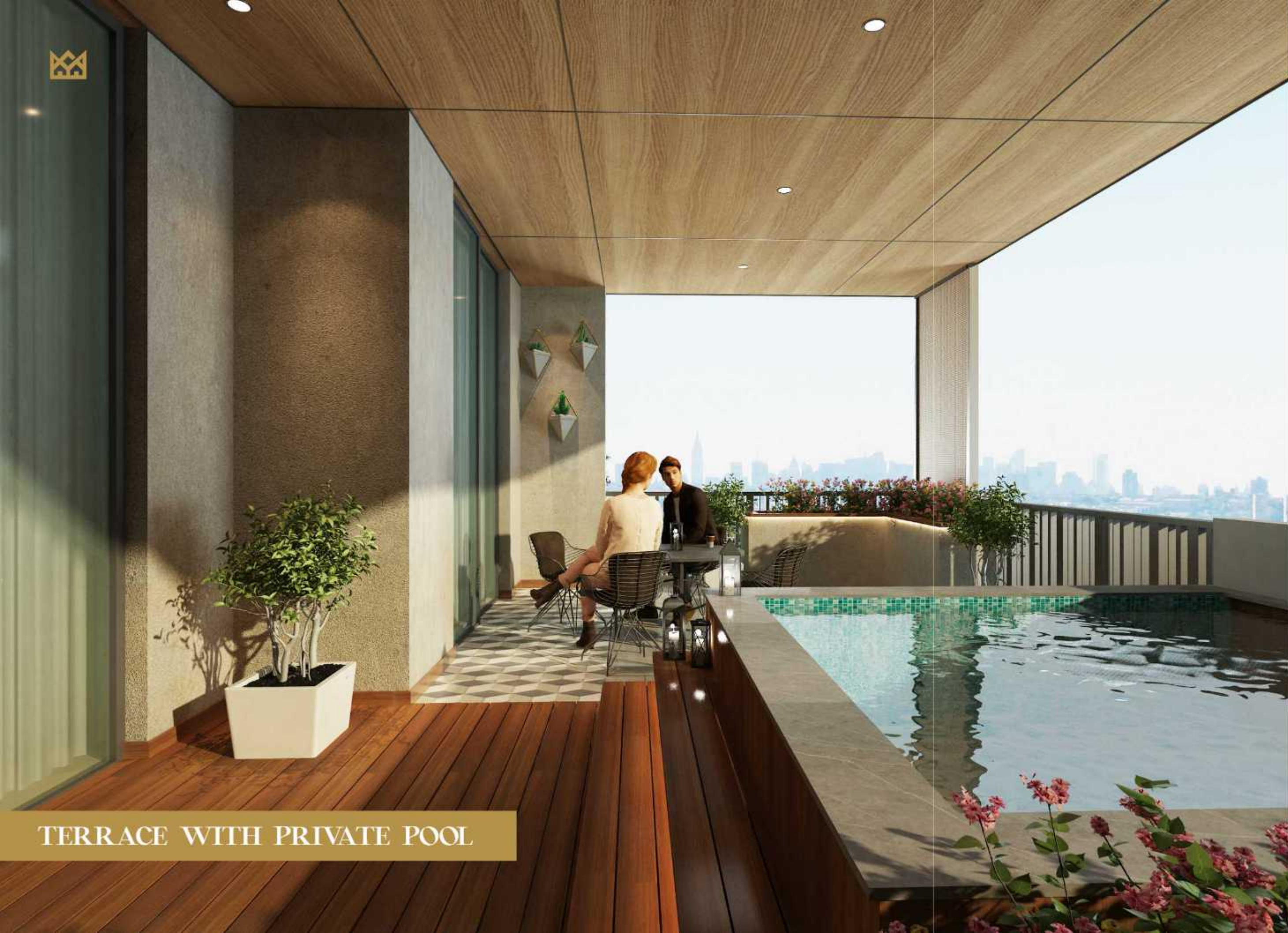
TERRACE WITH PRIVATE POOL