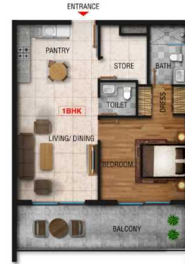
TYPE 1 PREMIUM

Disclaimer: all pictures, plans, layouts, information, data and details included in this brochure are indicative only and may change at any time up to the final 'as built' status in accordance with the final design of the project, regulatory approvals and planning permissions.