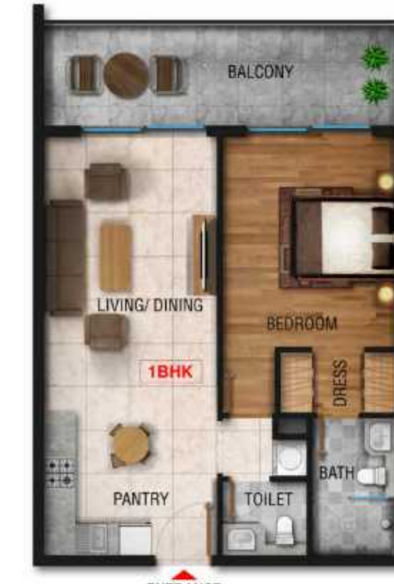
TYPE 2 EXECUTIVE