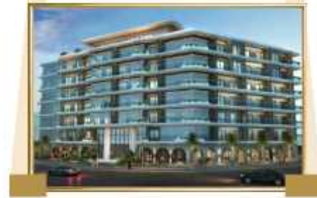
Marquis Signature, Arjan