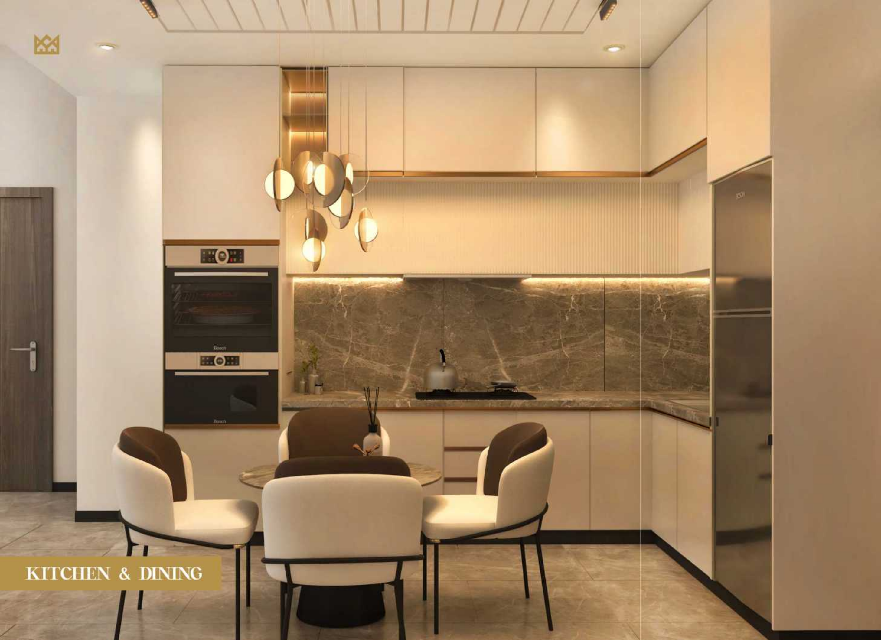
KITCHEN & DINING