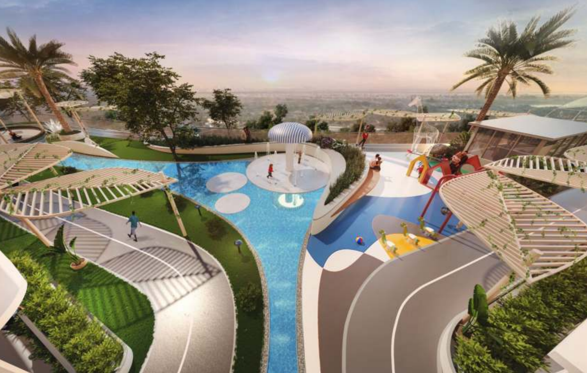
HUES OF BLUES