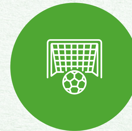
Mini football court