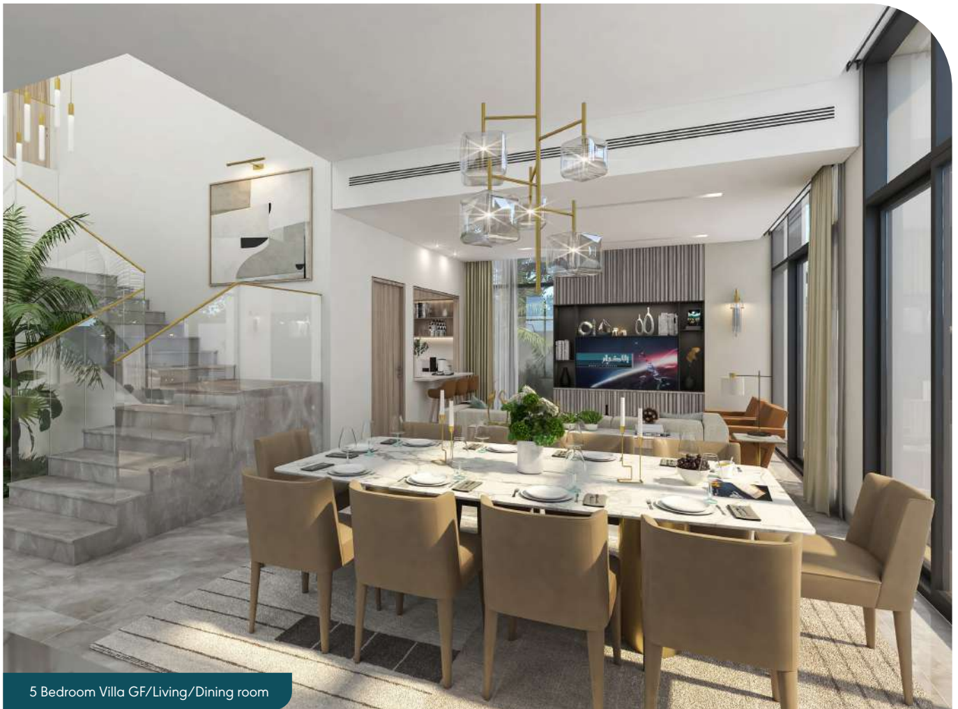
5 Bedroom Villa GF/Living/Dining room