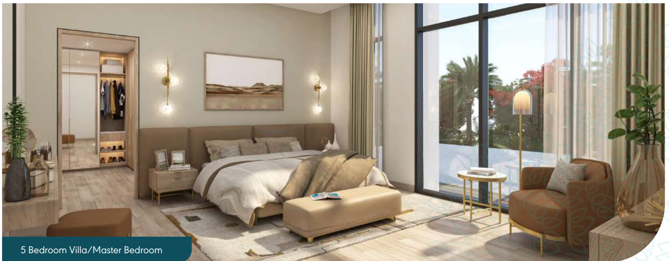
5 Bedroom Villa/Master Bedroom

Villas are available with a choice of layout options and the opportunity to design a home that uniquely suits you.