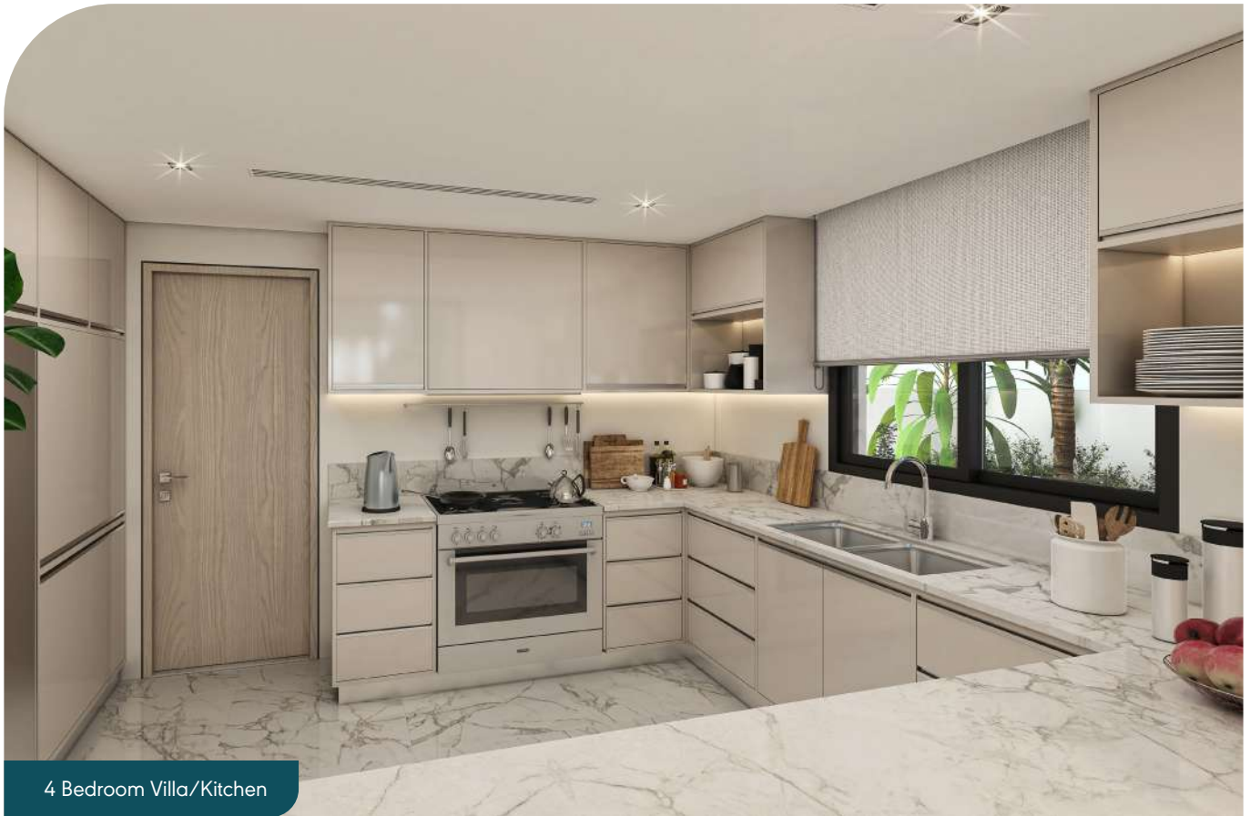
4 Bedroom Villa/Kitchen