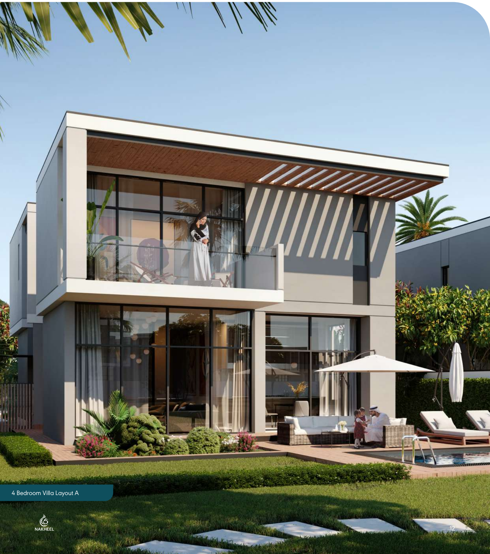
4 Bedroom Villa Layout A

The four bedroom villa design retains all the elegance and modernity of the five-bedroom villa designs. These homes still feature a garage with space for three cars, an elevated large shaded balcony that overlooks the rear garden and a swimming pool.