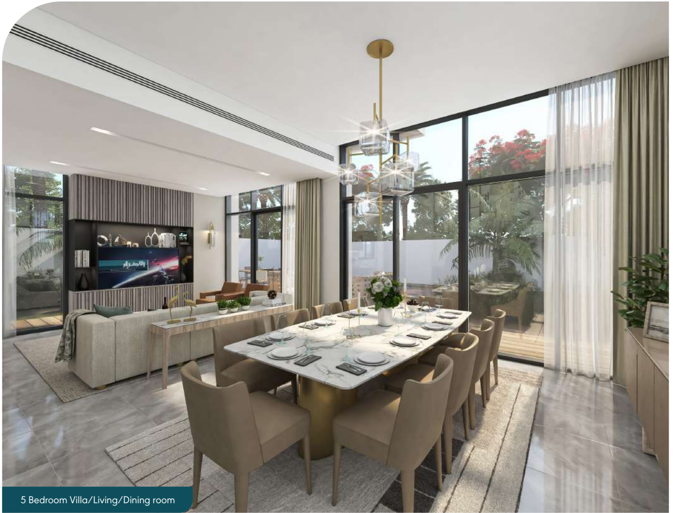
5 Bedroom Villa/Living/Dining room