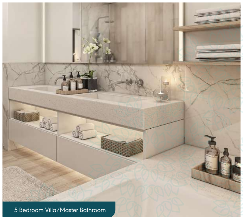
5 Bedroom Villa/Master Bathroom