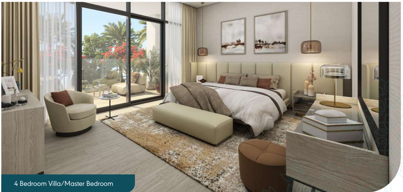
4 Bedroom Villa/Master Bedroom

The entrance foyer leads directly into the living area, benefitting from the natural light coming in through the floor-to-ceiling glazing and offering a view of the rear garden. On the ground floor is a closed kitchen, ample storage space, a maid's room and a guest bedroom with bathroom.