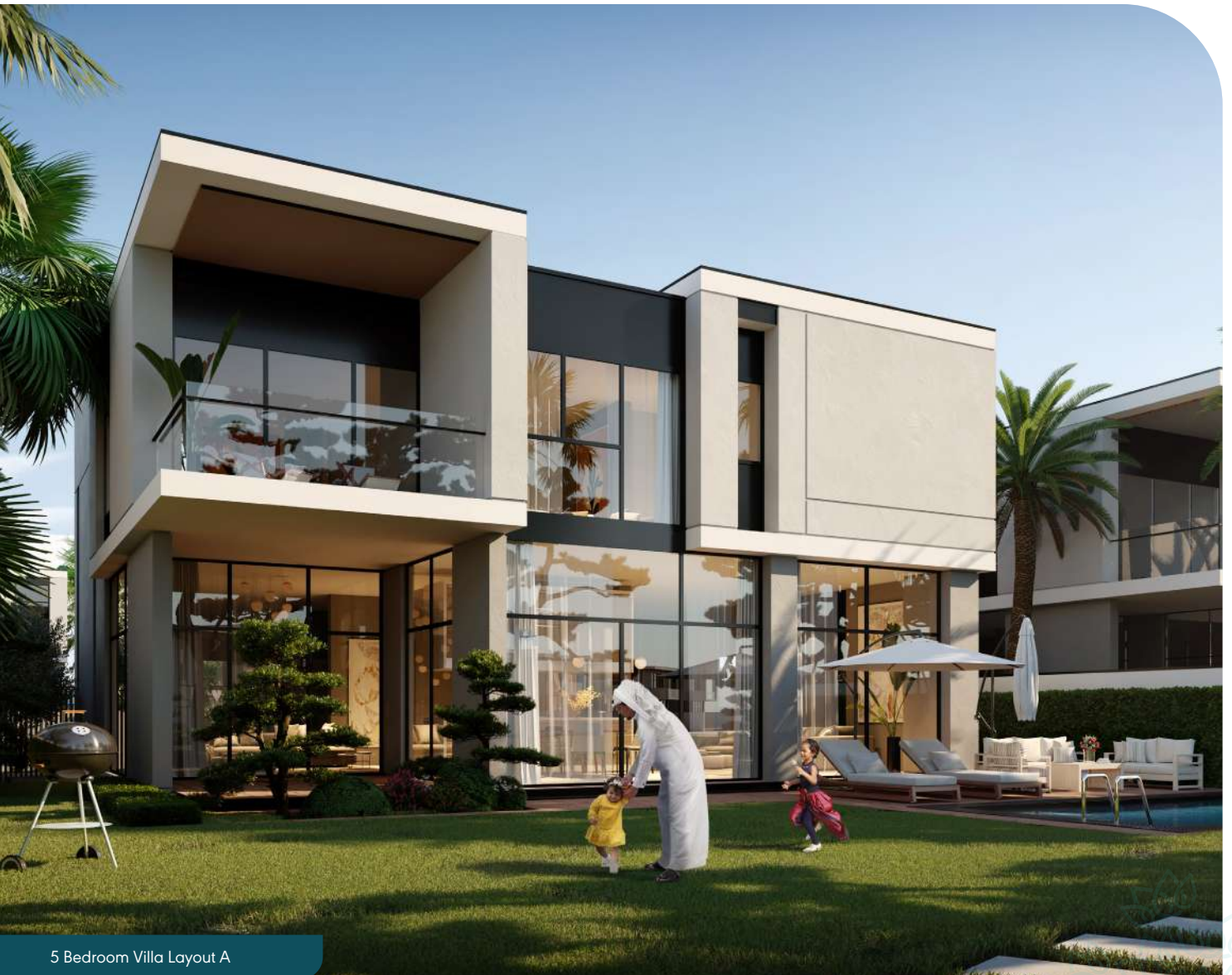
5 Bedroom Villa Layout A

In the designs of the five-bedroom and four-bedroom villas, modernity speaks volumes. A grand entrance foyer offers a welcoming and impressive greeting area that leads to an expansive living room with floor-to-ceiling windows framing stunning views of the garden.