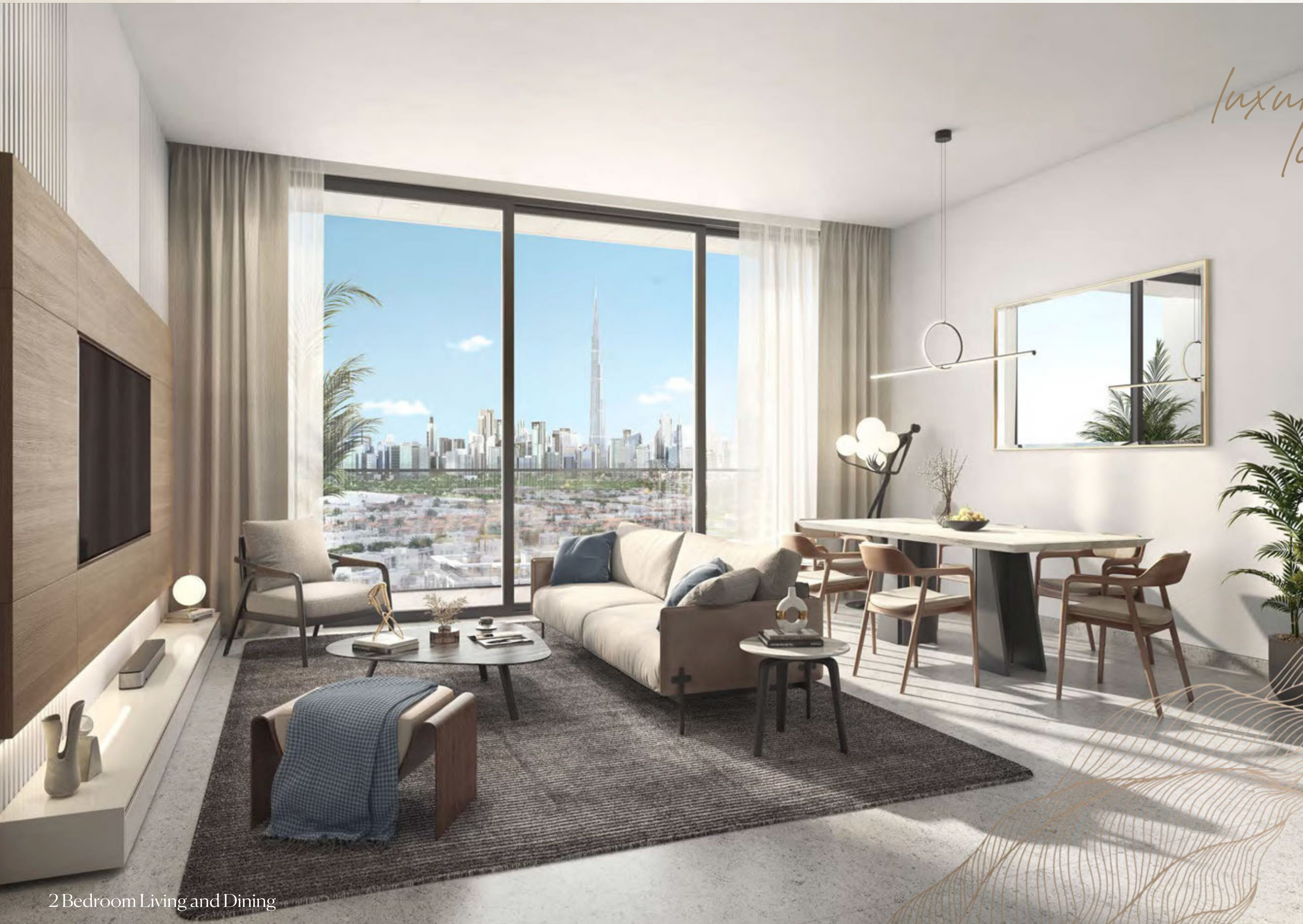
2 Bedroom Living and Dining