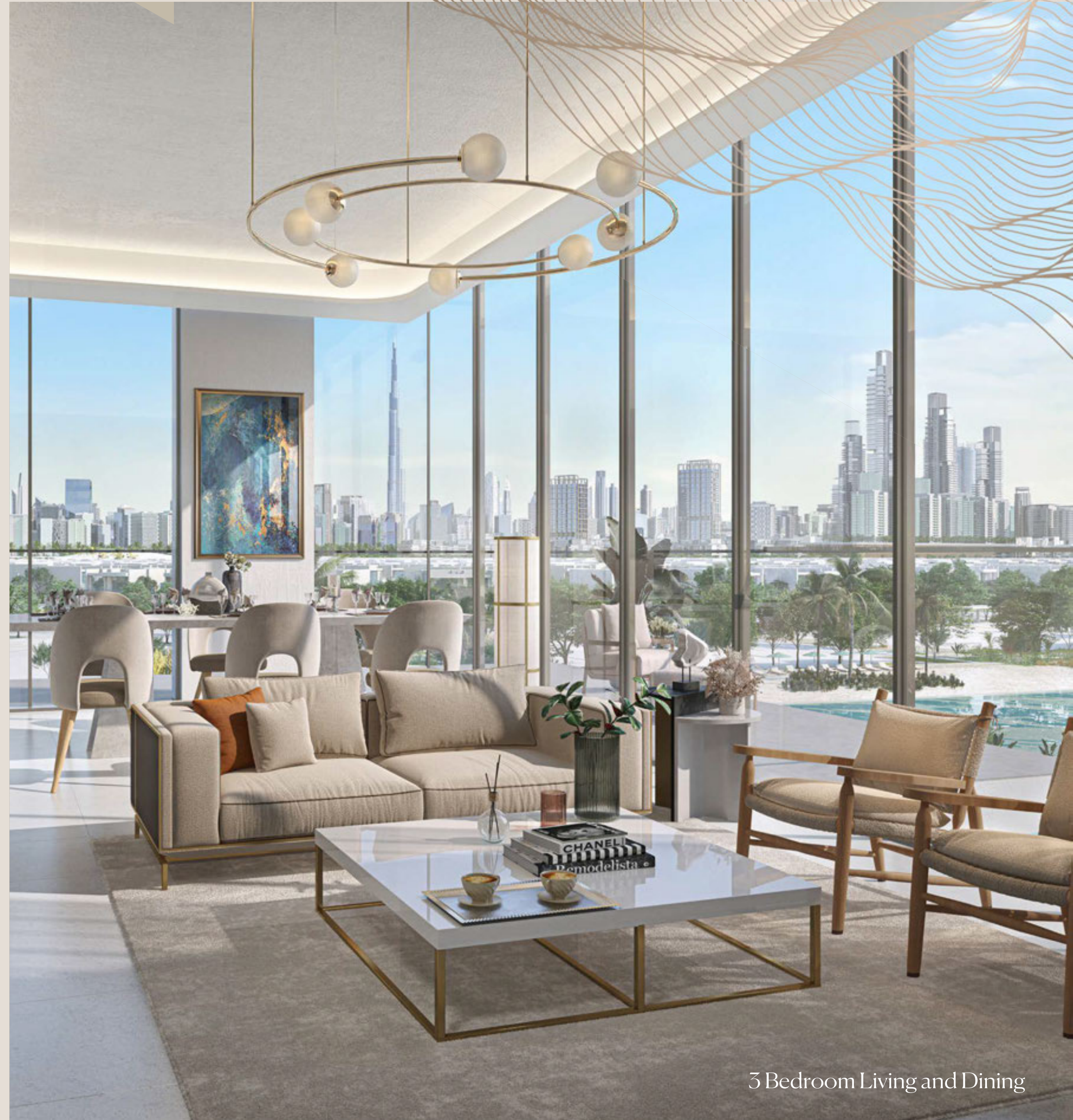
3 Bedroom Living and Dining