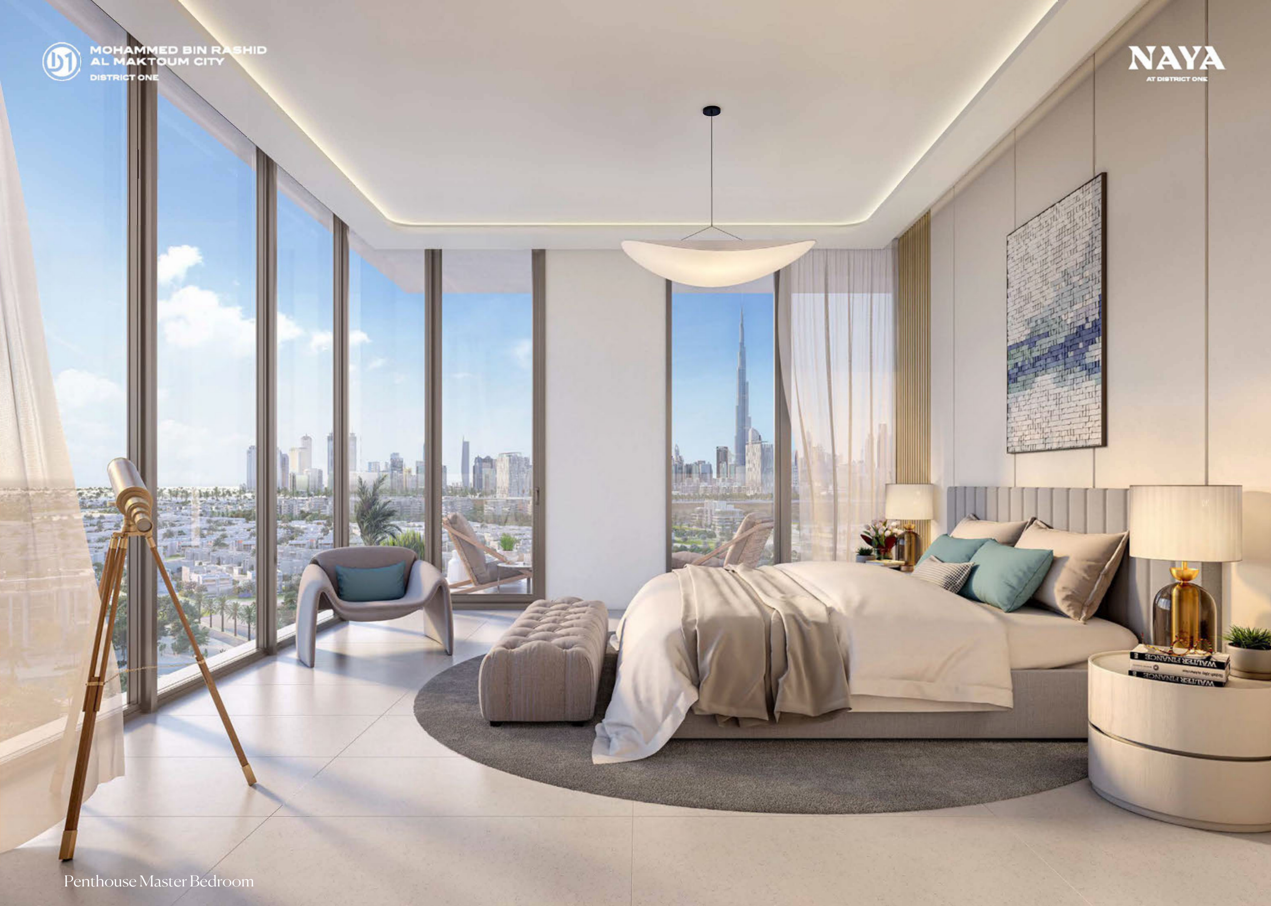
Penthouse Master Bedroom