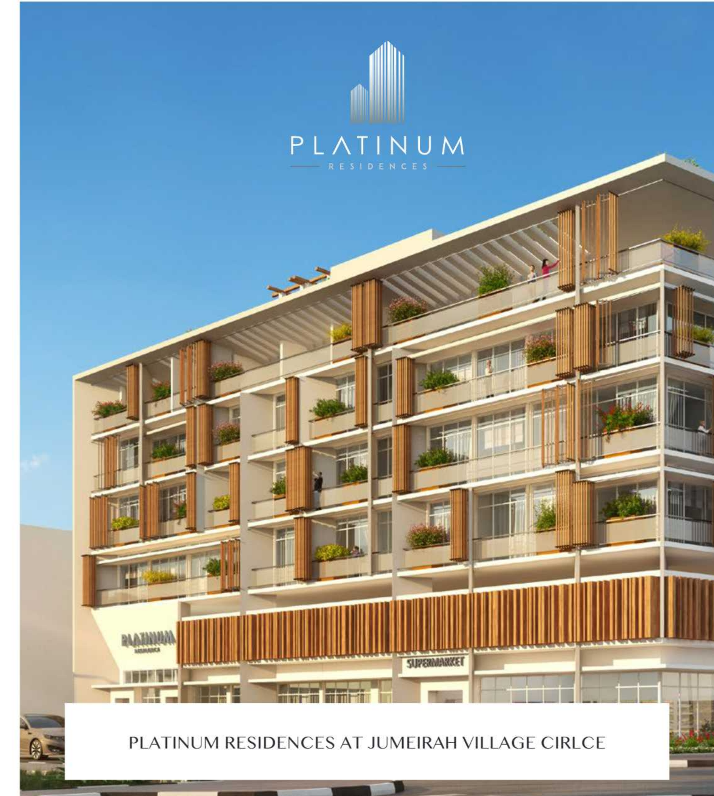
PLATINUM RESIDENCES AT JUMEIRAH VILLAGE CIRCLE

North 43 is the property development arm of Naseeb Group, a family-owned business that has been operating since 1982. Naseeb Group operates across a range of industries including trading, agriculture, F&B, and fashion.