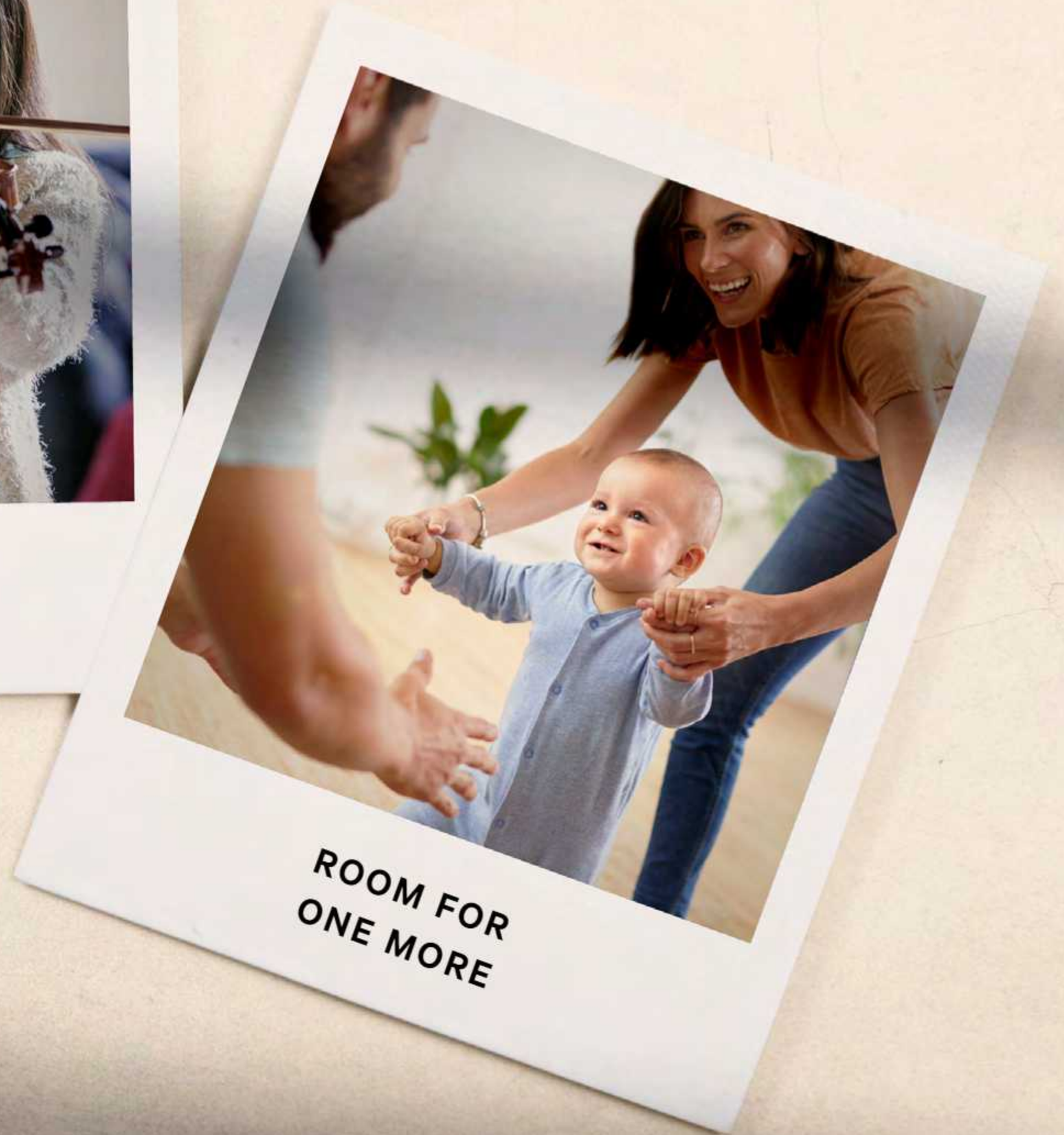
ROOM FOR ONE MORE