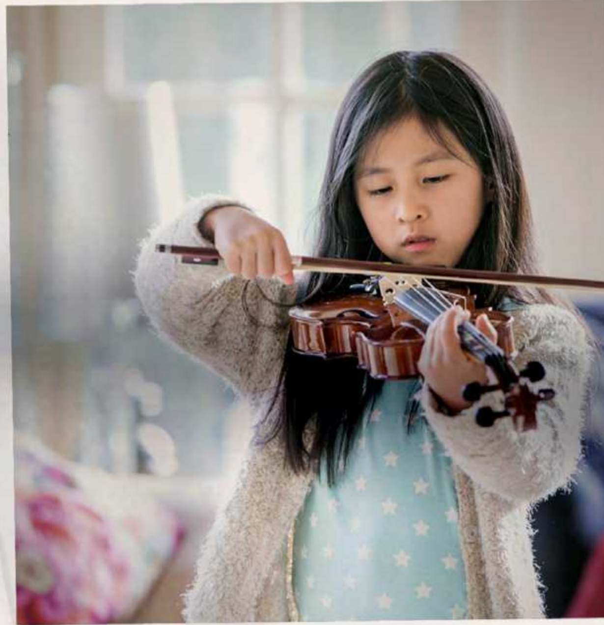
MORE ROOM FOR GROWTH