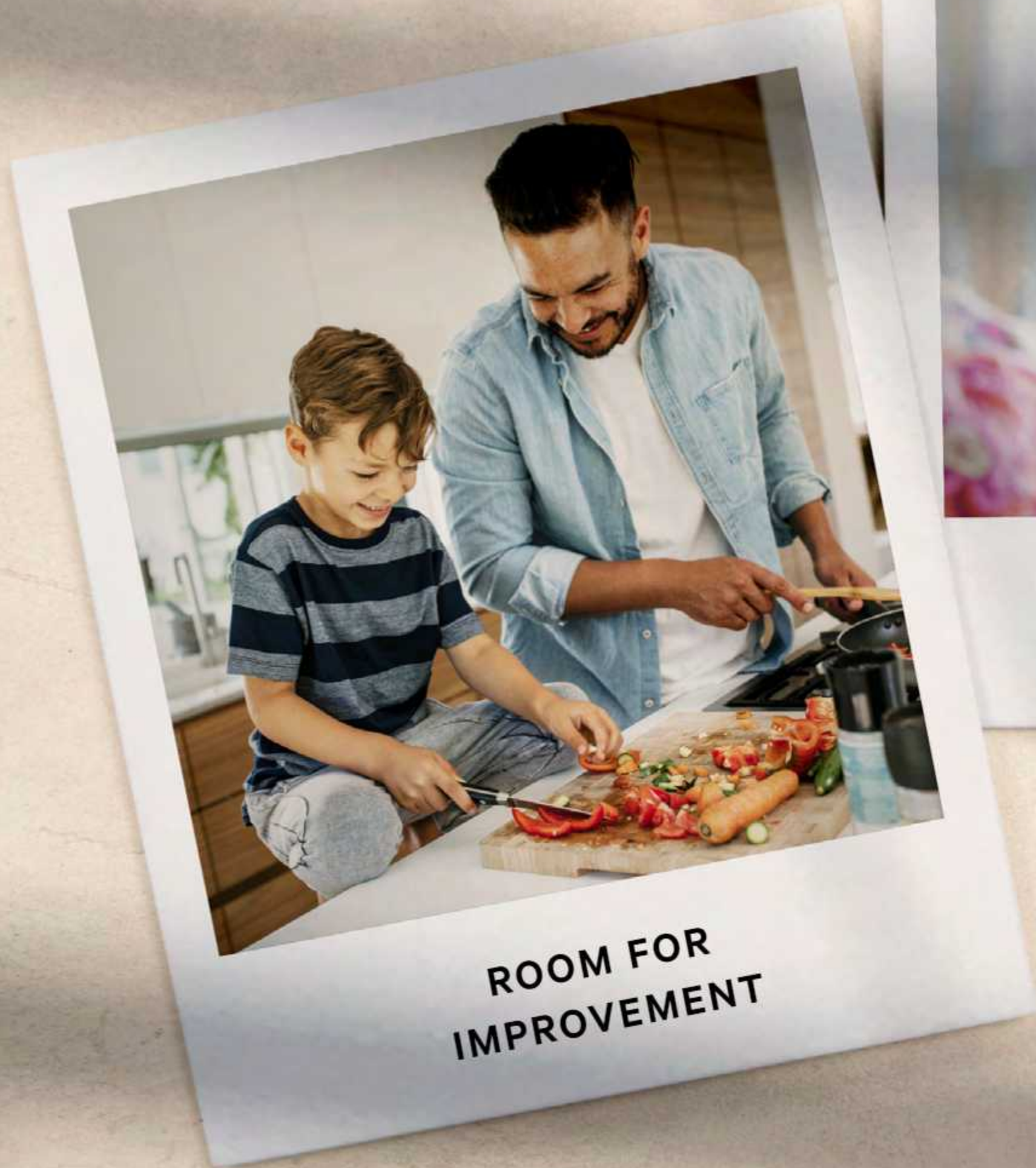
ROOM FOR IMPROVEMENT