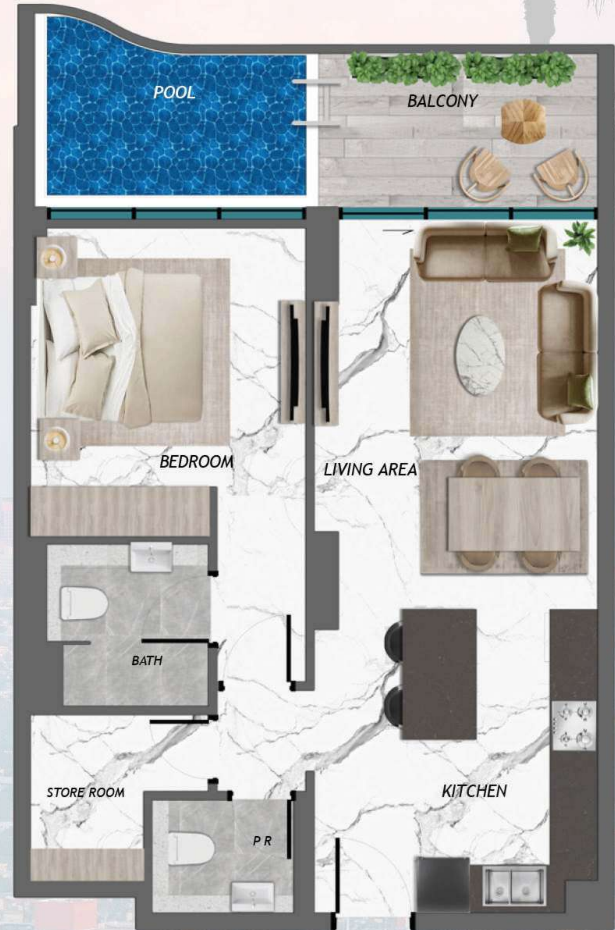
1 BR WITH POOL