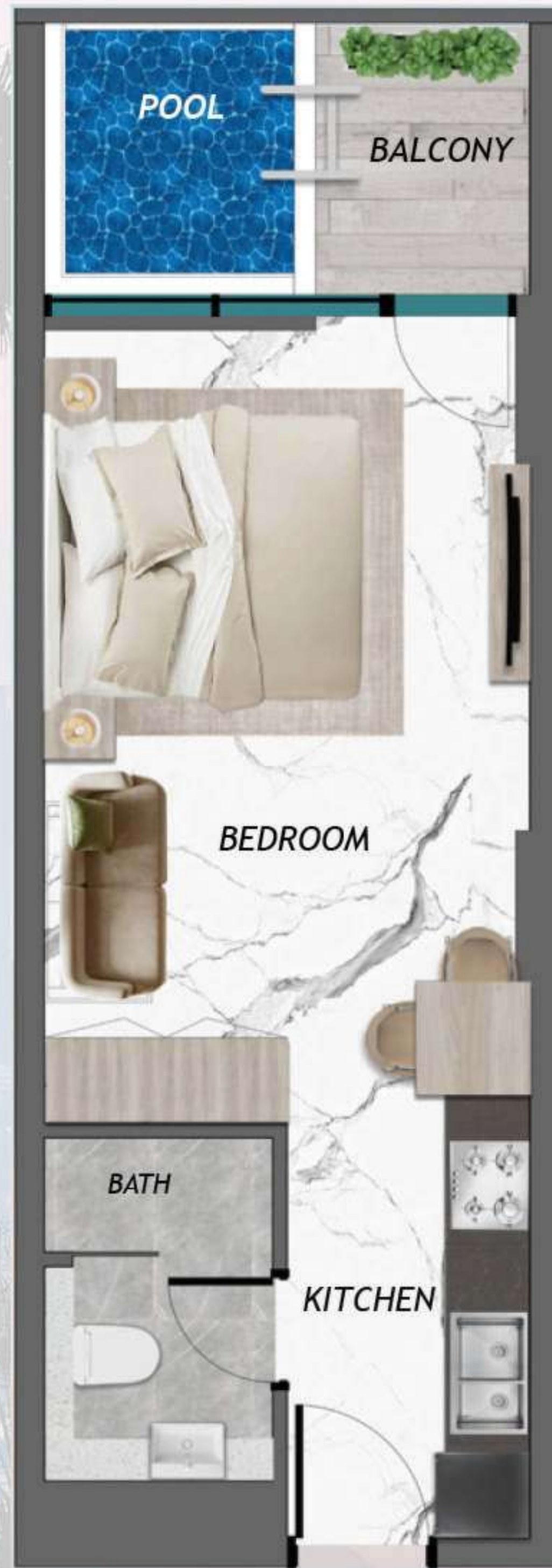
Studio WITH POOL