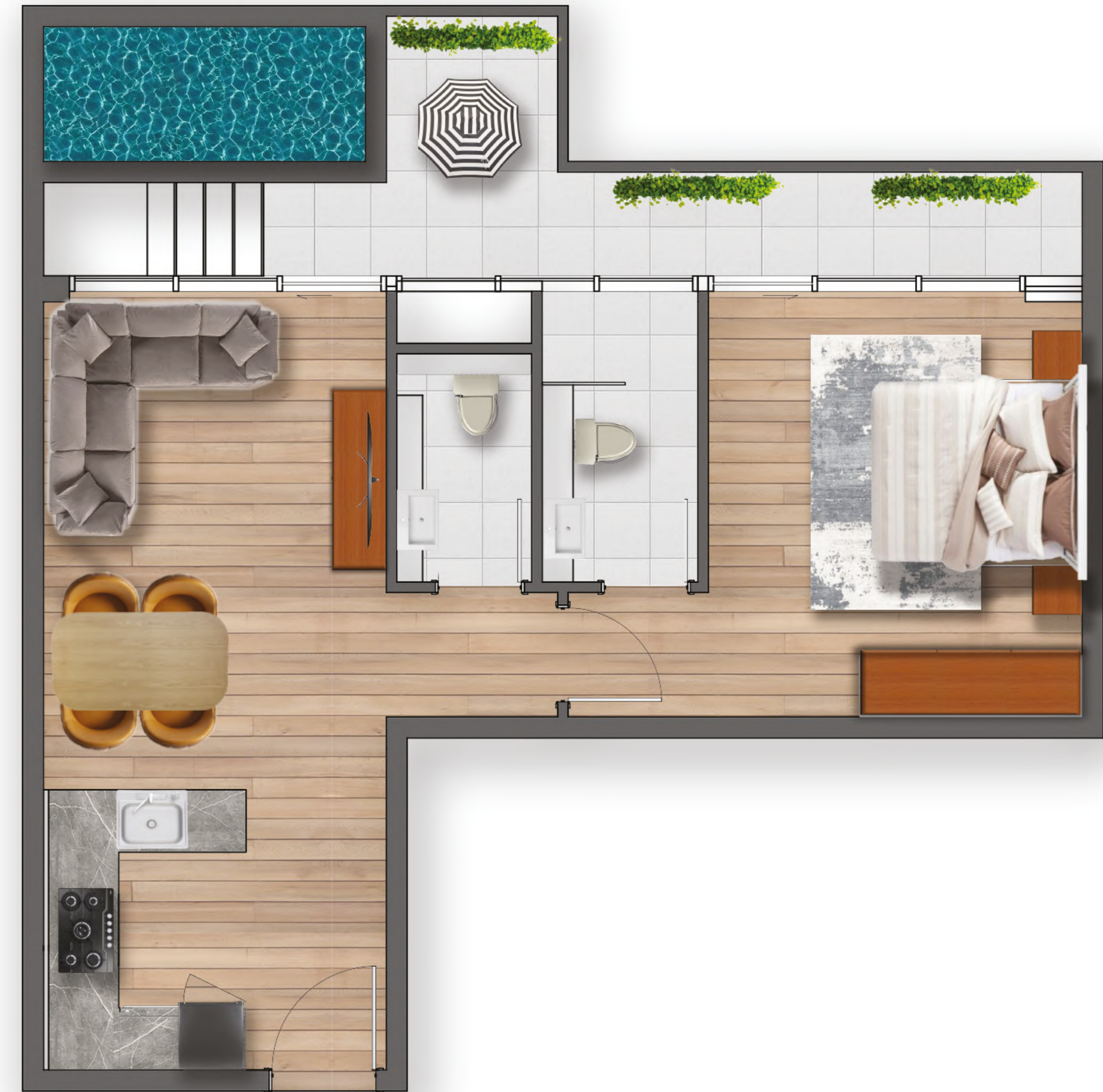
ONE BEDROOM WITH PRIVATE POOL