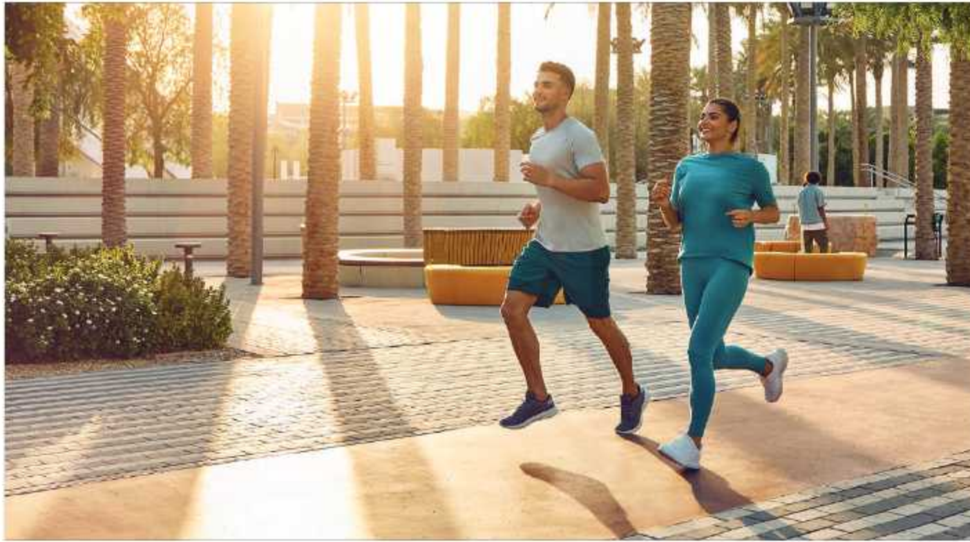
4.5 km of pedestrian tracks and 5.2 km of cycling trails