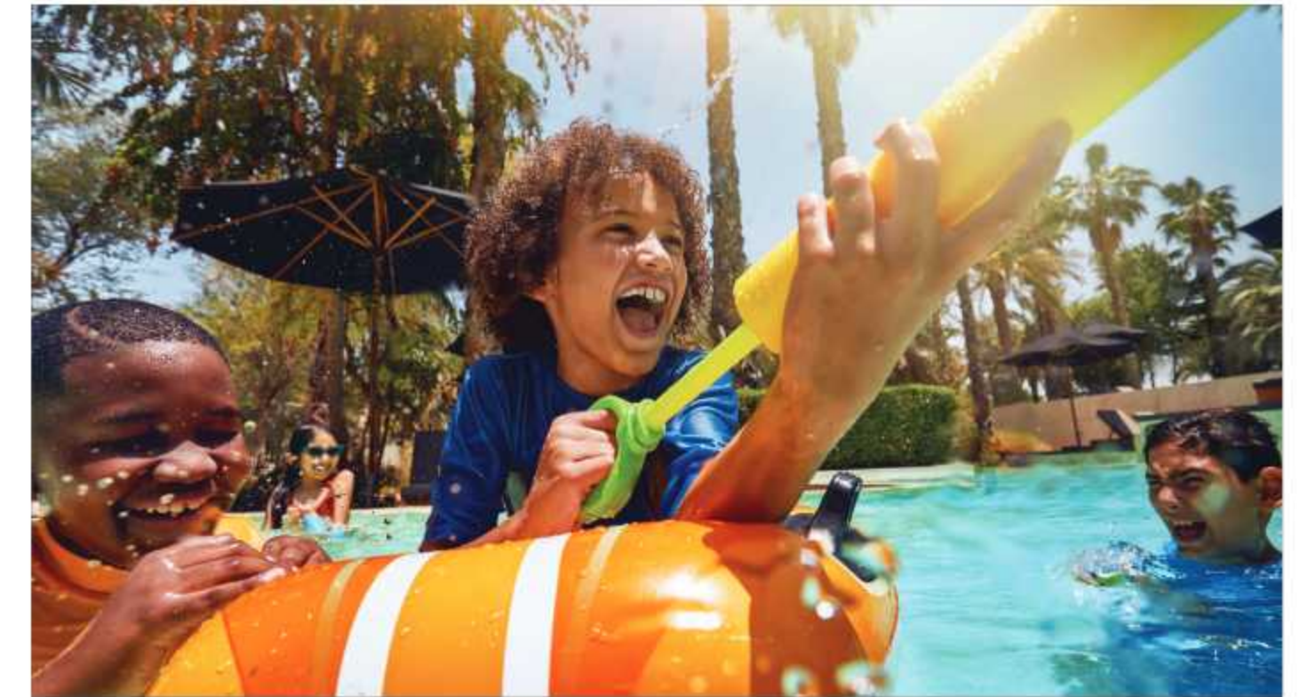
Swimming pools, splash pads and kids' play areas