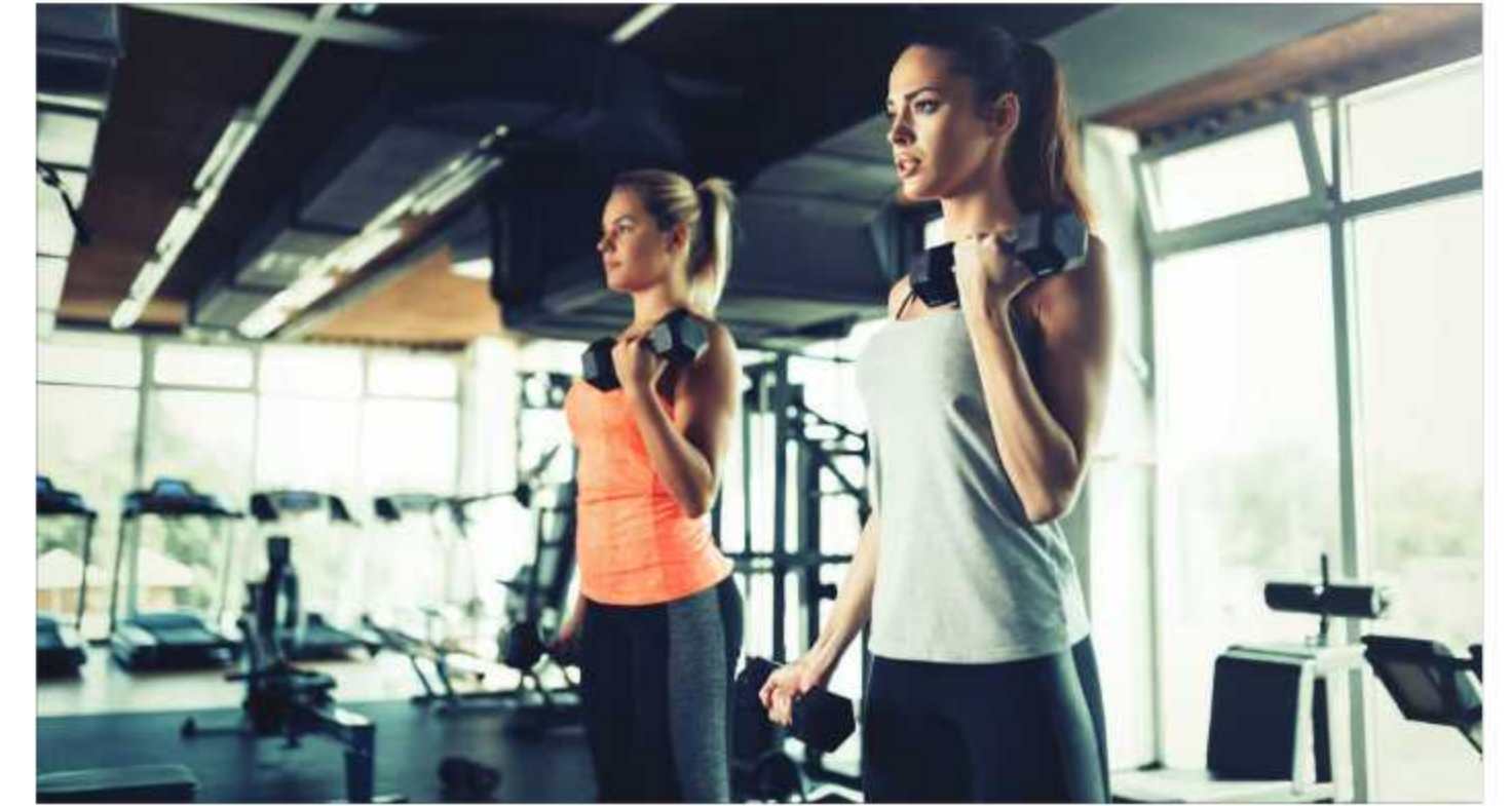
Gyms, outdoor wellness and fitness areas