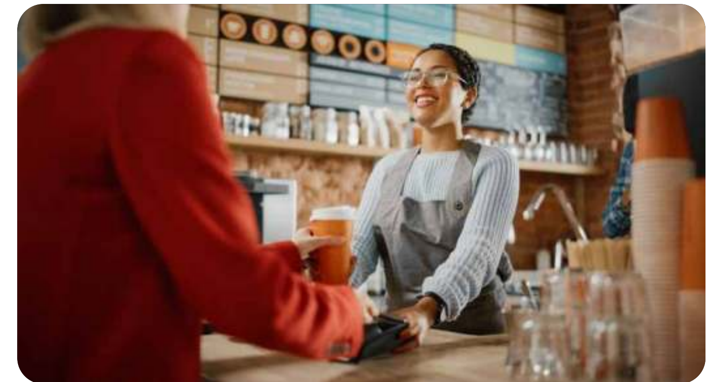
Convenience stores, retail and dining options