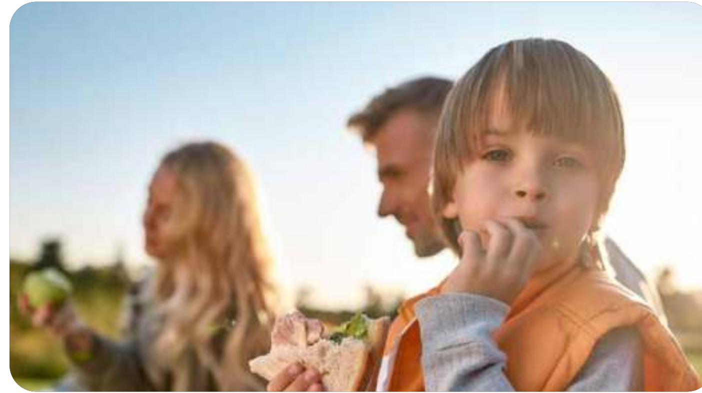
BBQ area and outdoor dining pavilion and lounge pavilion