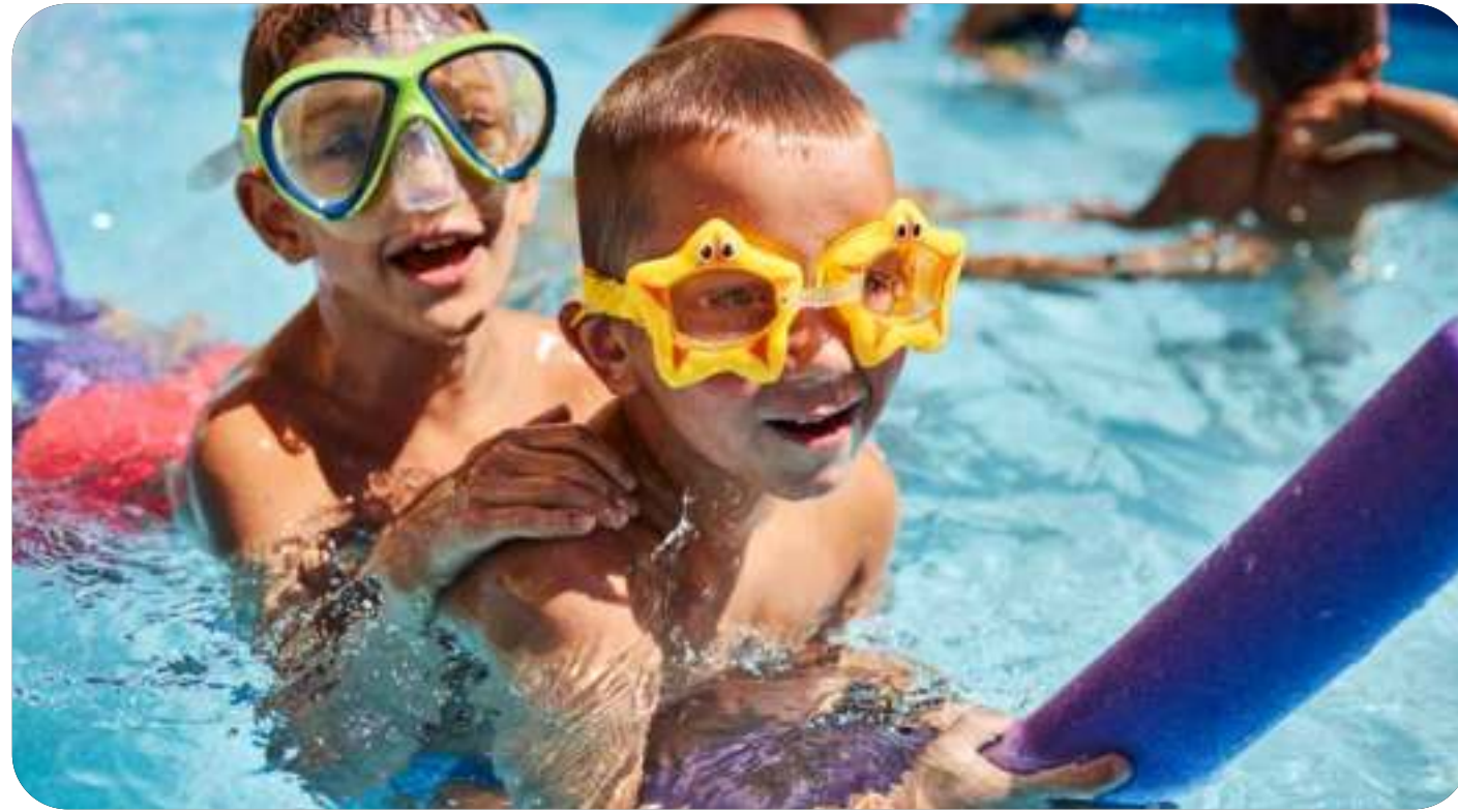
Swimming pools including a lap pool, shallow pool deck, kids' pool, pool pavilion, pool deck, pool shower