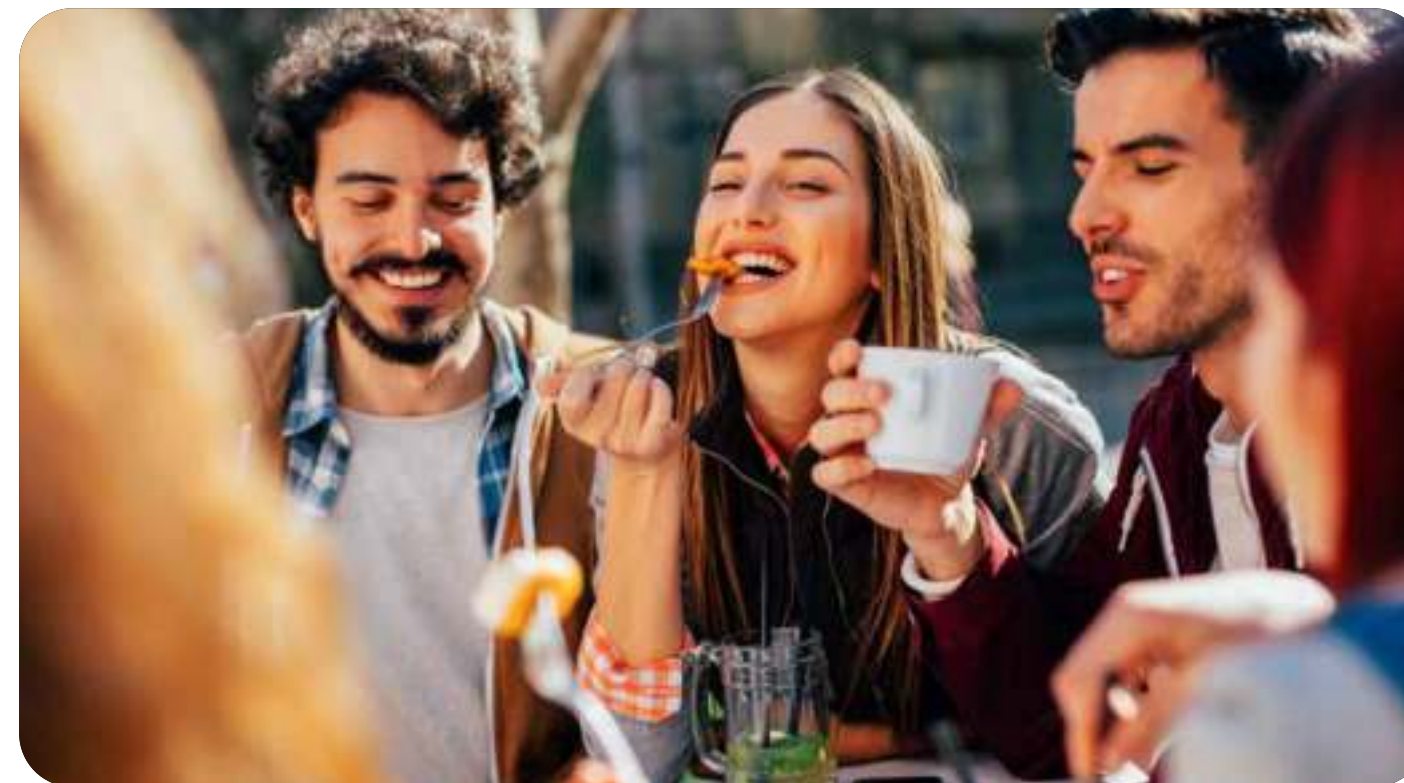
Multi-purpose room and multi-function lawn