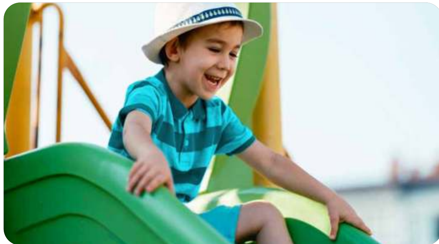
Outdoor kids' play area and outdoor fitness area