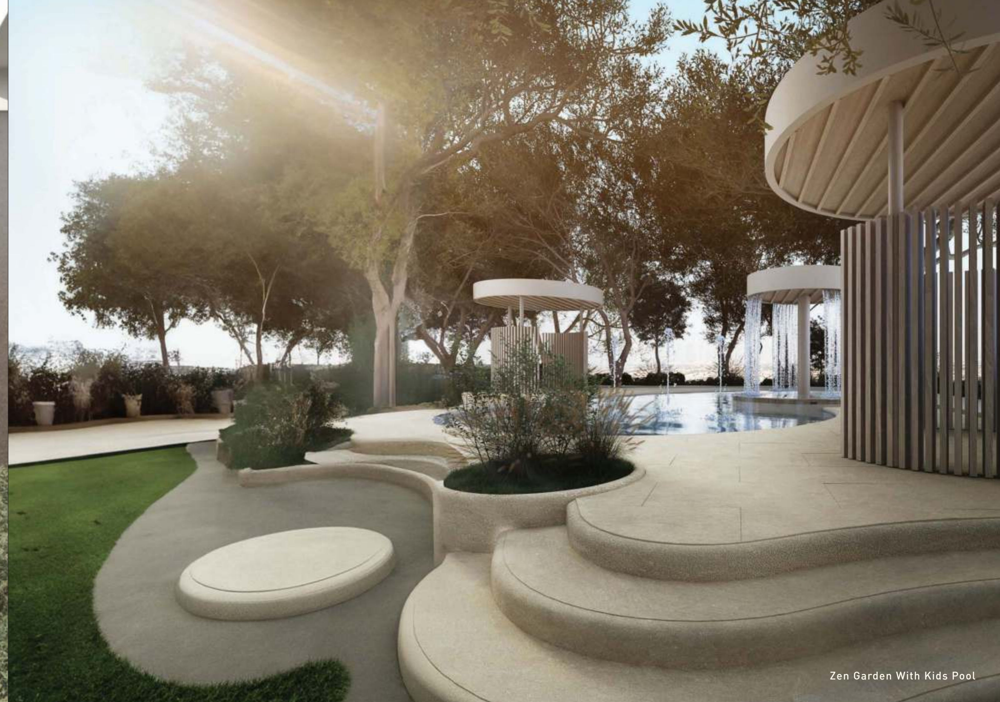
Zen Garden With Kids Pool