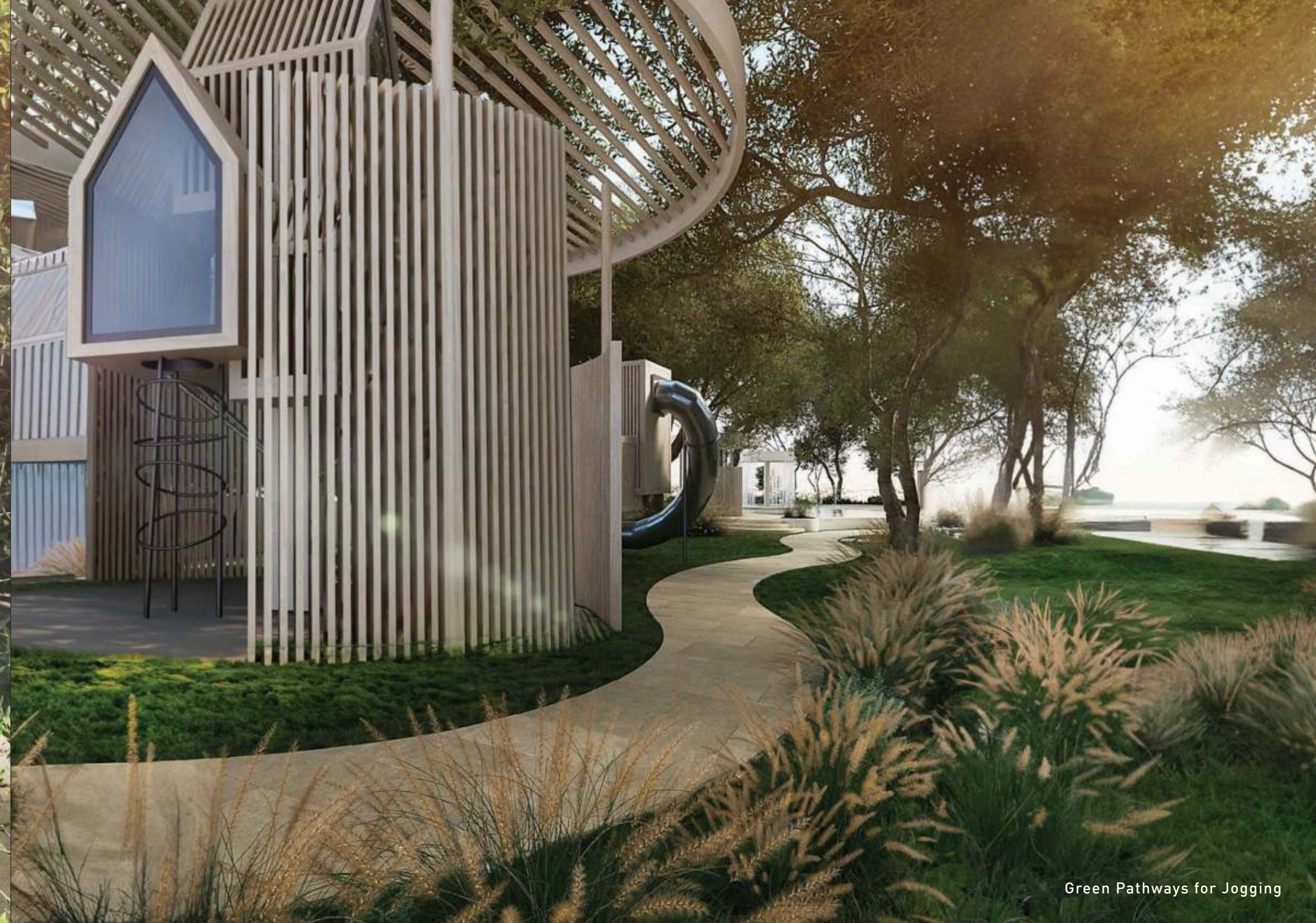
Green Pathways for Jogging