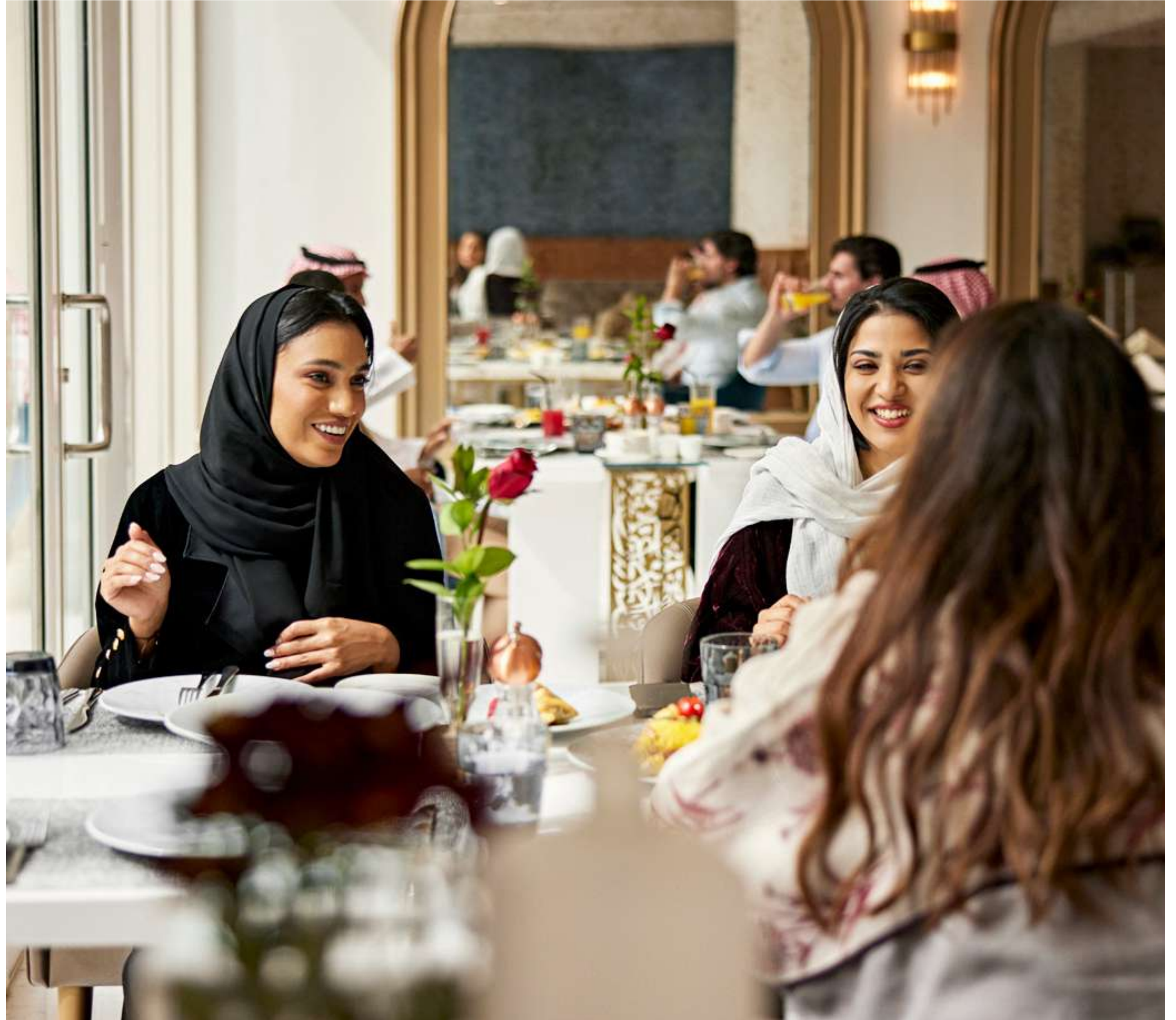
Retail & Dining