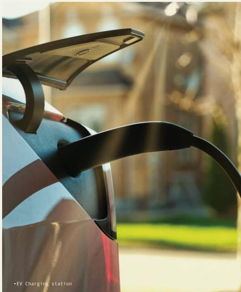
•EV Charging station

At Symbolic Alpha, we go the extra mile with electric vehicle charging stations. Encouraging ecoconscious living, conveniently located on-site for residents to charge their cars. Join us in reducing our carbon footprint and embracing a cleaner, greener future.