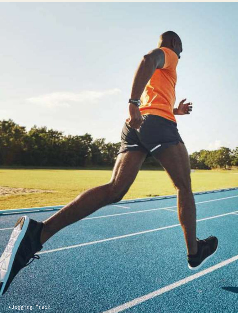
• Jogging Track