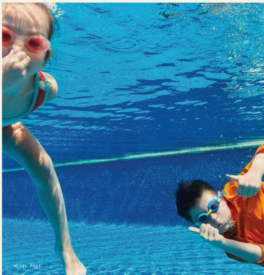
• Kids Pool

A separate kid's pool, located next to our main swimming pool, with shallow depths and fun water play equipment. Parents can relax while their little ones create unforgettable memories in a fun and safe environment.