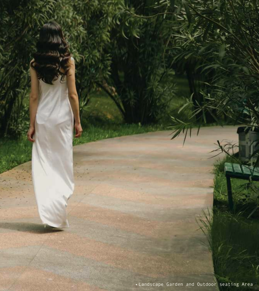
•Landscape Garden and Outdoor seating Area