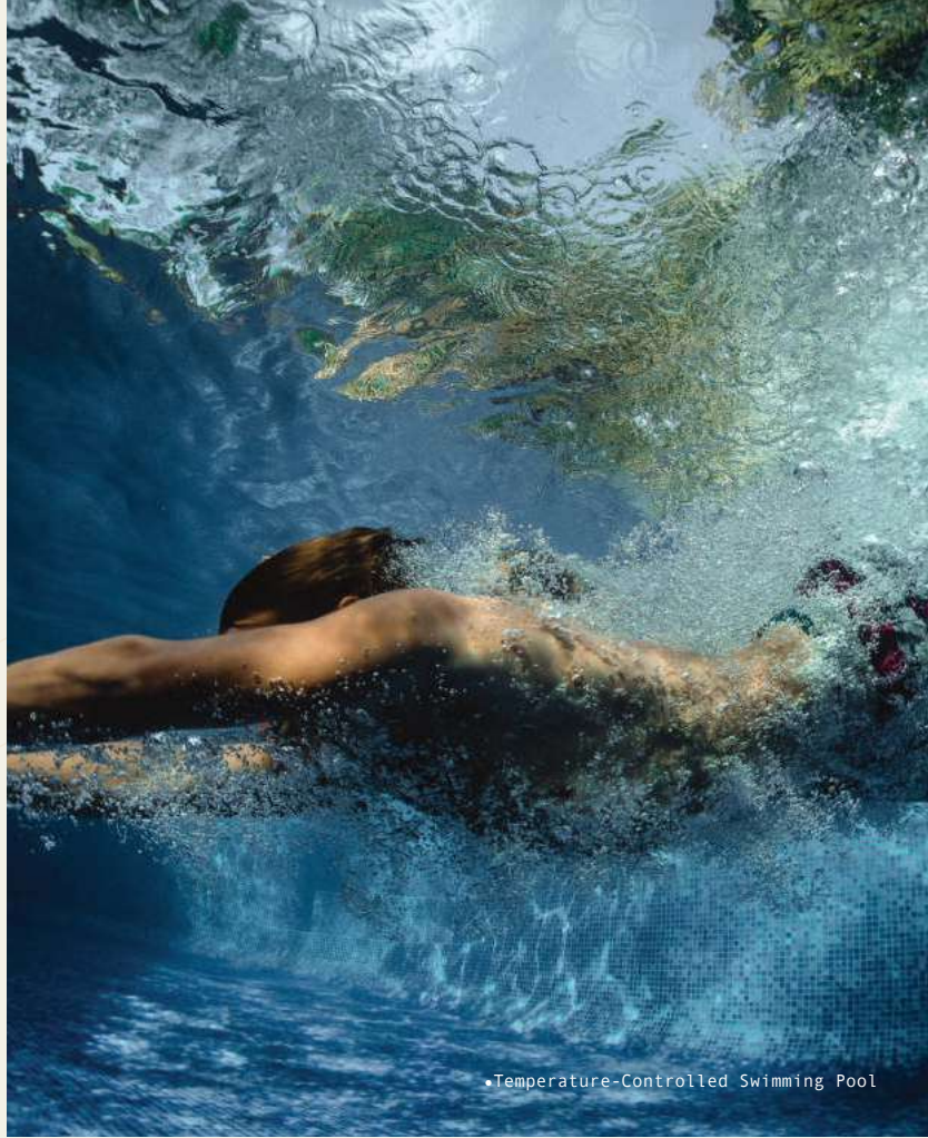
• Temperature-Controlled Swimming Pool

Imagine gliding through crystal-clear waters, caressed by the perfect temperature that remains blissfully constant, inviting you for a refreshing dip no matter the season. Feel the gentle embrace of the water as you embark on a leisurely swim or power through invigorating laps to keep your body and mind in perfect harmony.