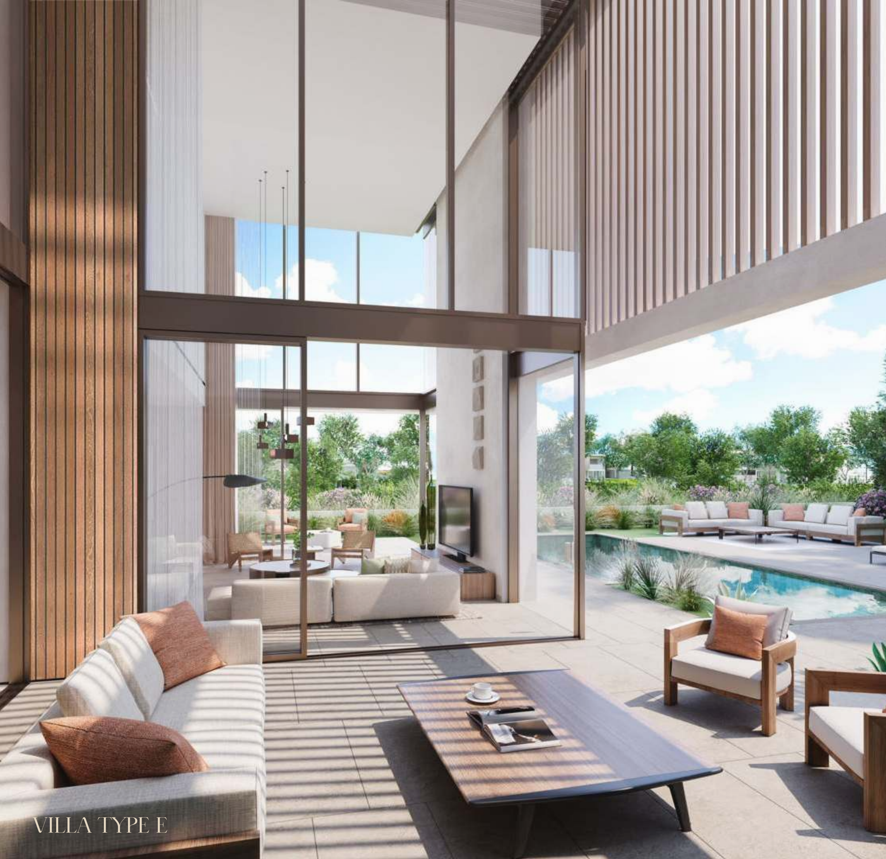
VILLA TYPE E