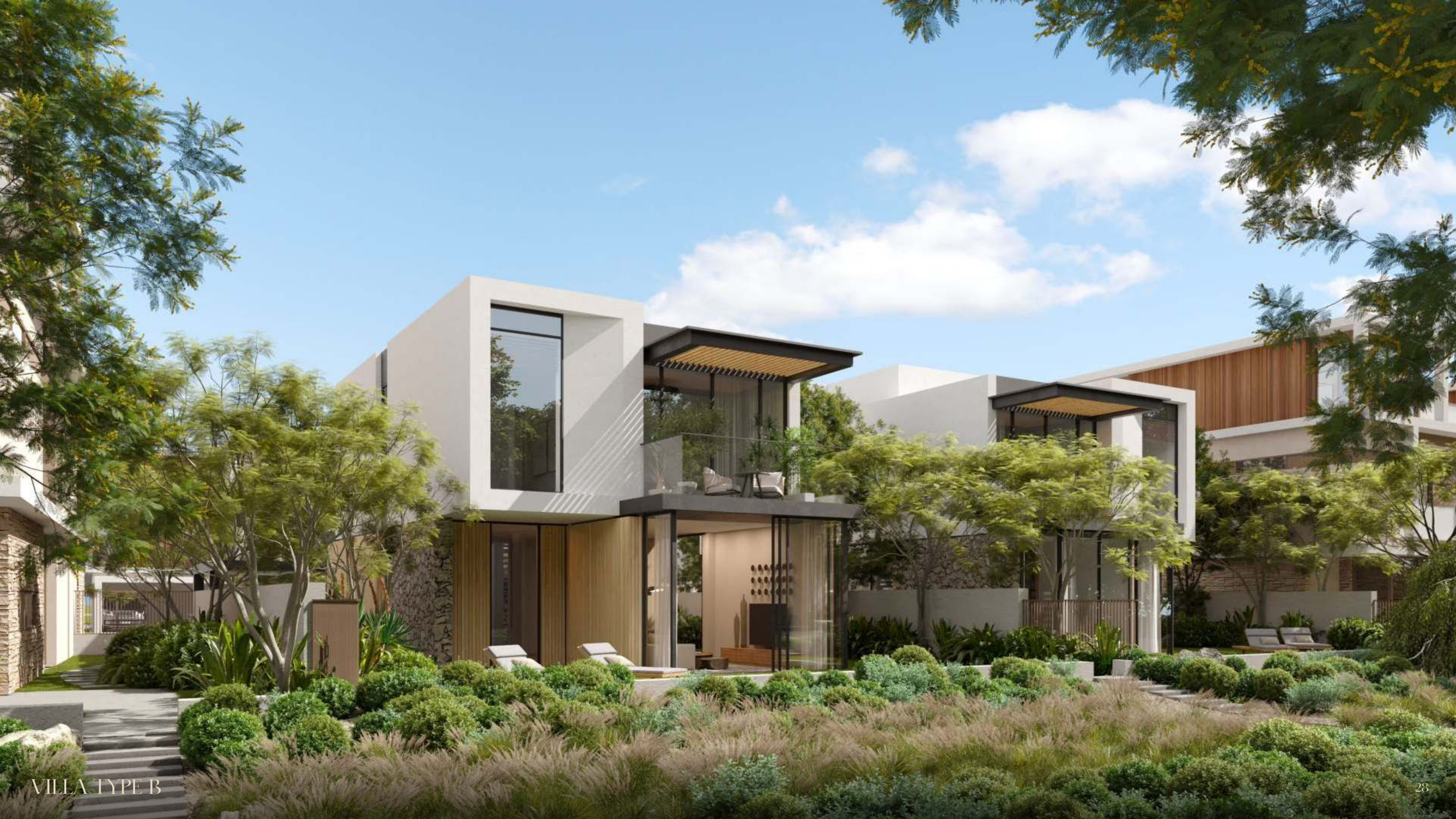
VILLA TYPE B