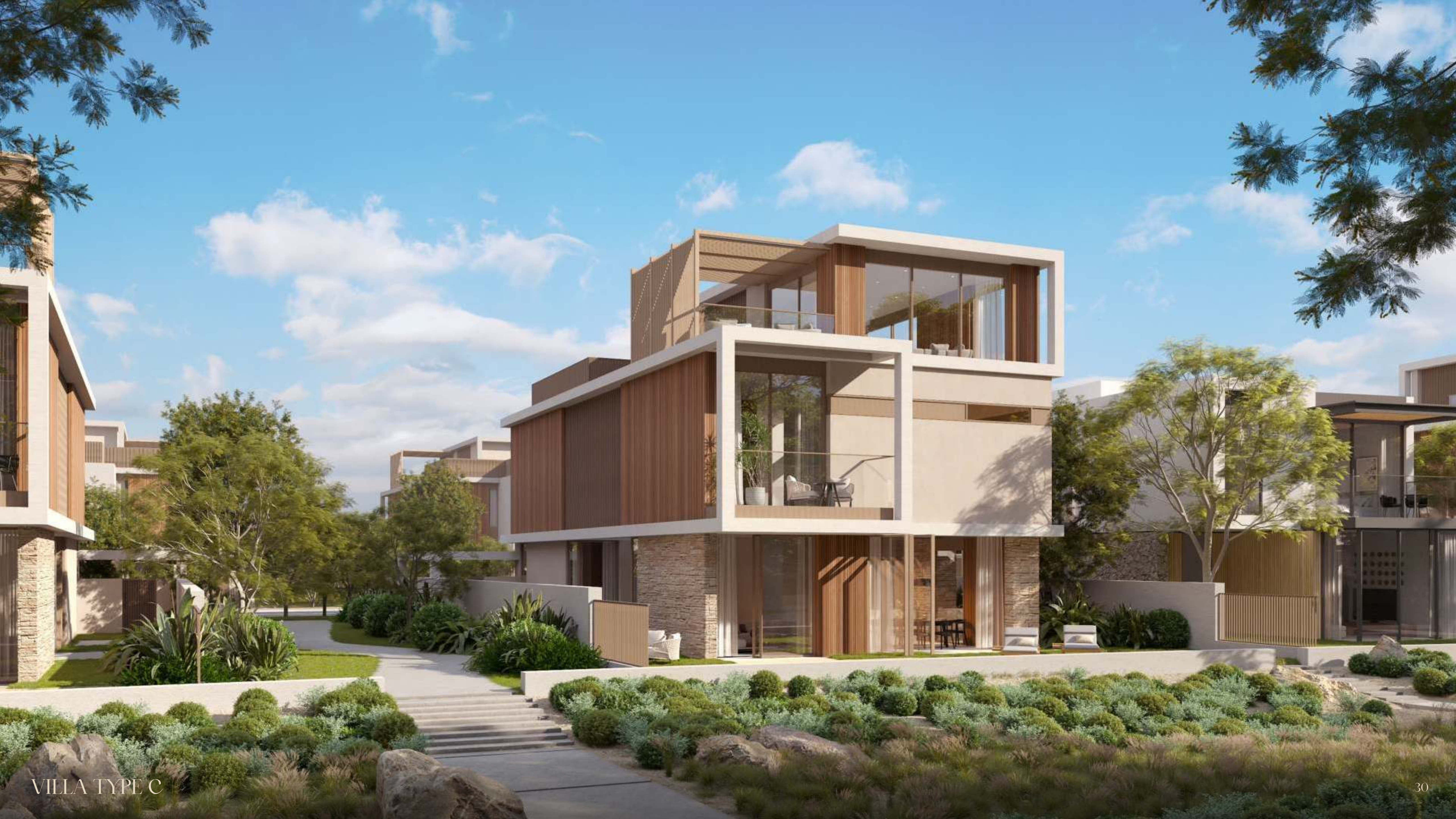
VILLA TYPE C