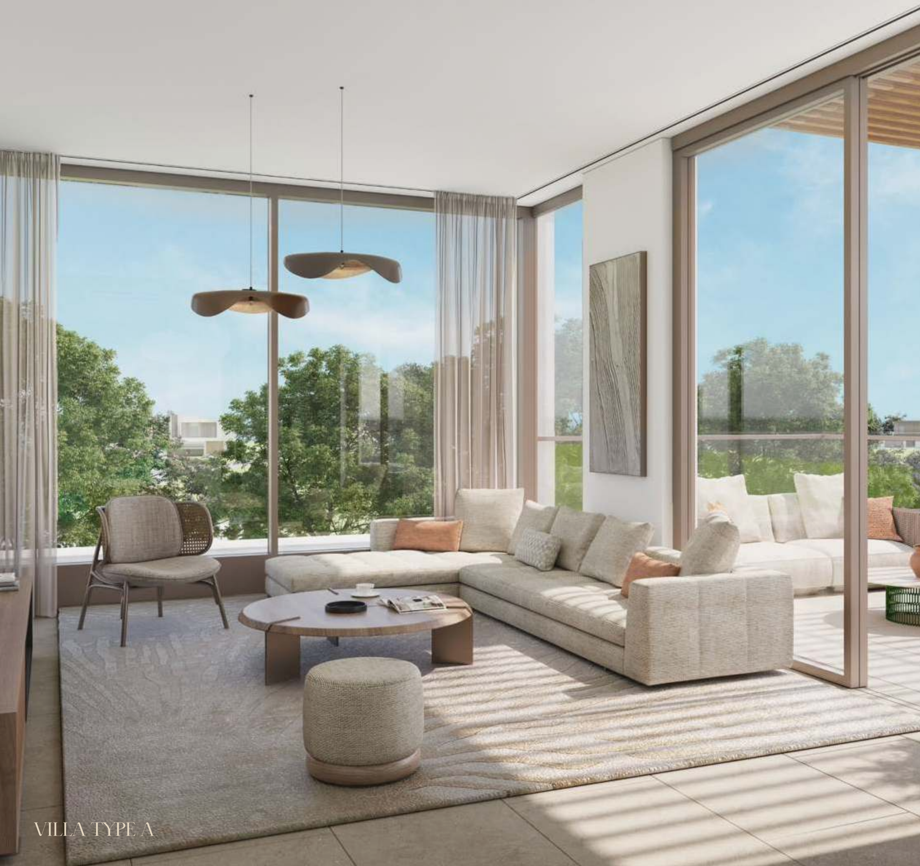
VILLA TYPE A