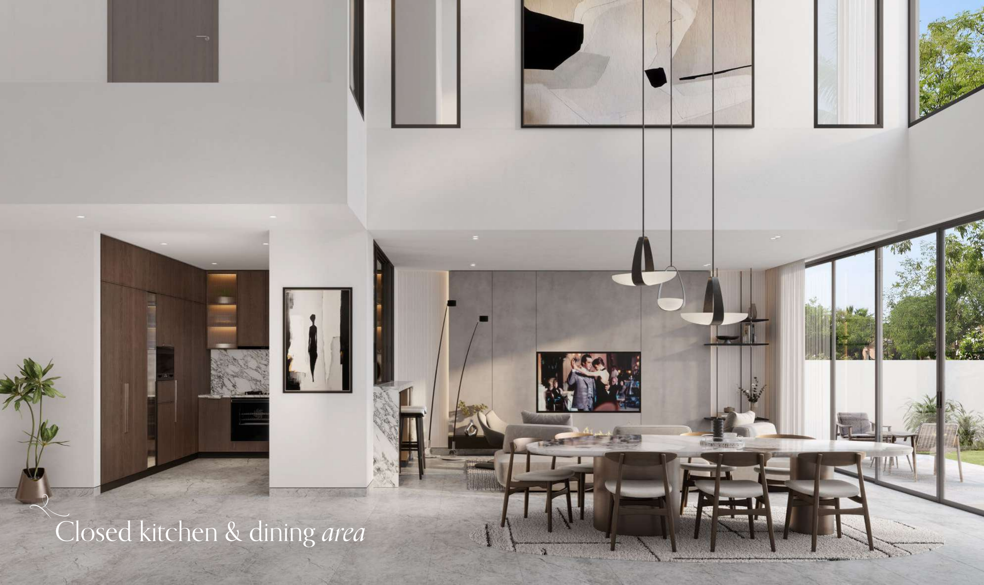
Closed kitchen & dining area