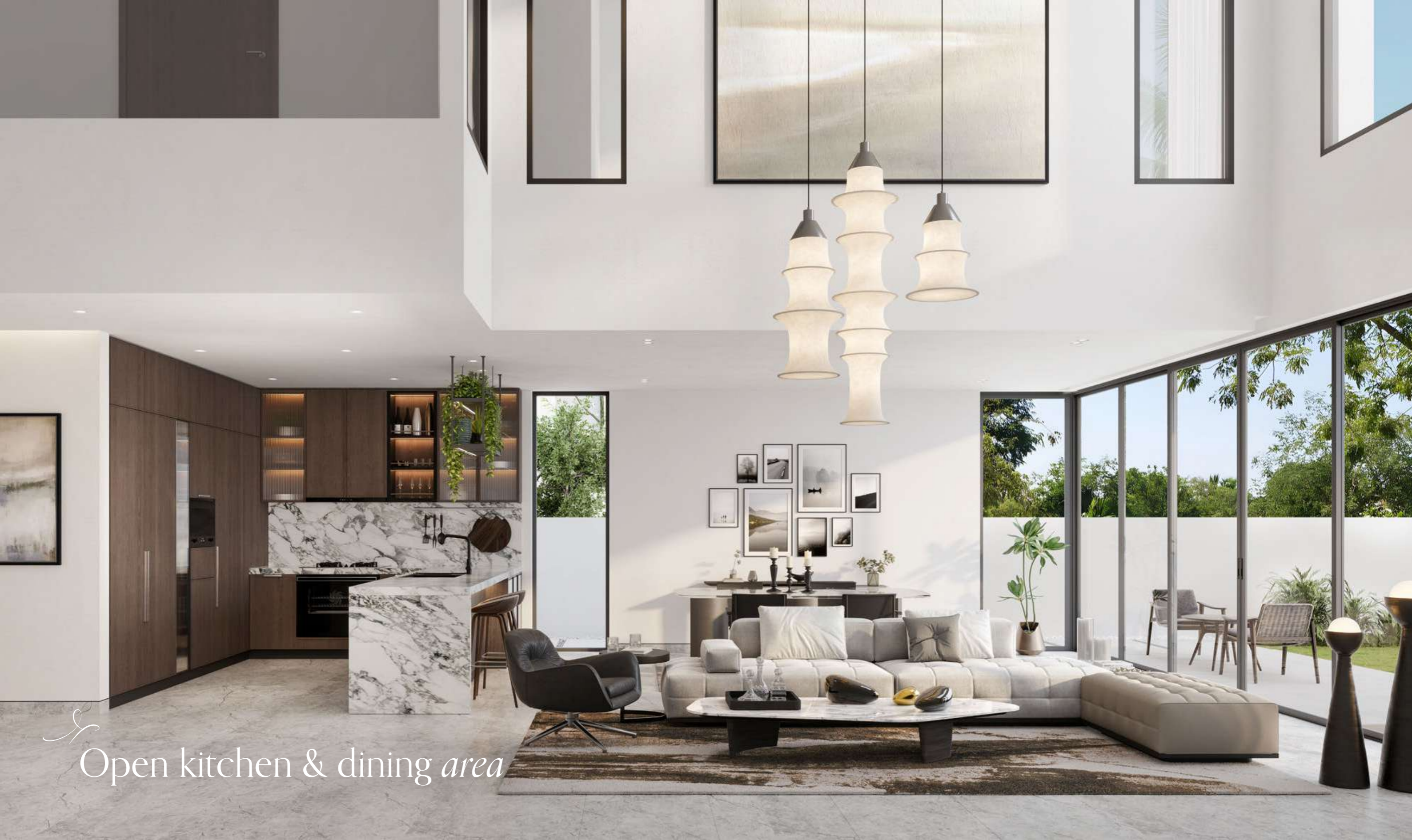
Open kitchen & dining area